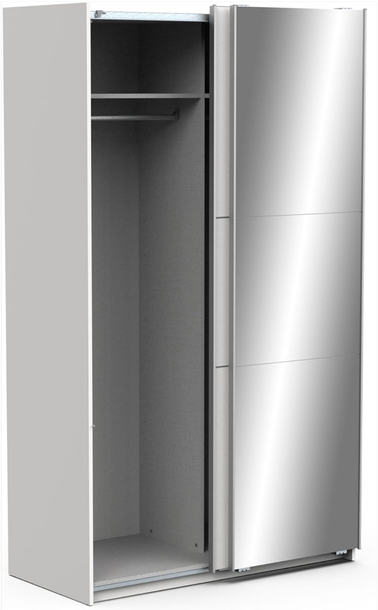
Image: A detailed view of the sliding door edge and its grey metal profile, illustrating the mechanism.