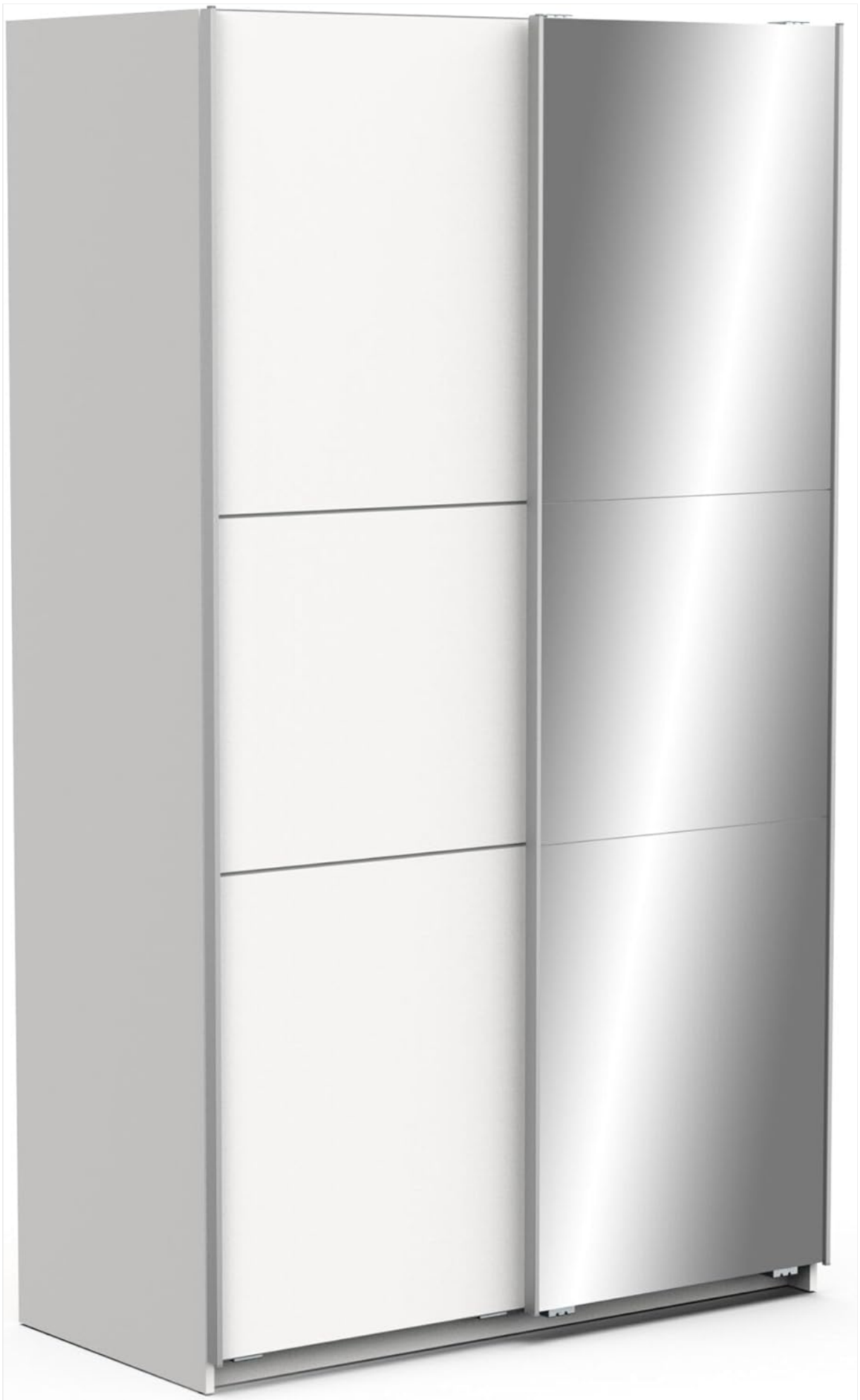
Image: A full view of the Demeyere 190008 wardrobe, highlighting its sliding doors and integrated mirror.