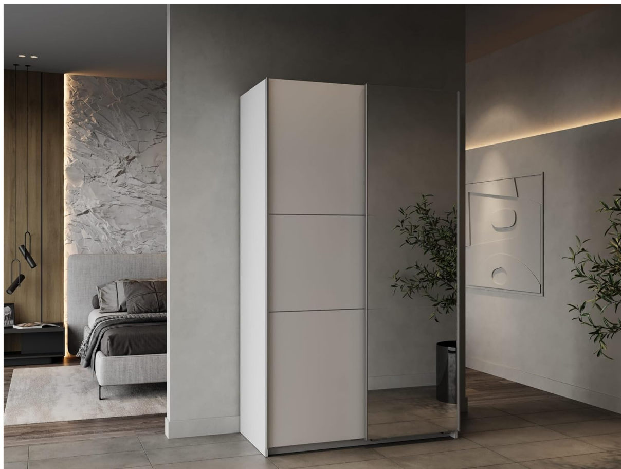
Image: The Demeyere 190008 wardrobe with sliding doors and mirror, positioned in a contemporary room.

This manual provides comprehensive instructions for the assembly, operation, and maintenance of your Demeyere 190008 Sliding Door Wardrobe. Please read all instructions carefully before beginning assembly and retain this manual for future reference. This wardrobe features a modern design with matte white panels, grey metal finishes, and an integrated mirror, offering practical storage solutions for your home.