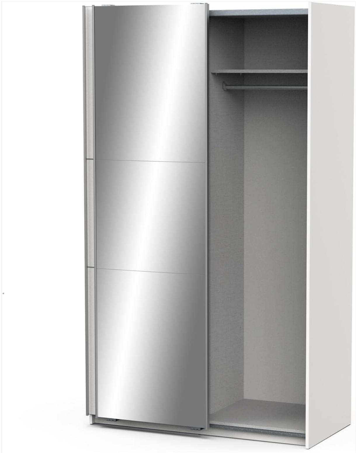
Image: The wardrobe interior, revealing the storage compartments, shelves, and hanging rail.