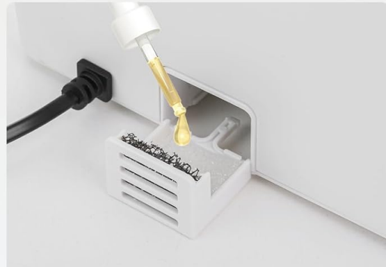
Open the aromatherapy box and add essential oils