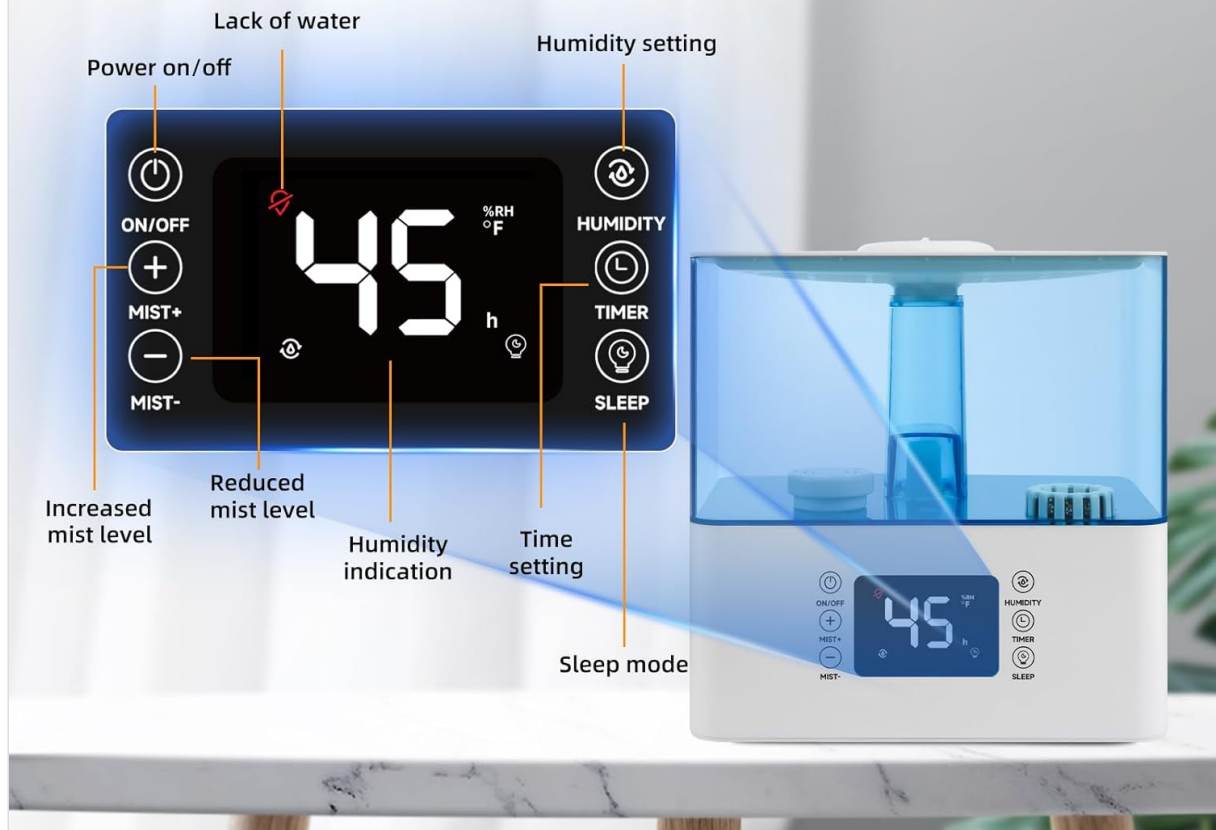
Image 4.1: An annotated image of the intelligent screen display, highlighting the functions of each button and indicator, such as Power On/Off, Mist Level, Humidity Setting, Timer, and Sleep Mode.

When there is a water shortage, the red indicator light comes on and the humidifier shuts off automatically