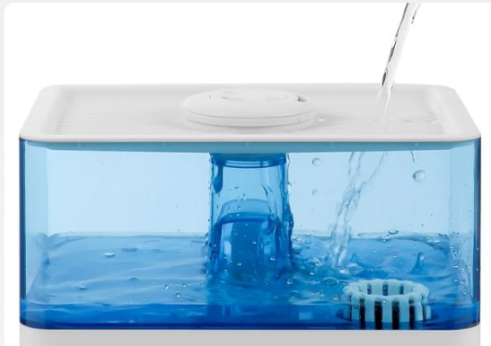
Water directly on top