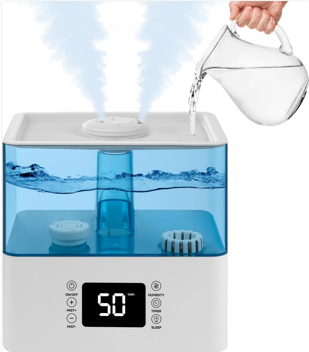
Image 2.1: The Deepwave 3L Humidifier, illustrating its top-fill design with water being poured into the reservoir. The control panel is visible at the front.