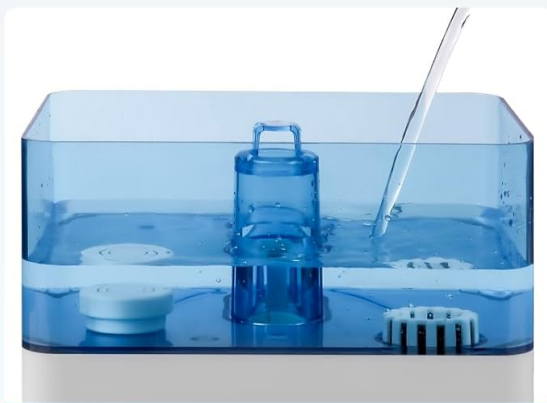
Fill the tank with water