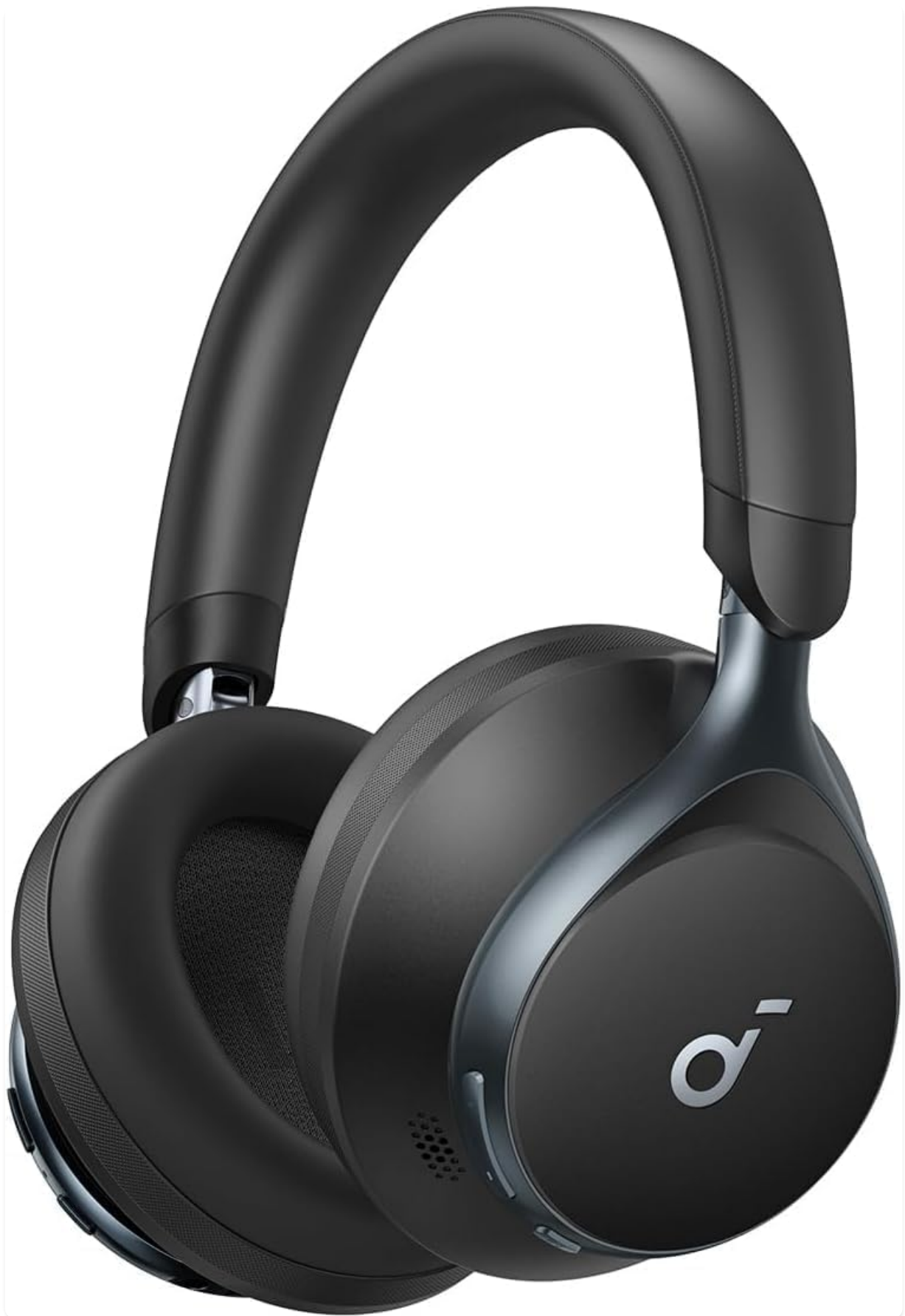
Image: Soundcore Space One Active Noise Cancelling Headphones, Black.