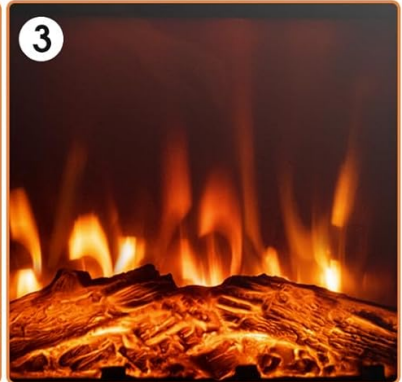
Figure 5: The 3D realistic flame effect with three adjustable brightness levels (L1, L2, L3) for varied ambiance.