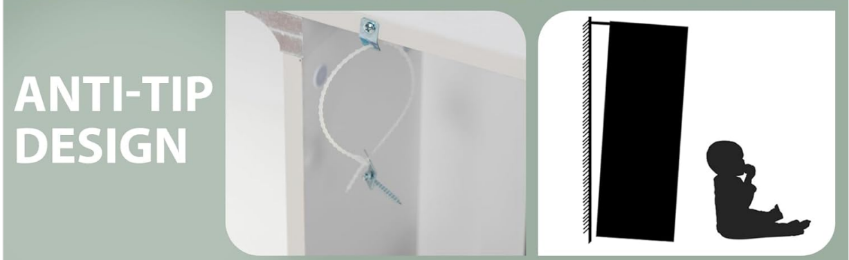
Figure 1: Anti-tip design installation. This device helps secure the fireplace mantel to prevent accidental tipping, especially important in households with children or pets.