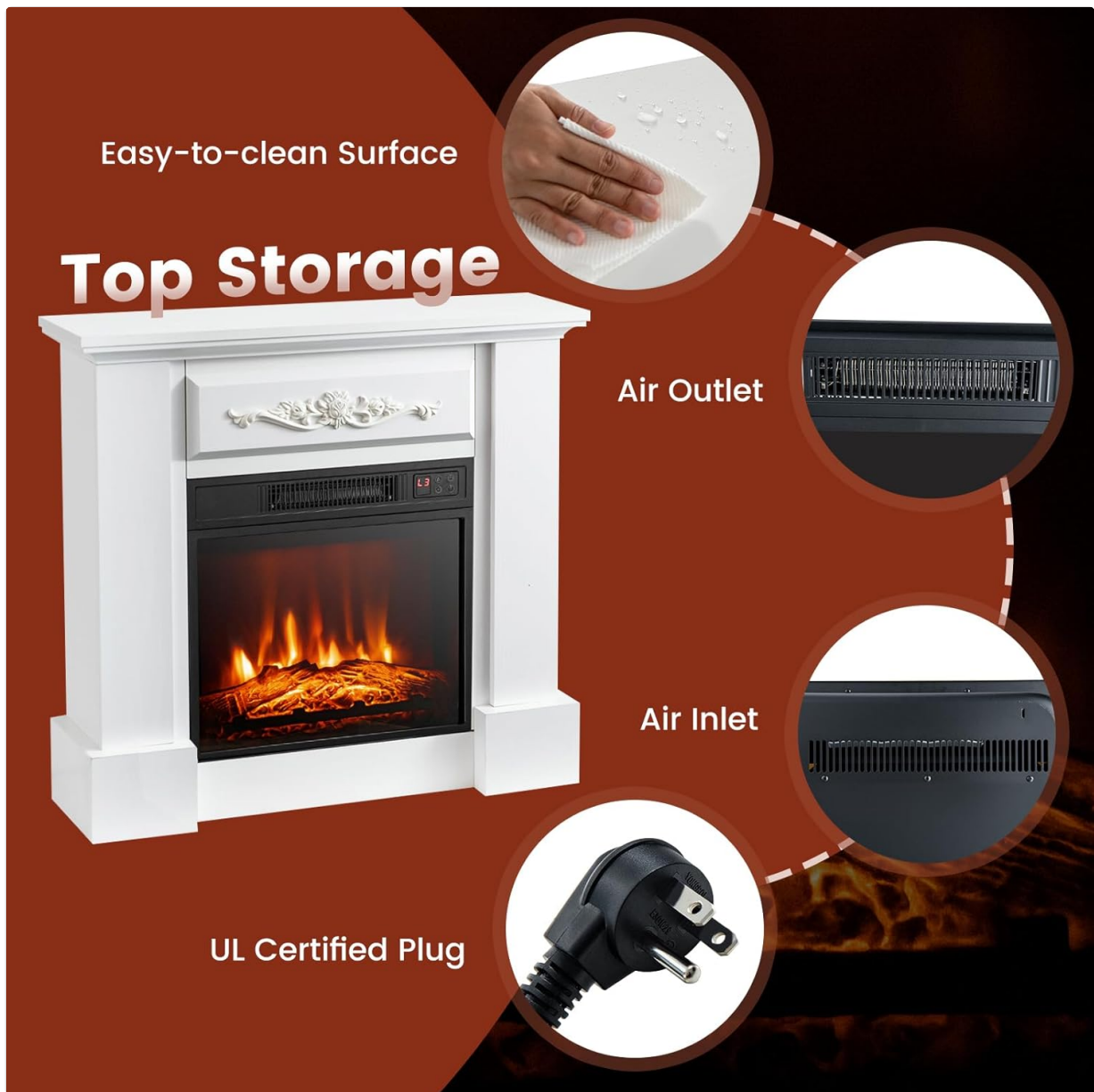
Figure 7: Features like an easy-to-clean surface, clearly marked air inlet and outlet, and a UL certified plug for safety.