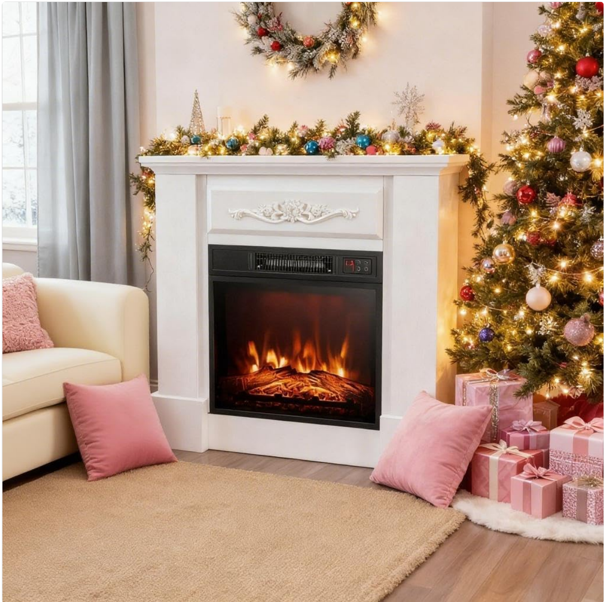
Figure 2: The ORALNER 32-inch Electric Fireplace with Mantel, showcasing its design and typical placement in a home environment.