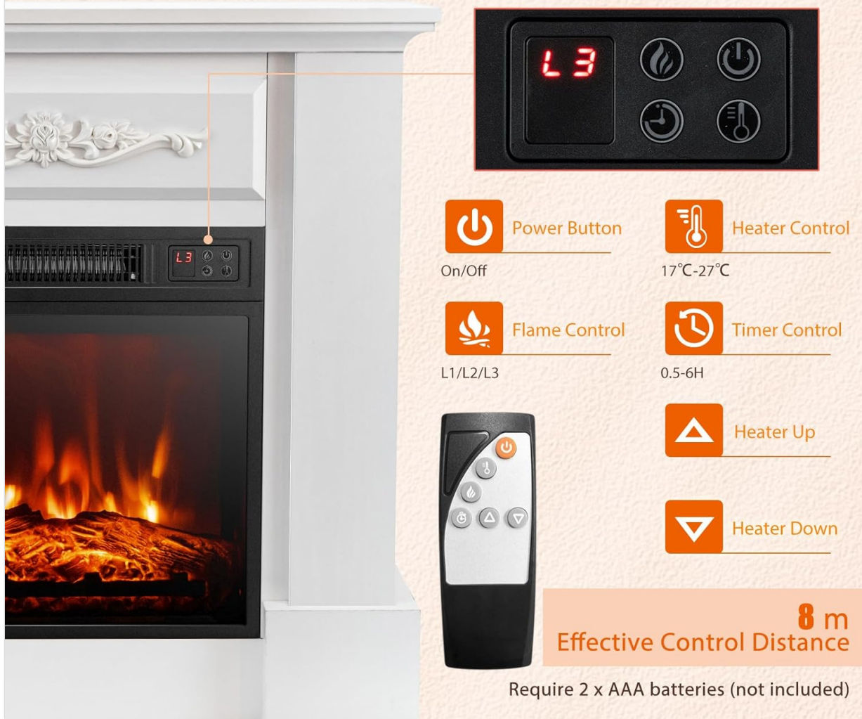
Figure 4: Overview of the control panel buttons and remote control functions, including Power, Heater Control, Flame Control, Timer Control, Heater Up, and Heater Down.