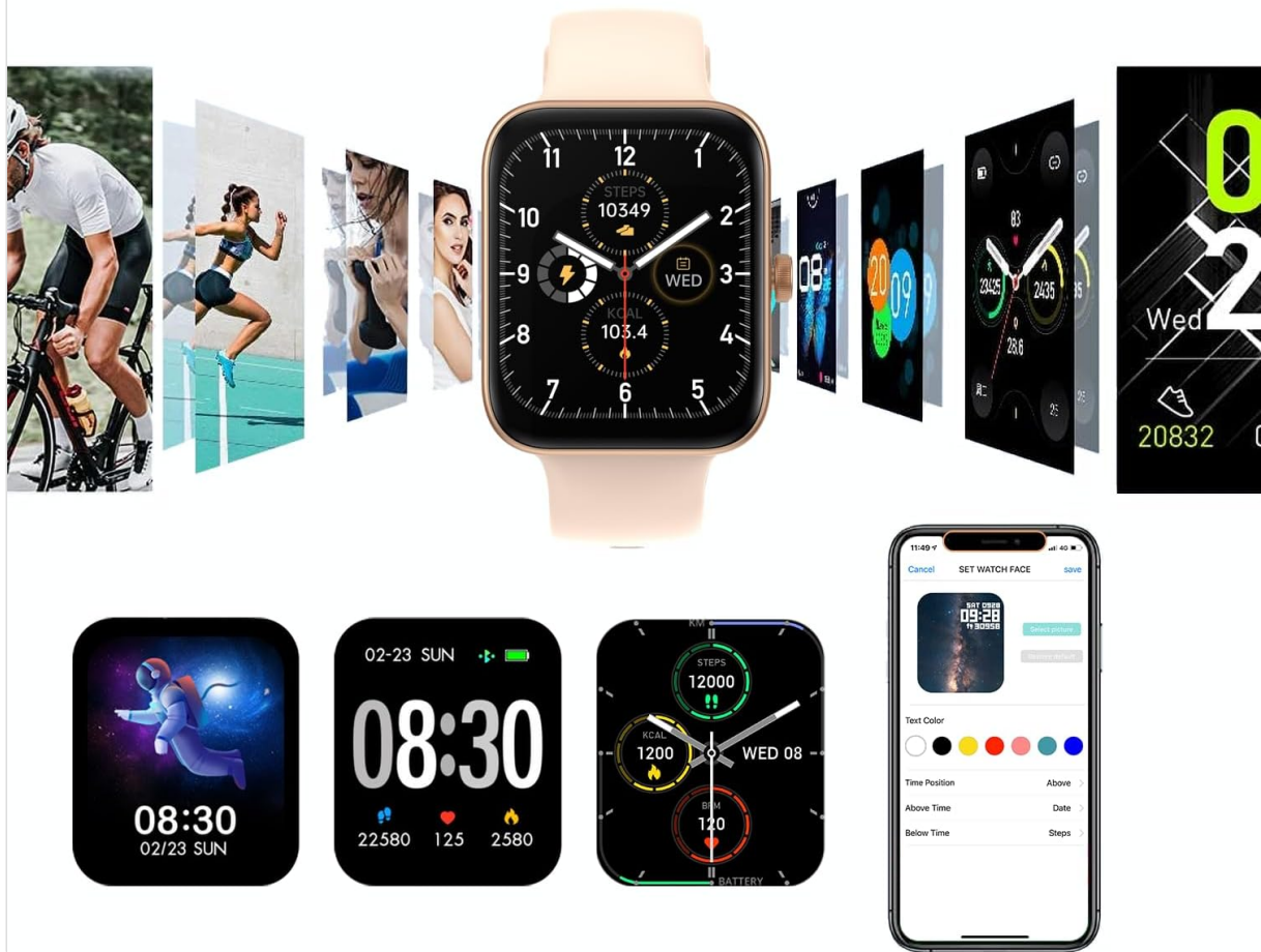
Image: The smartwatch supports a wide variety of sport modes, including walking, running, climbing, and cycling, allowing users to track their performance across different activities.