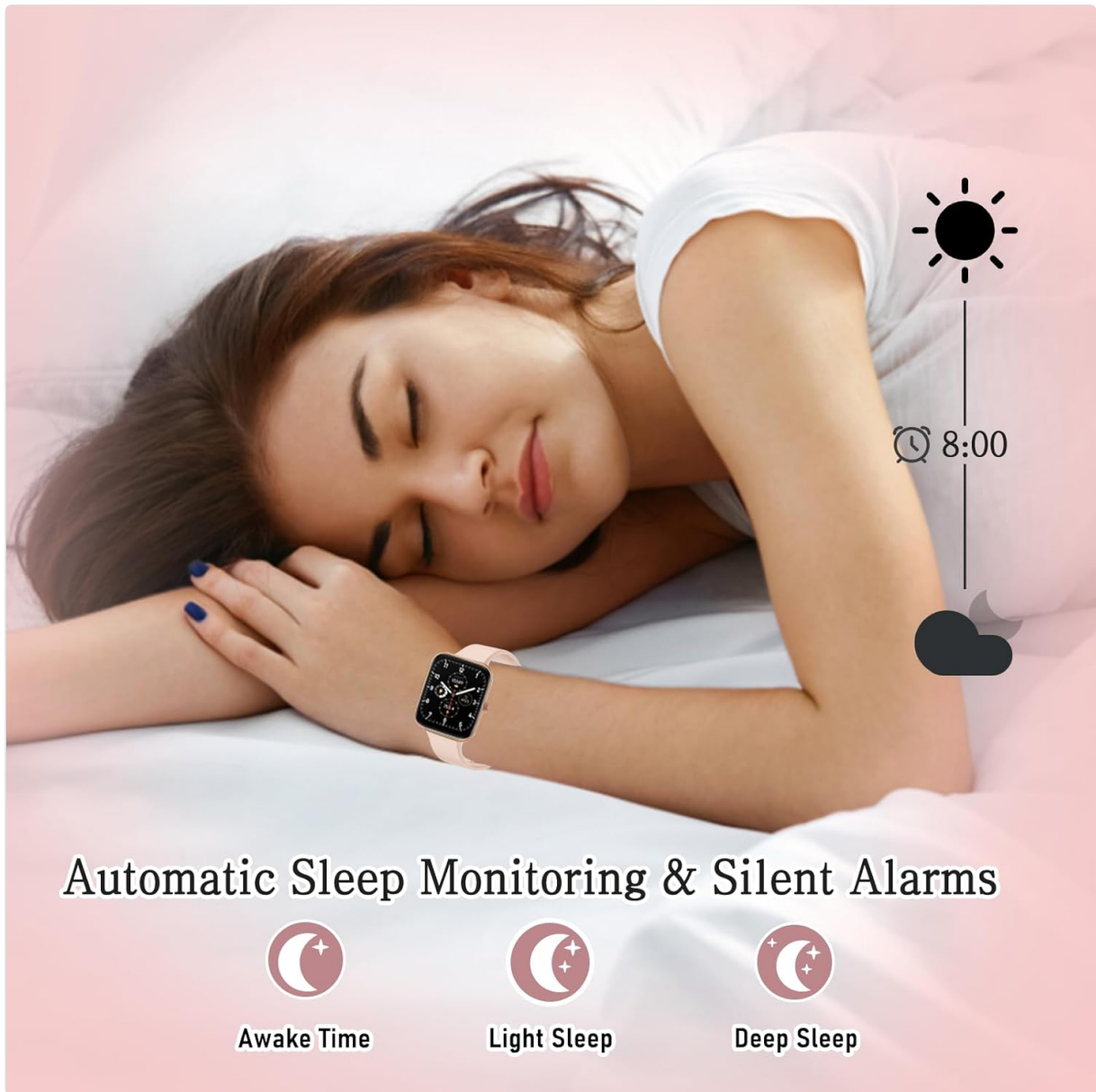
Image: The smartwatch automatically monitors sleep, distinguishing between awake time, light sleep, and deep sleep. It also supports silent alarms to wake you gently.