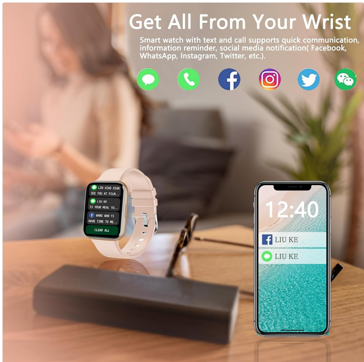
Image: The smartwatch allows users to receive and view text messages and social media notifications directly on their wrist, mirroring alerts from a connected smartphone.

on your watch screen, keeping you informed without needing to check your phone.