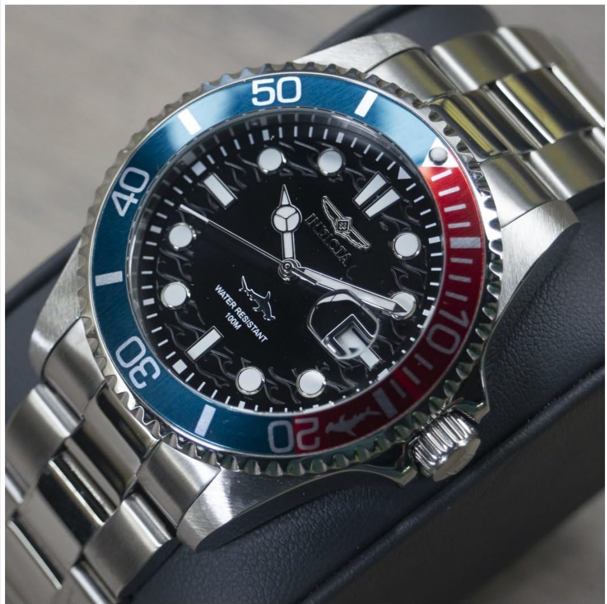
Figure 3: Close-up of the watch face, highlighting the minute markers and the unidirectional rotating bezel for timing.

The watch features a unidirectional rotating bezel. This bezel can be used to time events, such as dive times or elapsed time for other activities. To use, rotate the bezel counter-clockwise until the zero marker aligns with the minute hand. As time passes, the minute hand will indicate the elapsed time on the bezel scale.