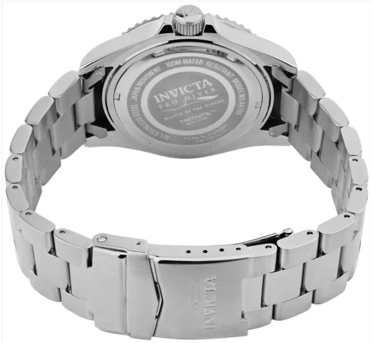
Figure 2: Rear view of the watch, illustrating the bracelet and clasp mechanism. Professional adjustment is recommended for link removal.

The stainless steel bracelet of your watch can be adjusted to fit your wrist comfortably. This typically involves removing or adding links. Due to the precision required, it is recommended to have this adjustment performed by a qualified jeweler or watch technician to prevent damage to the bracelet or spring bars.