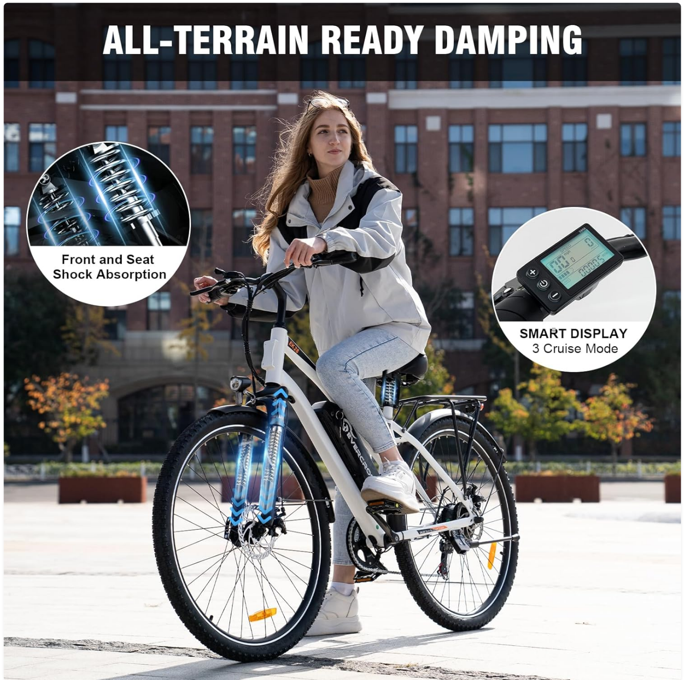
Image: The smart LCD display showing various riding metrics, alongside illustrations of the front and seat shock absorption system.