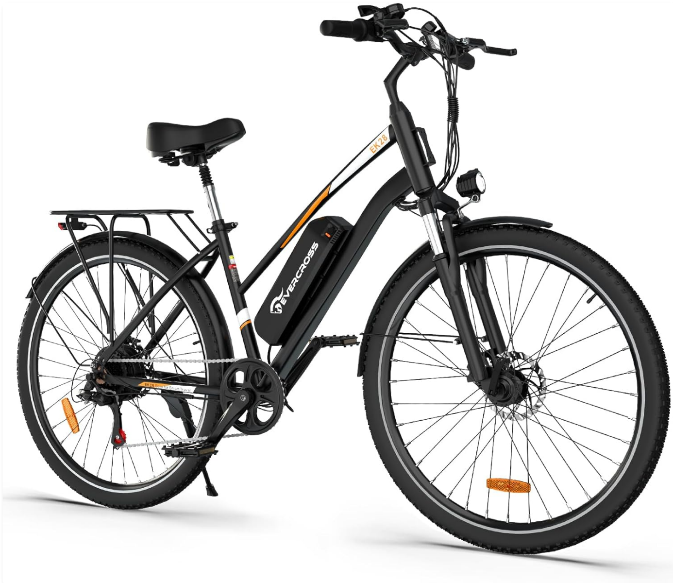
Image: The EVERCROSS EK28 Electric Bike in black, showcasing its robust frame and features.

The EVERCROSS EK28 Electric Bike is designed for adults, featuring a powerful 500W motor and a 36V 12AH removable lithium-ion battery. It offers a range of 21 to 60 miles with pedal assist and can reach speeds up to 20 MPH. This electric mountain bike is equipped with a 7-speed gear system, front suspension, and disc brakes for a versatile and safe riding experience.