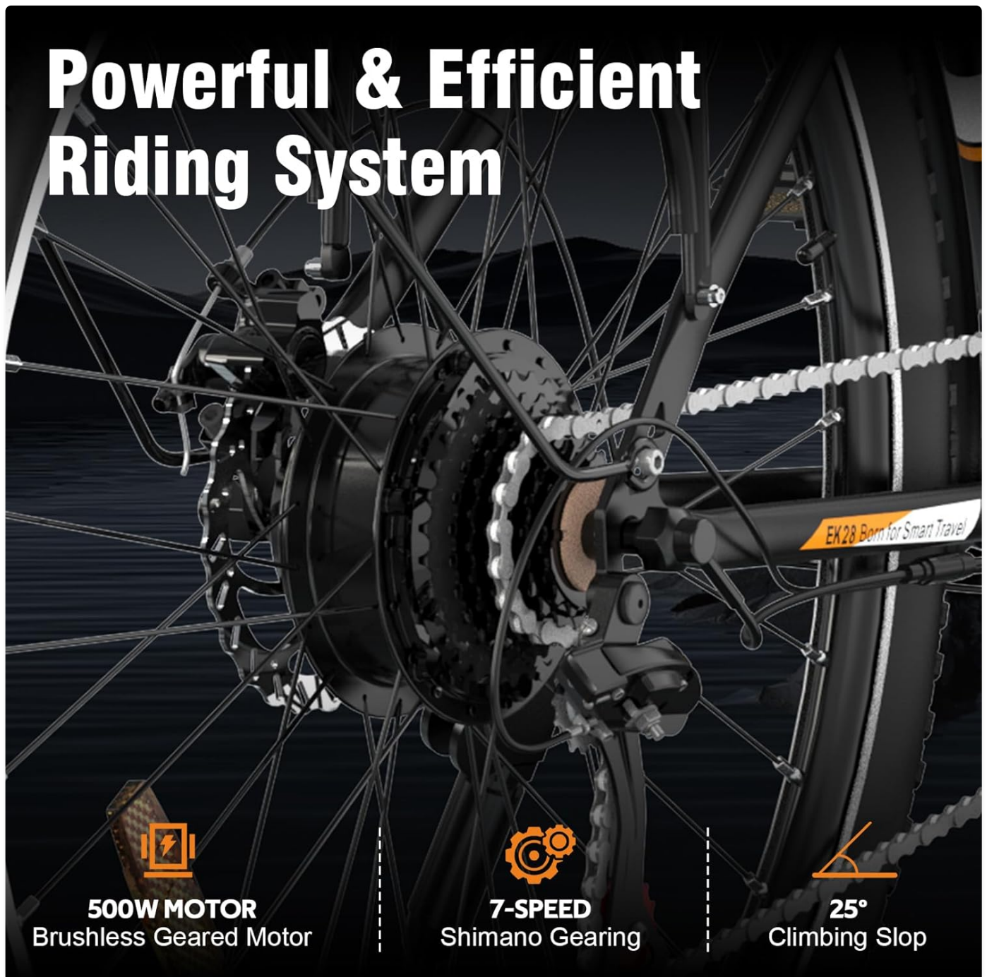
Image: Detailed view of the 500W brushless geared motor and 7-speed Shimano gearing system, highlighting the bike's powerful and efficient drivetrain.