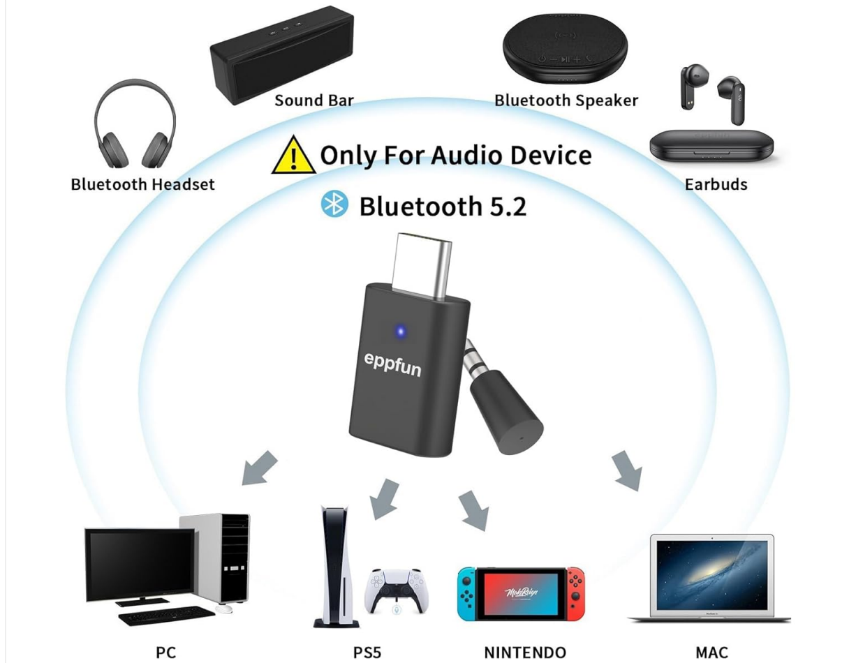
Image: The eppfun AK3040 Pro connected to a Nintendo Switch, illustrating its simple plug-and-play setup without requiring additional drivers.

Connect a dedicated microphone to the PS5 controller and enjoy voice chat