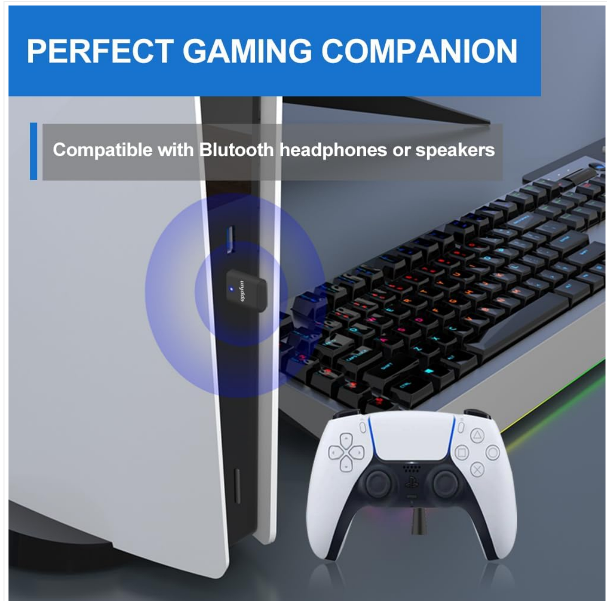
Image: The eppfun AK3040 Pro connected to a PlayStation 5 console, highlighting its use as a gaming companion for wireless audio.