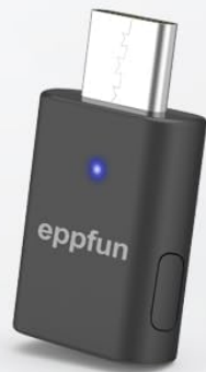
AK 3040 pro