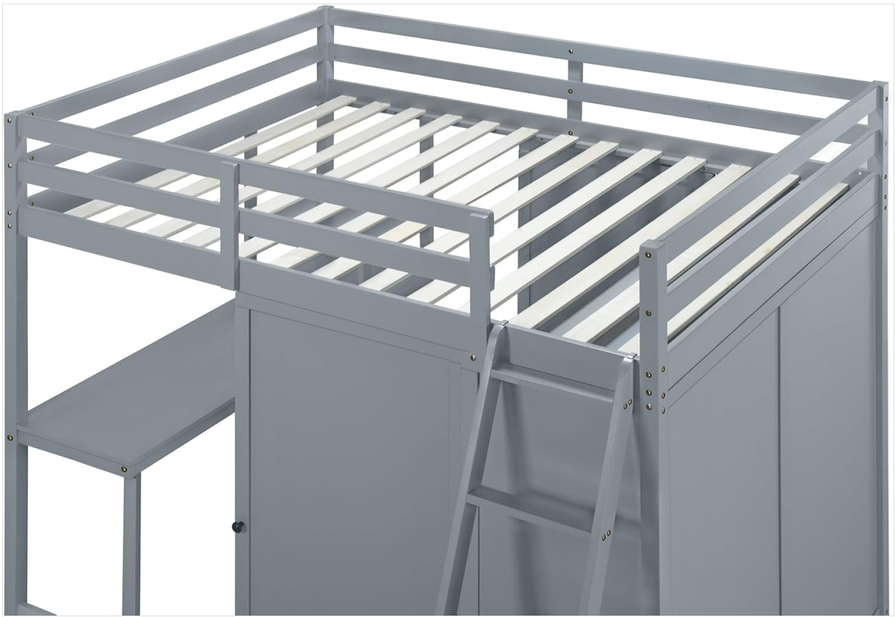
Image 7: Close-up view of the bed platform, showing the wooden slats for mattress support and the safety guardrails.