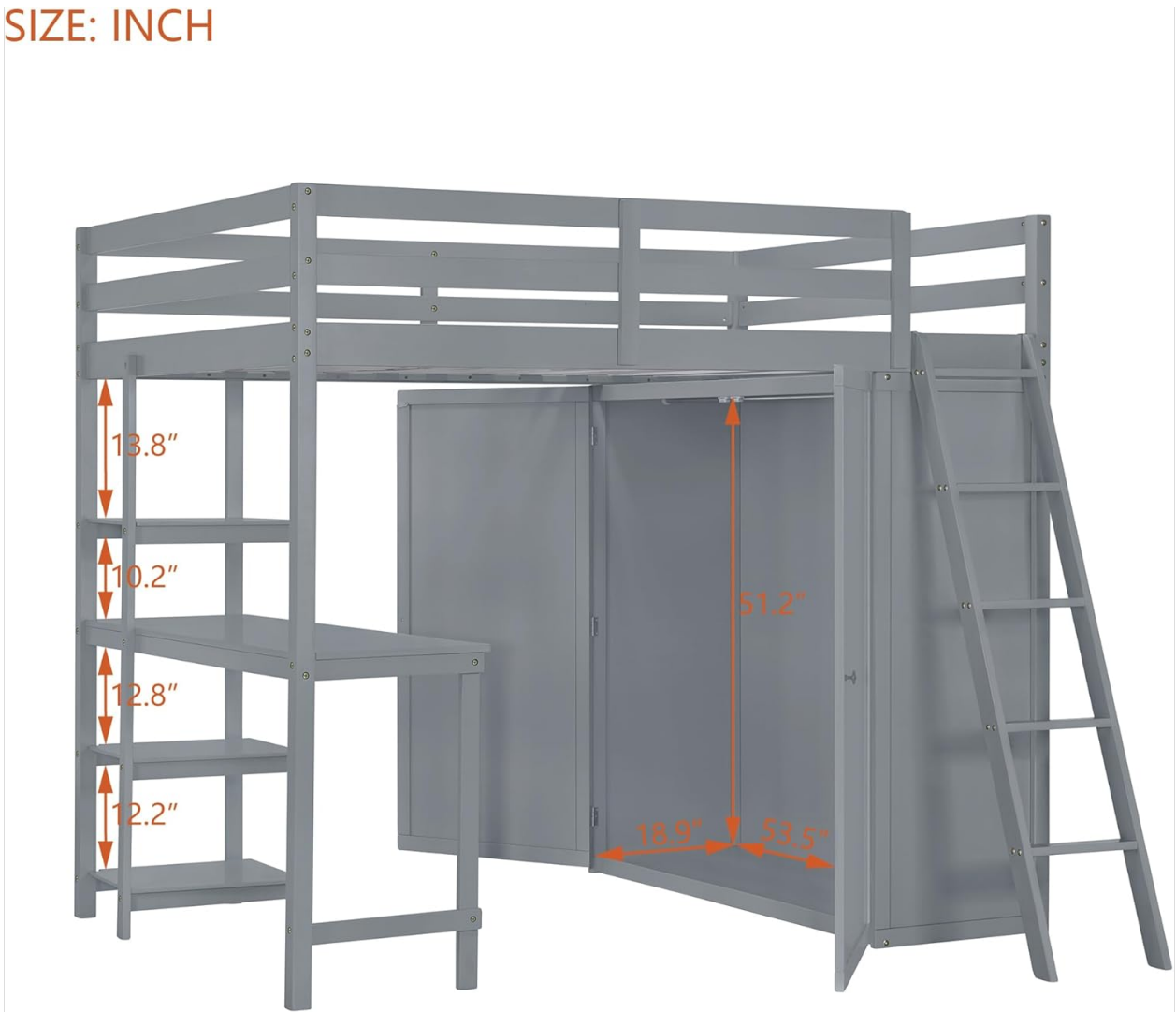
Image 8: Side view dimension diagram, showing measurements for the desk, shelves, and wardrobe interior.