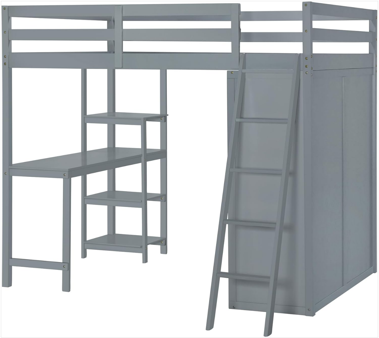
Image 3: Angled view of the loft bed, providing a clearer perspective of the desk and shelving units.