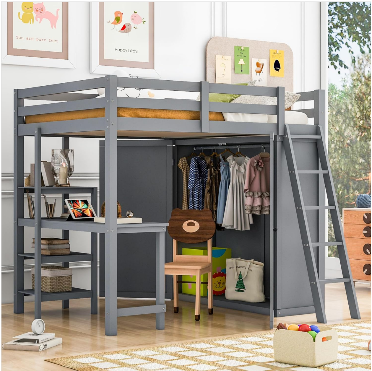
Image 1: Fully assembled XD Designs Full Size Multi-Functional Loft Bed, showcasing the bed, desk, shelves, and wardrobe in a grey finish.