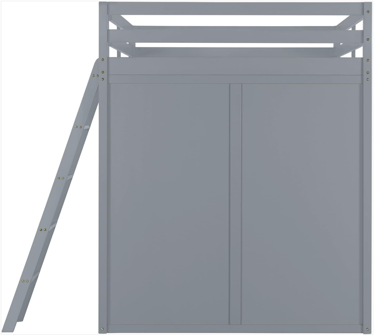
Image 5: Side view of the loft bed, illustrating the wardrobe section and the inclined ladder.