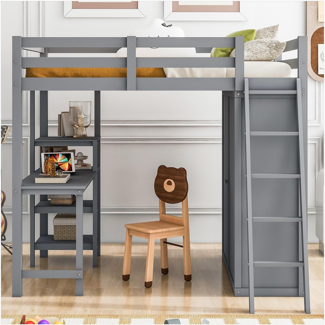
Image 2: Front view of the loft bed, highlighting the integrated desk and wardrobe area beneath the bed.