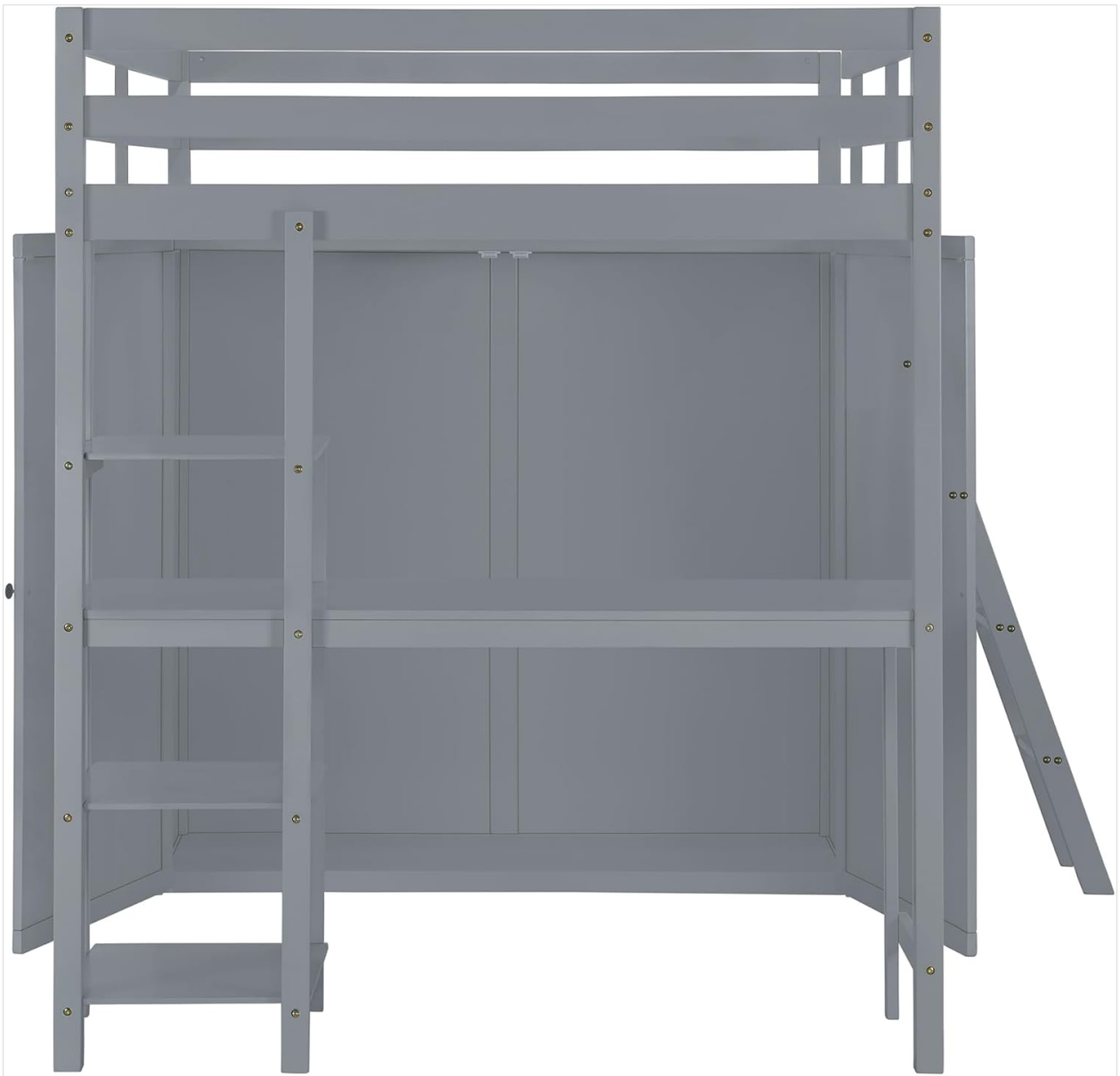
Image 4: Another front view of the loft bed, emphasizing the functional desk and wardrobe components.