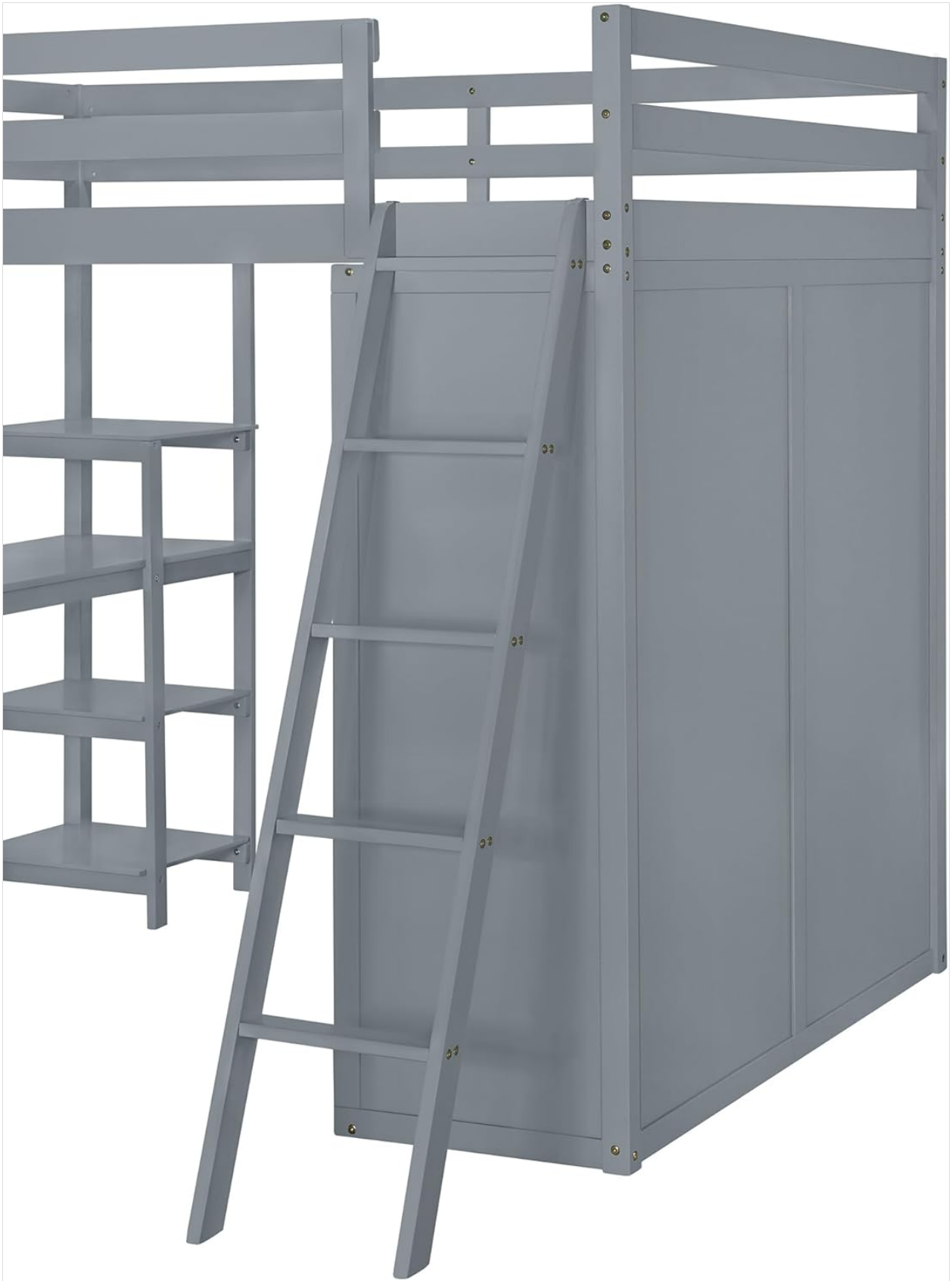
Image 6: Angled view focusing on the ladder and the integrated wardrobe unit of the loft bed.