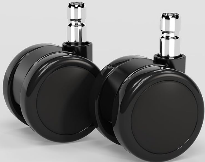
Figure 8: Details of the chair's durable 400LBS heavy-duty metal base and smooth, quiet casters for easy movement.