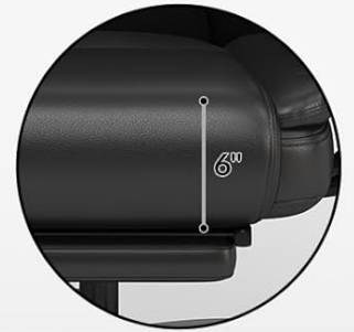
6" Thickened Cushion