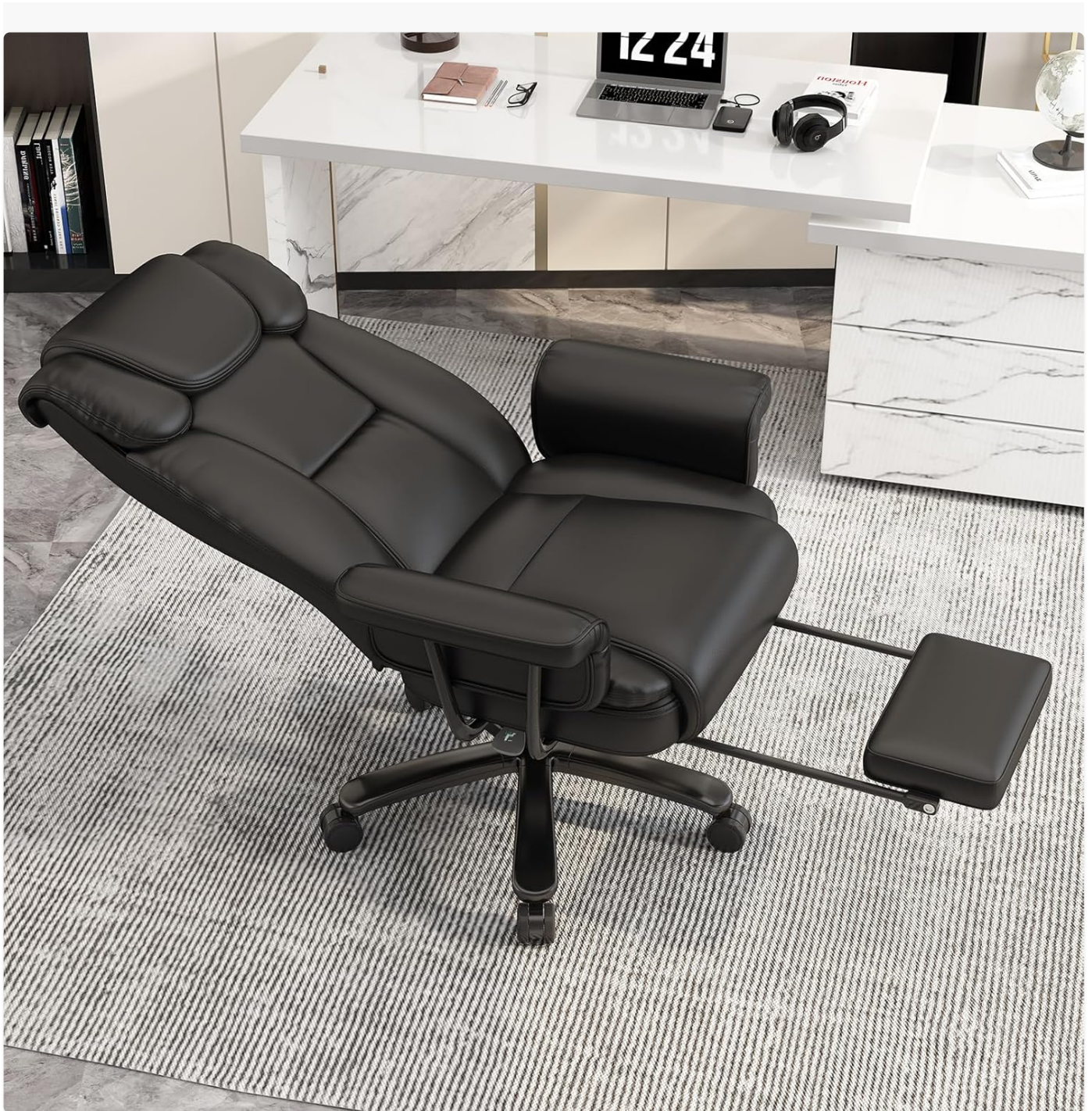
Figure 4: The chair in its fully reclined position with the integrated footrest extended, ideal for relaxation or napping.