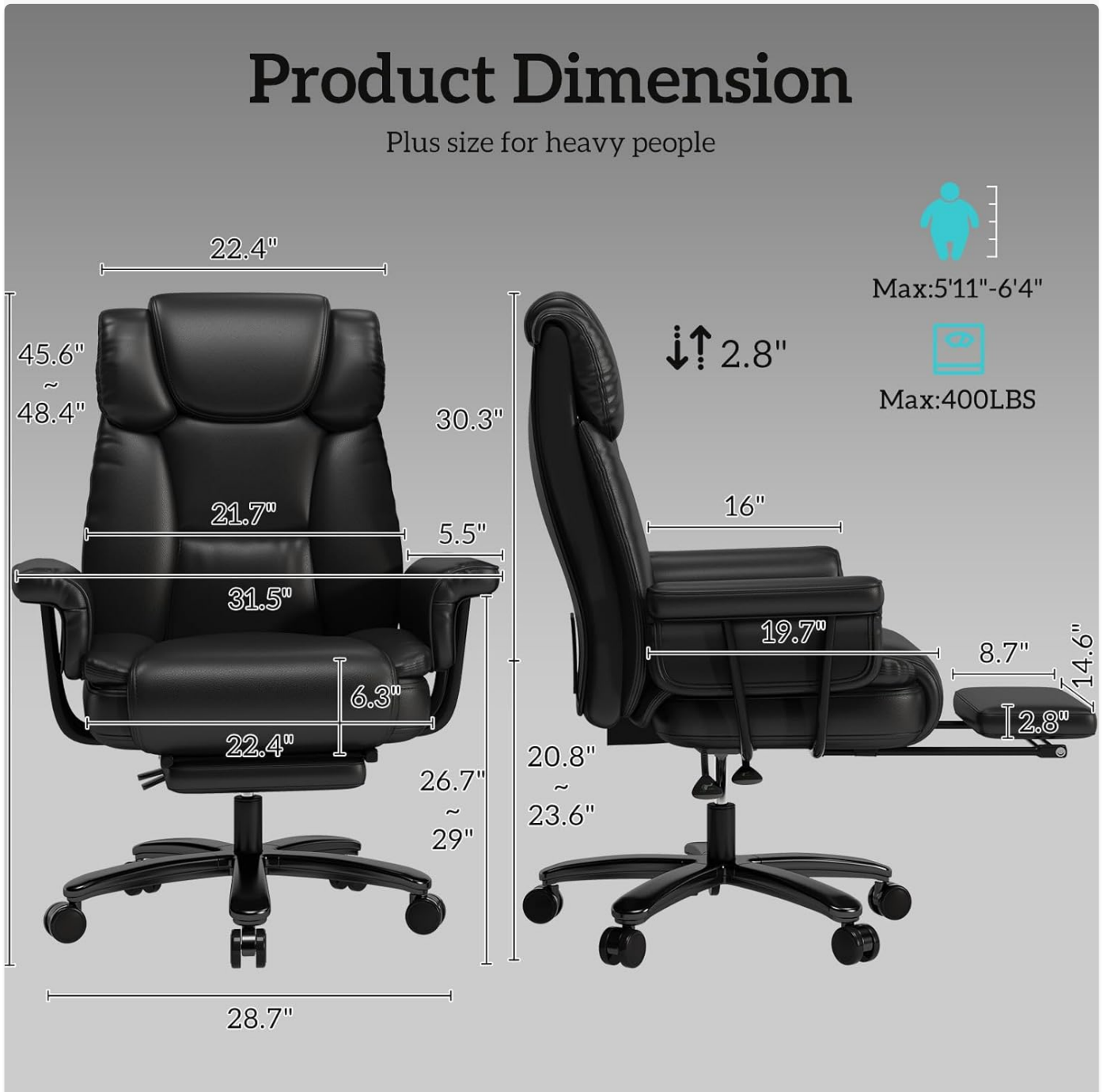
Figure 2: Detailed product dimensions, indicating the chair's generous size suitable for larger individuals and various sitting styles.