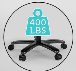
Heavy Duty Metal Base