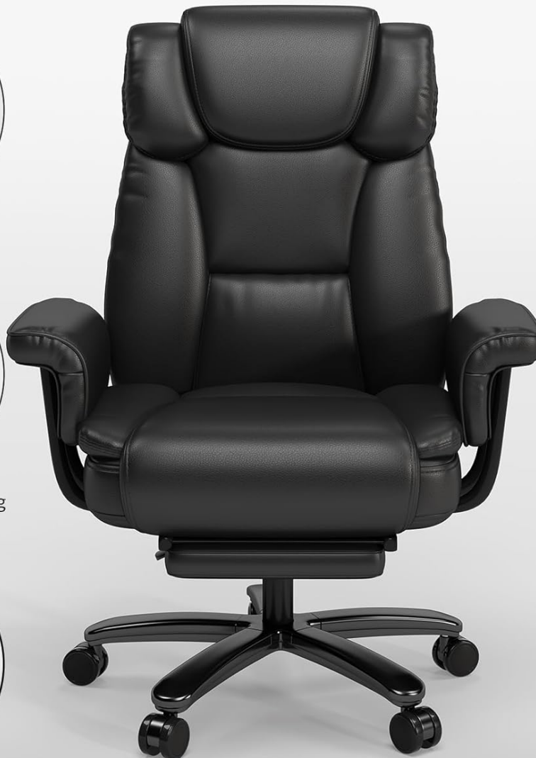
Figure 7: Key features of the GYI Big & Tall Office Chair, emphasizing its robust construction and ergonomic design elements.