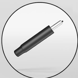
100000 Pressure Tests Gas cyclinder