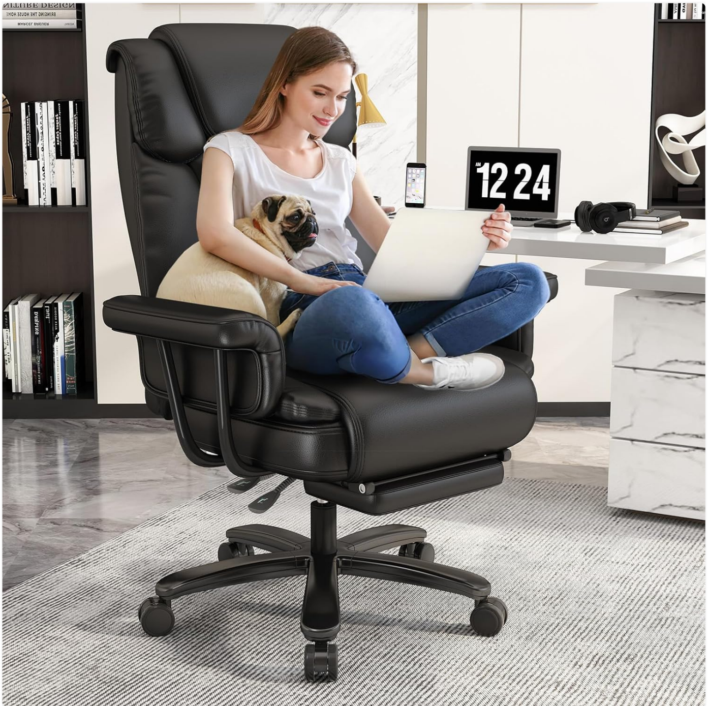
Figure 1: The GYI Criss Cross Chair, demonstrating its spacious design allowing for comfortable, varied seating positions, including sitting cross-legged.