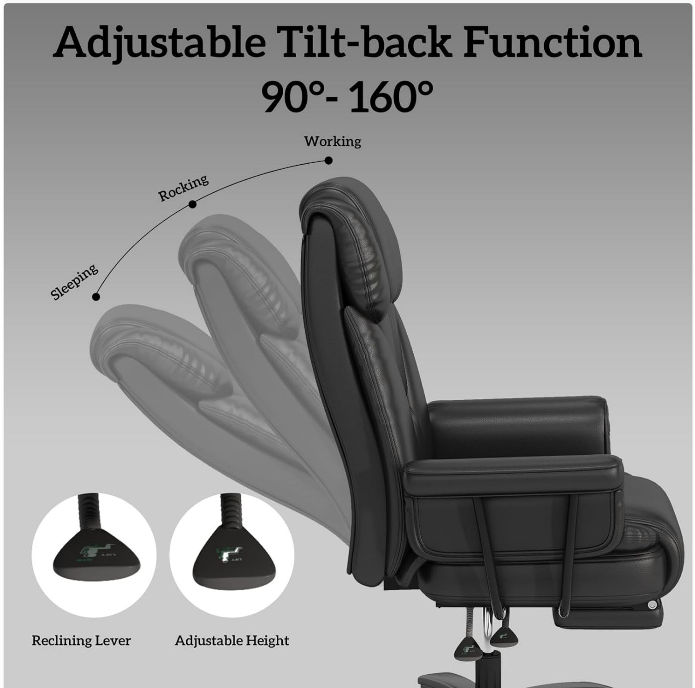
Figure 3: Visual representation of the chair's reclining capability, allowing transition from an upright working position to a fully reclined sleeping position.

Pull the lever on the left side of the chair upwards to unlock the recline mechanism. Lean back to your desired angle (up to 160 degrees). Release the lever to lock the backrest in place. To return to an upright position, pull the lever again and lean forward.