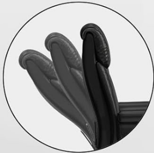
90-160 Degree Reclining