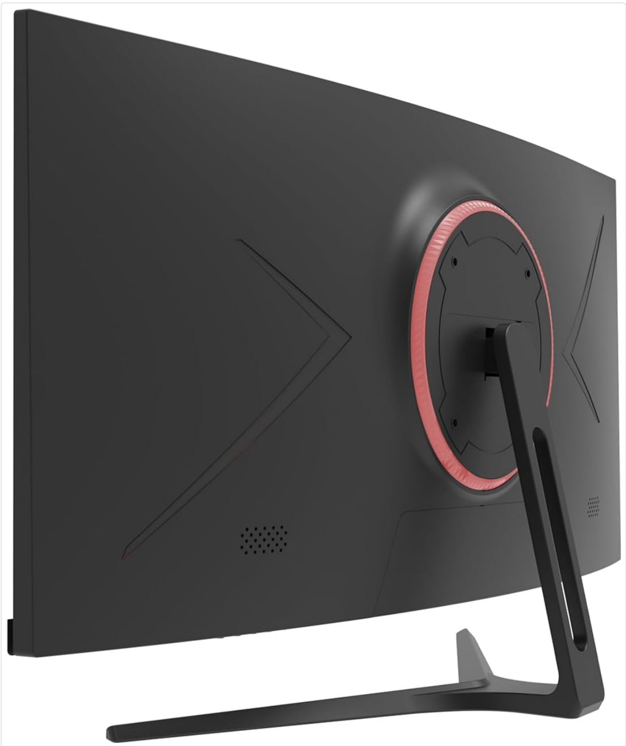
Figure 2: Monitor with stand fully assembled.