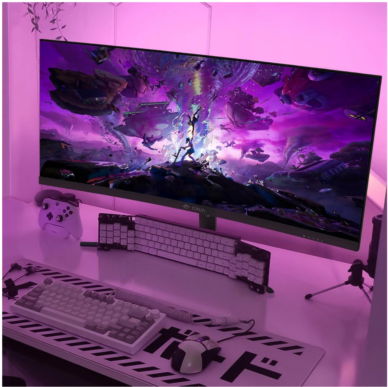
Figure 6: Brilliant color reproduction with 120% sRGB.