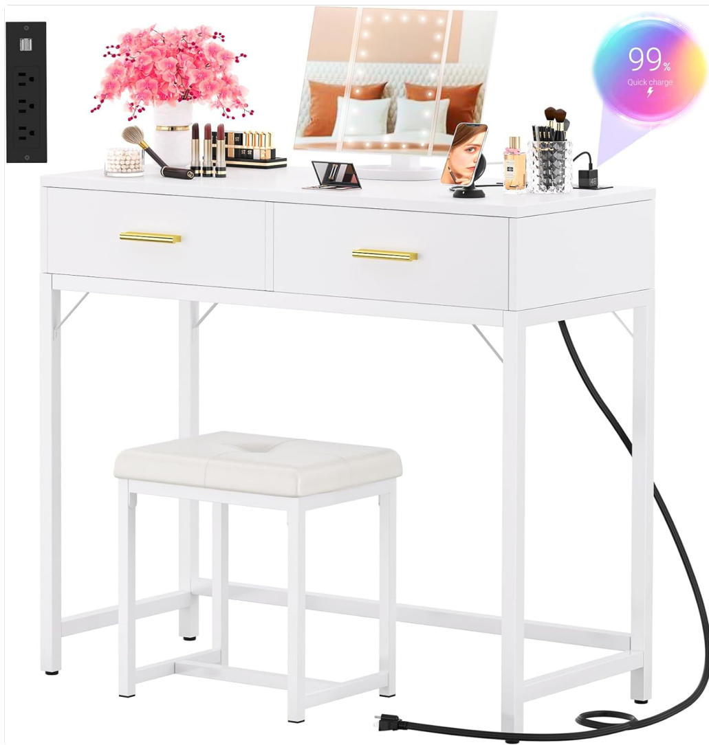
Figure 1: Cyclysio White Vanity Desk with Tri-Fold Lighted Mirror, Charging Station, and Stool.