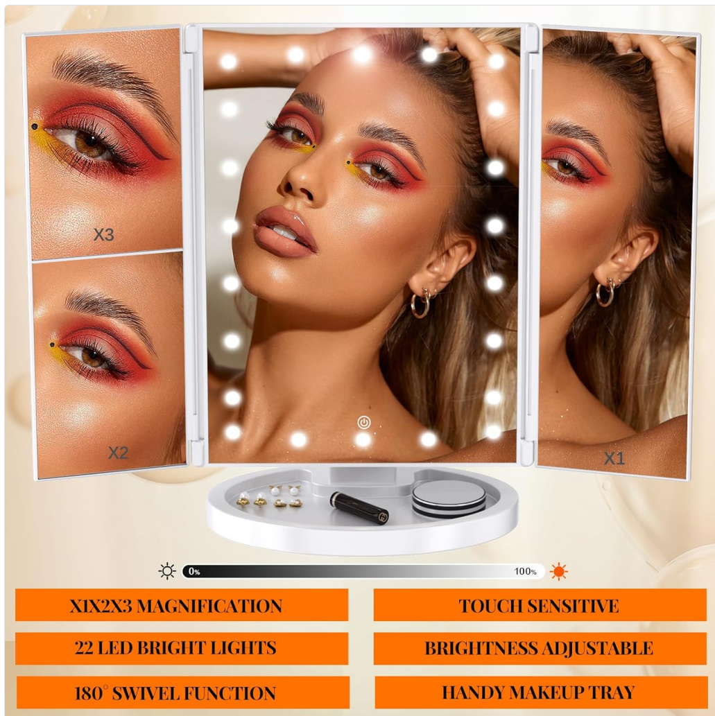
Figure 3: Tri-Fold Lighted Mirror Features.