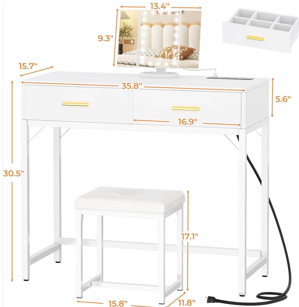
Figure 2: Product Dimensions for Assembly Planning.