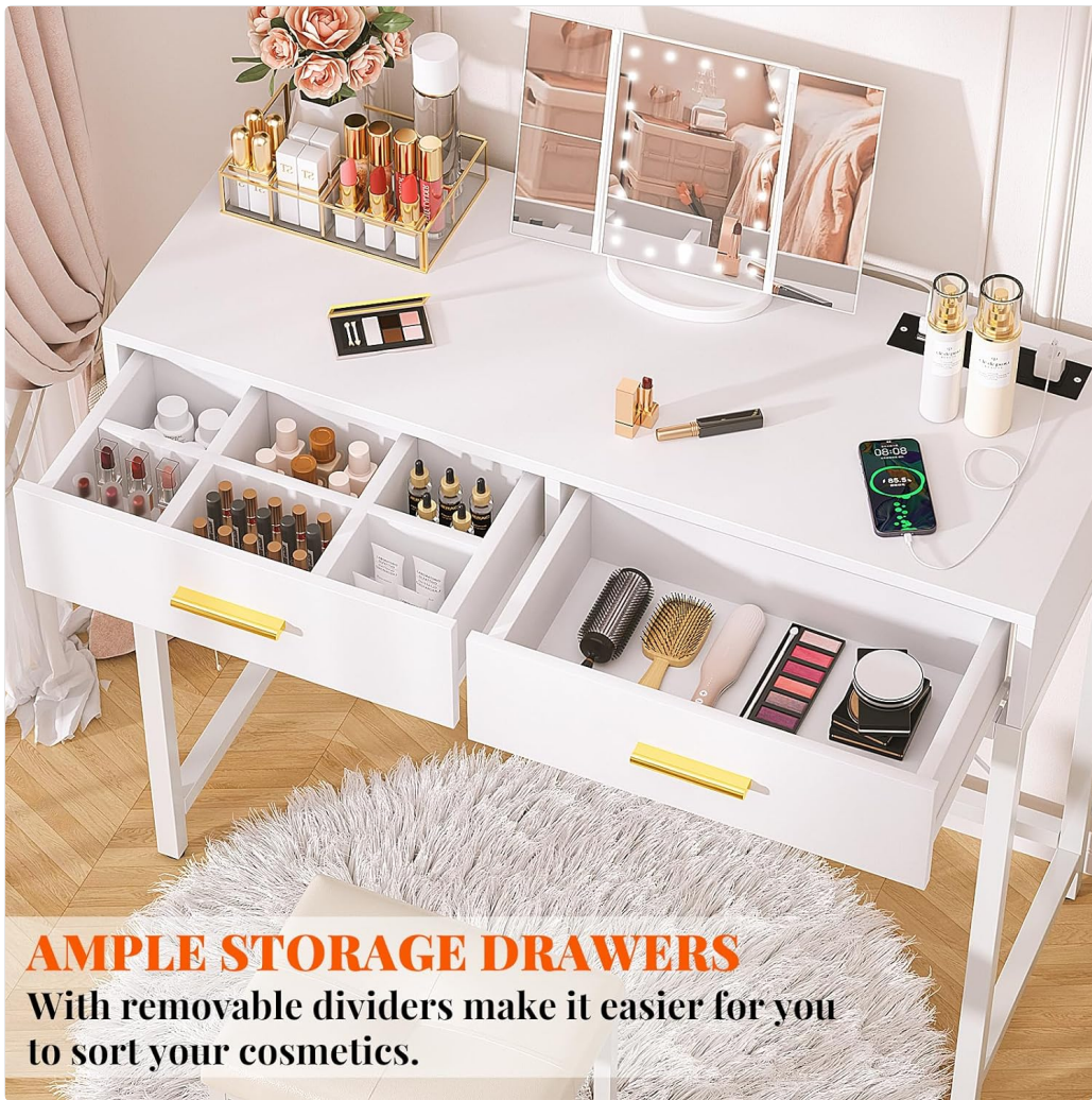
Figure 5: Organized Drawers with Dividers.