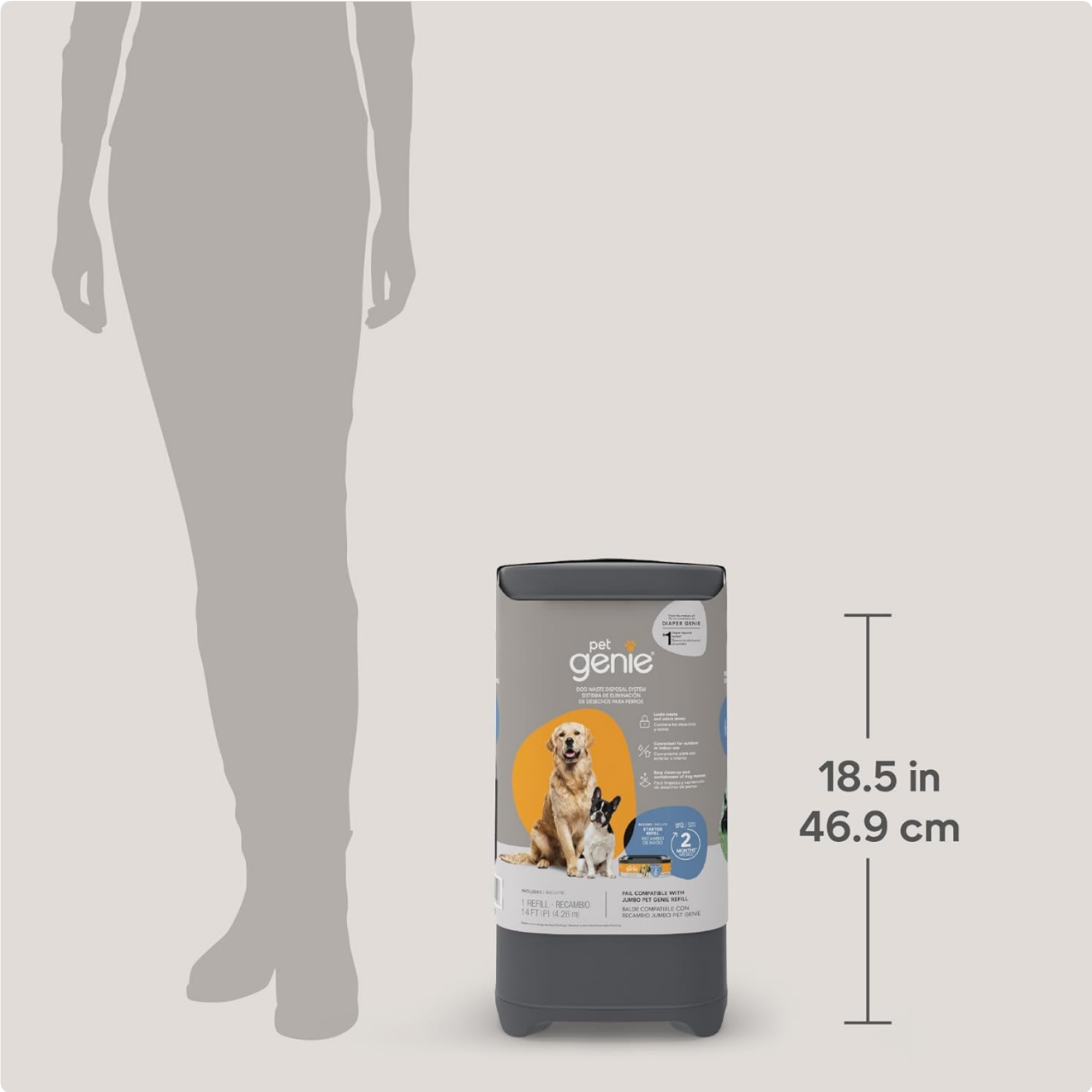
Figure 8: Dimensions of the Pet Genie Pail, with a height of 18.5 inches (46.9 cm).