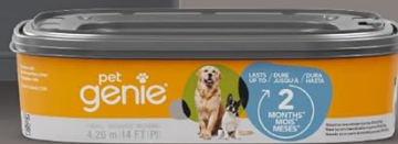
Figure 3: Components included with the Pet Genie Pail: the pail itself, a starter refill (14 ft, lasting up to 2 months), and a tail at the back for added stability.