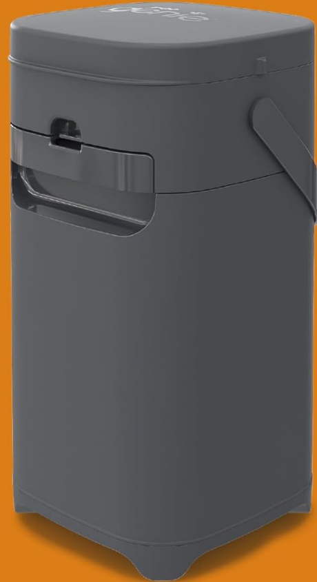
Figure 2: Key features of the Pet Genie Pail, including its odor-locking capability, suitability for both indoor and outdoor use, ease of cleaning, and advanced multi-layer refill film technology.

Multi-layer refill film with odor-locking barrier technology