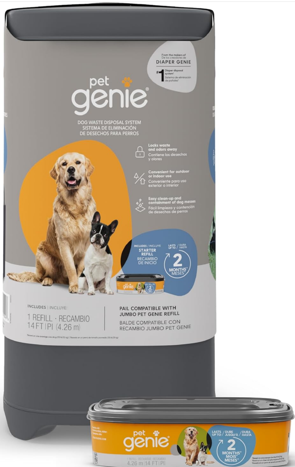
Figure 1: The Pet Genie Pail, showcasing its packaging and the included refill. This system is designed for effective dog waste disposal.