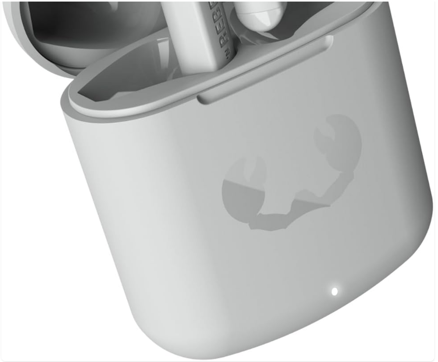
Image: Fresh 'n Rebel Twins Core earbuds in their charging case, showcasing the sleek Ice Grey design.