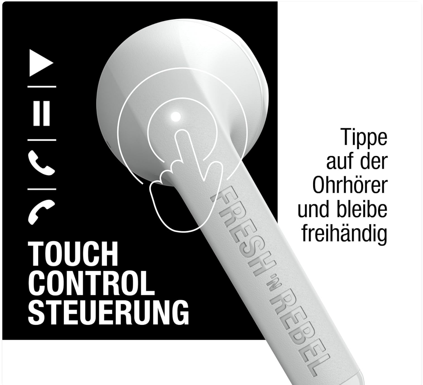
Image: A close-up of an earbud illustrating the touch control area and common gestures for playback and call management.

The Twins Core earbuds feature intuitive touch controls for easy management of music and calls.