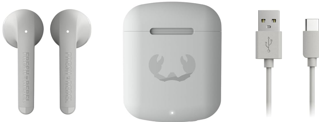
Image: A visual representation of the Fresh 'n Rebel Twins Core package contents, including the earbuds, charging case, and USB-C charging cable.