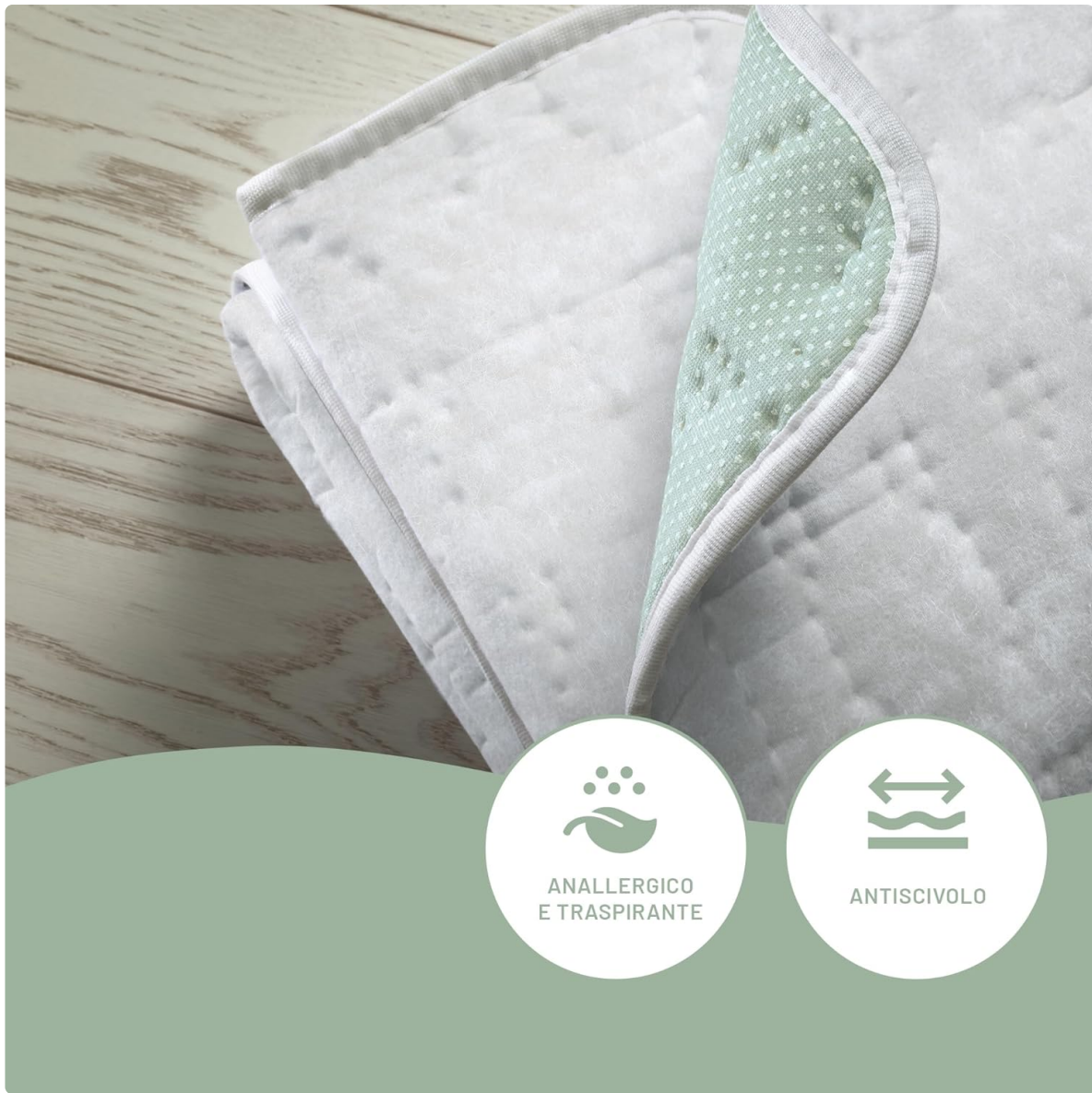
Image: Detail of the hypoallergenic and anti-slip fabric.