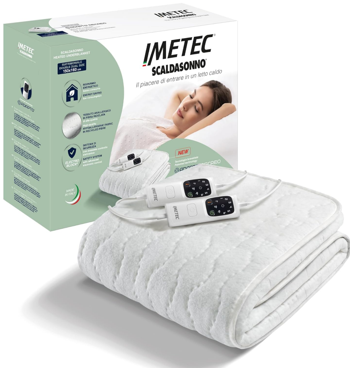
Image: The Imetec Scaldasonno Adatto Recreo Double Heated Mattress Pad, showing the product folded and its packaging with two control units.