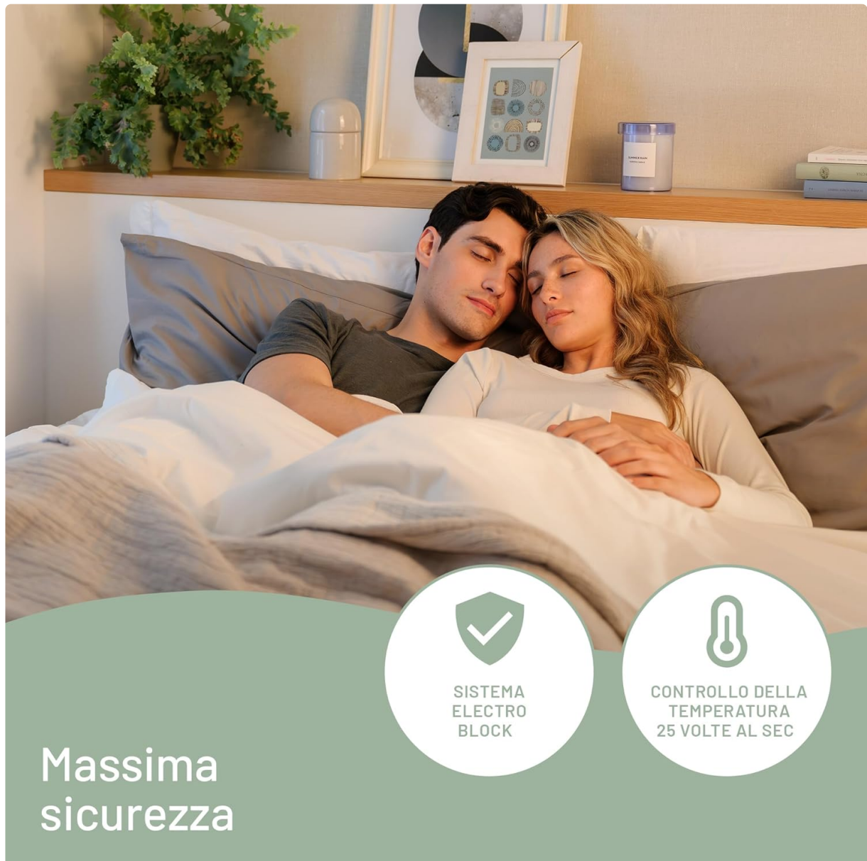
Image: A couple sleeping, demonstrating the safe and comfortable use of the heated mattress pad.