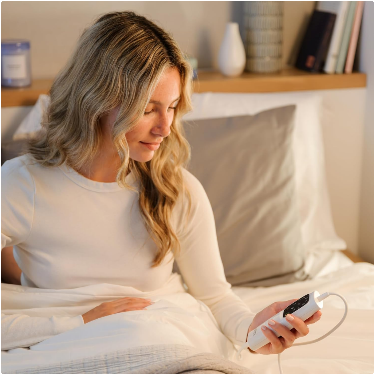
Image: A user adjusting the control unit while in bed.