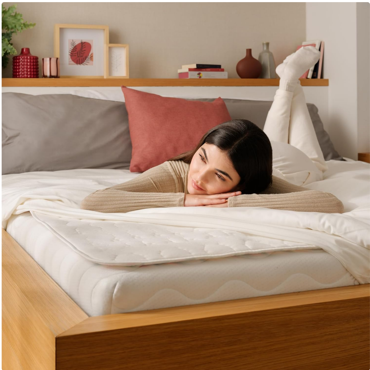
Image: The heated mattress pad correctly placed on a bed, ready for use.