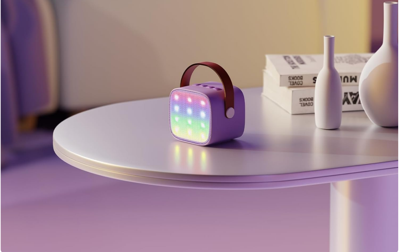
Figure 5: The compact speaker unit is shown with its multi-colored LED lights actively illuminating, demonstrating the controllable dancing lights feature that synchronizes with the music to enhance the party atmosphere.