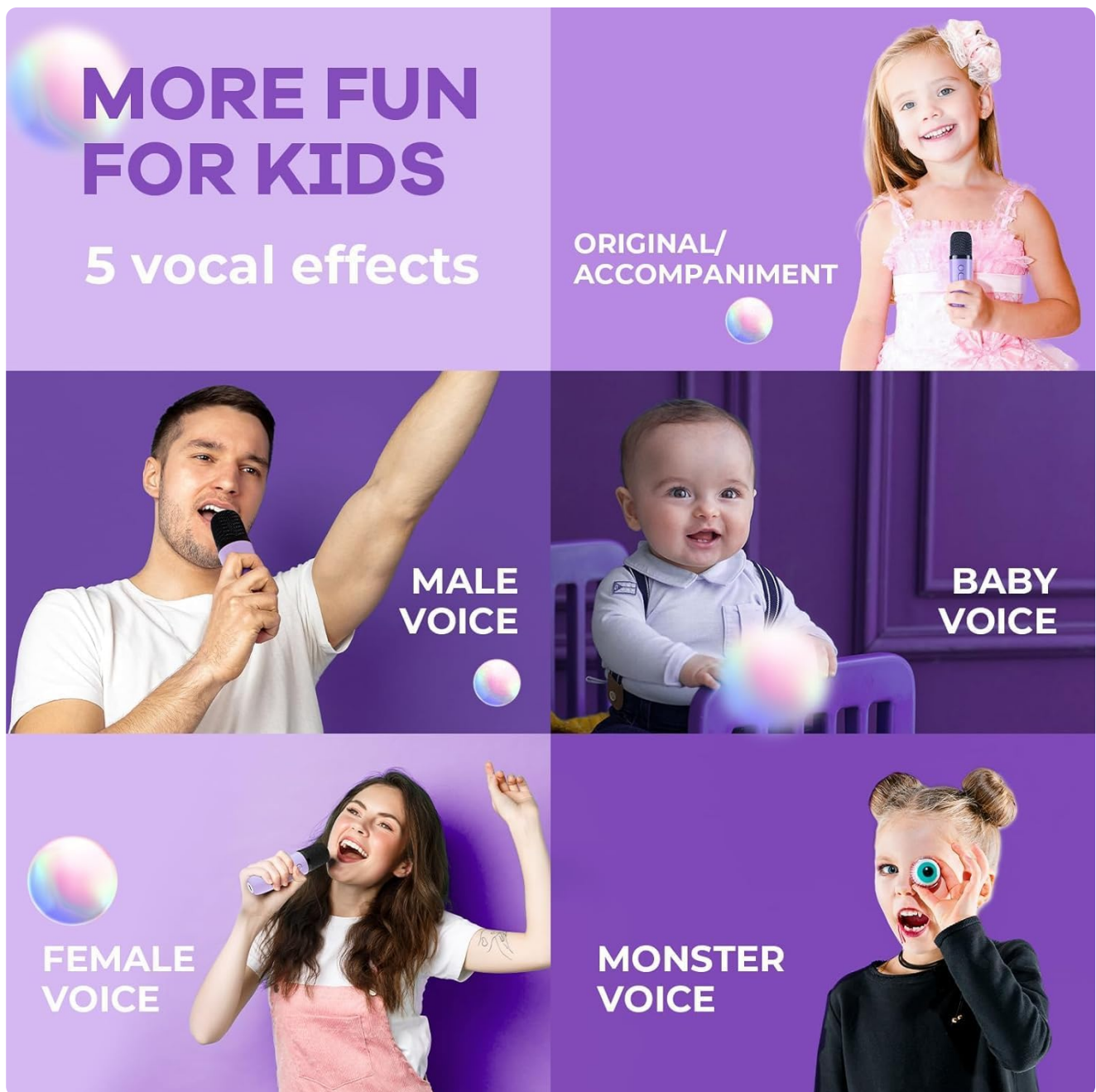
Figure 4: This image displays the five vocal effects available on the karaoke machine: Original/Accompaniment, Male Voice, Baby Voice, Female Voice, and Monster Voice. These effects add a fun and interactive element to singing.