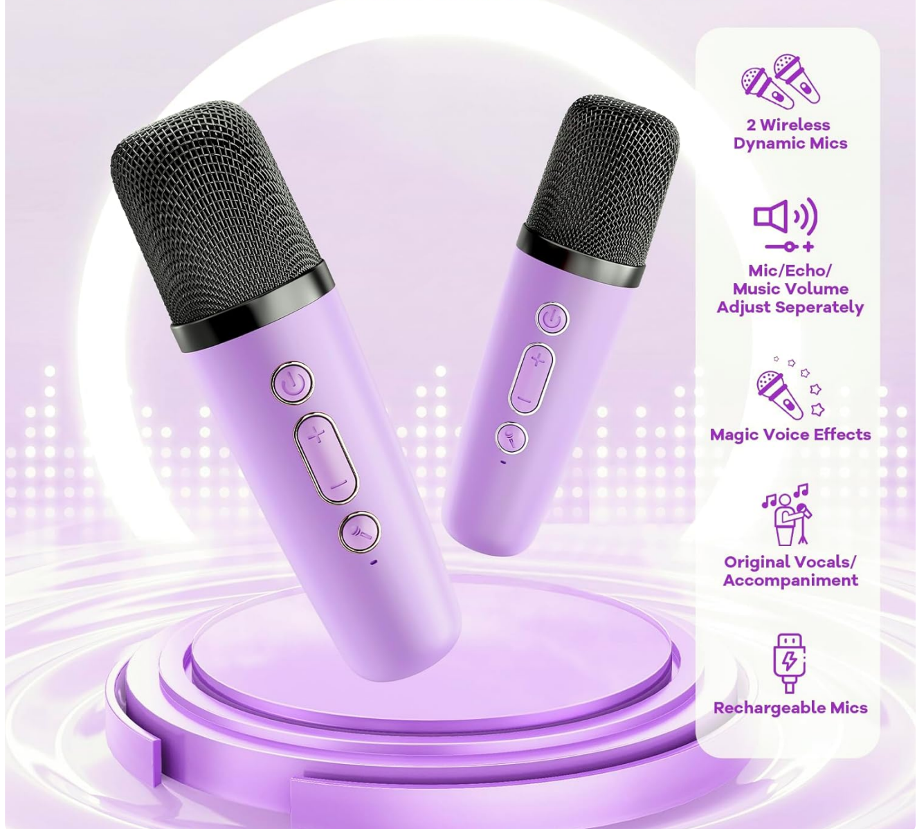
Figure 3: Detailed view of the two wireless microphones, illustrating their control buttons for adjusting microphone, echo, and music volume independently. The image also highlights features like magic voice effects, the ability to switch between original vocals and accompaniment, and their rechargeable nature.