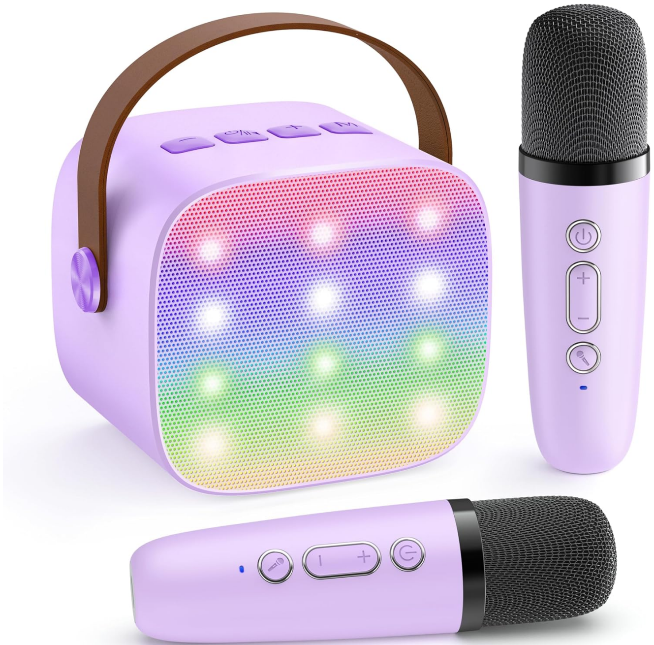
Figure 1: The YLL Mini Karaoke Machine set, featuring the compact purple speaker with a brown handle and two matching wireless microphones. The speaker has a colorful LED light display on its front grille.