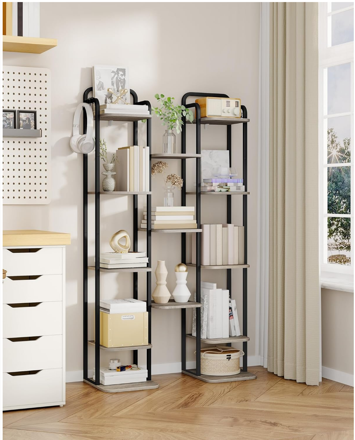
Image: The shoe rack repurposed as a versatile storage unit for books and decorative items, demonstrating its adaptability.