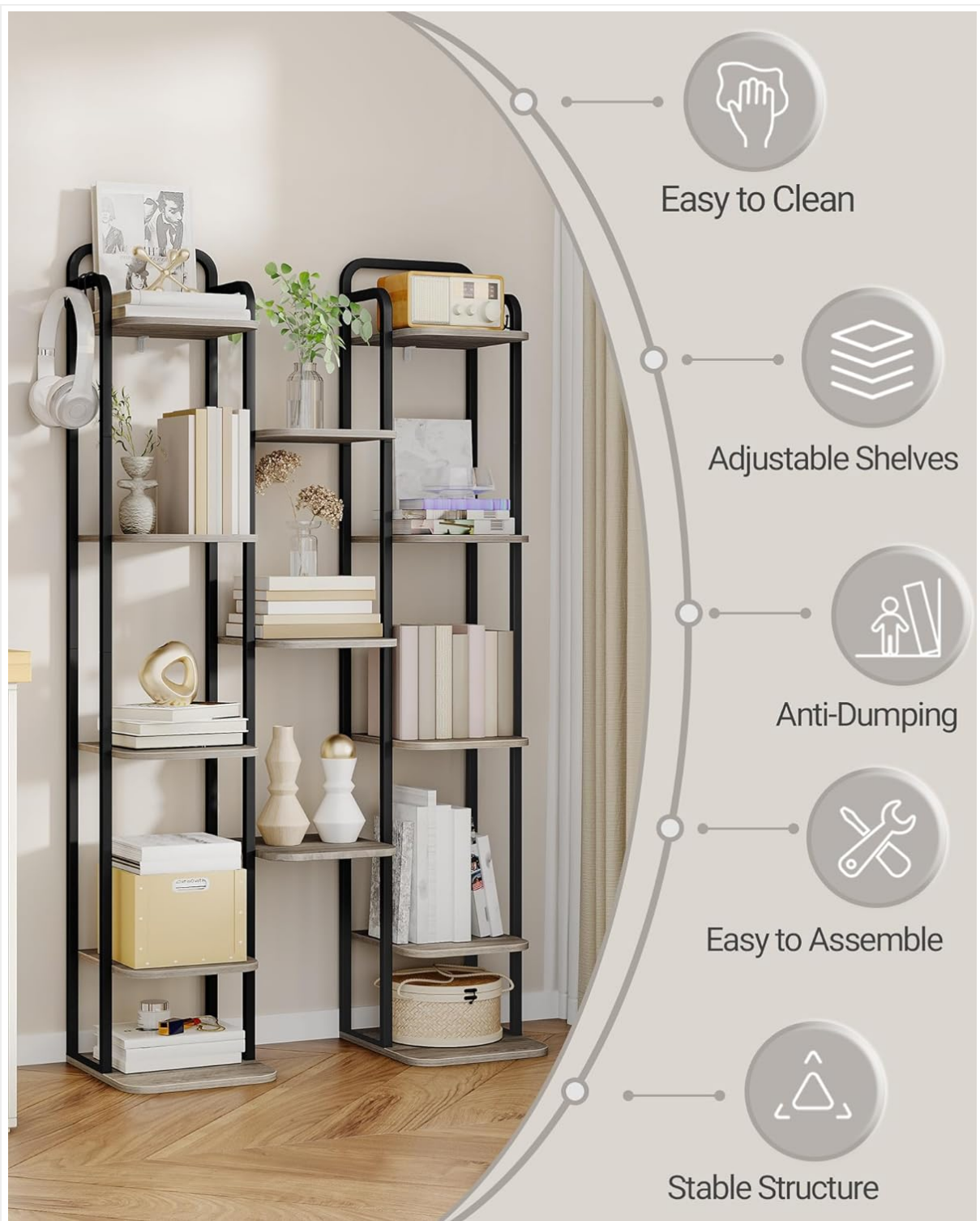
Image: Overview of key features, including ease of cleaning and structural stability.