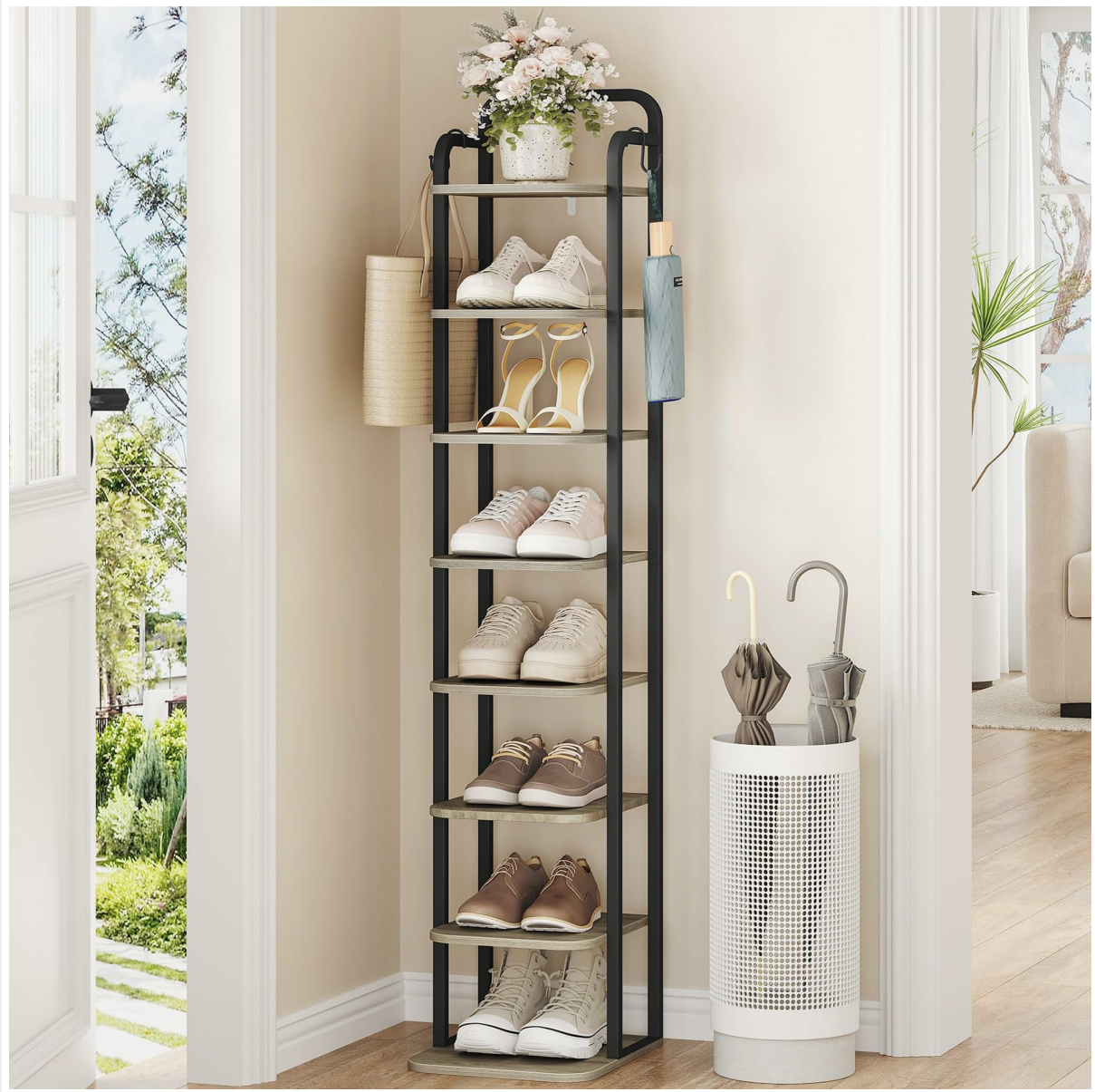
Image: The Hzueneri 8-Tier Vertical Shoe Rack, featuring a greige and black design, suitable for various home environments.