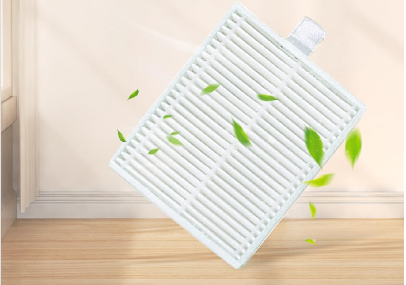
Image: The filter, designed for effective filtration to eliminate secondary pollution.

Prevent secondary pollution and protect the host.