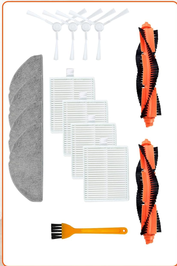
Image: Compatible Xiaomi robot vacuum cleaner models.