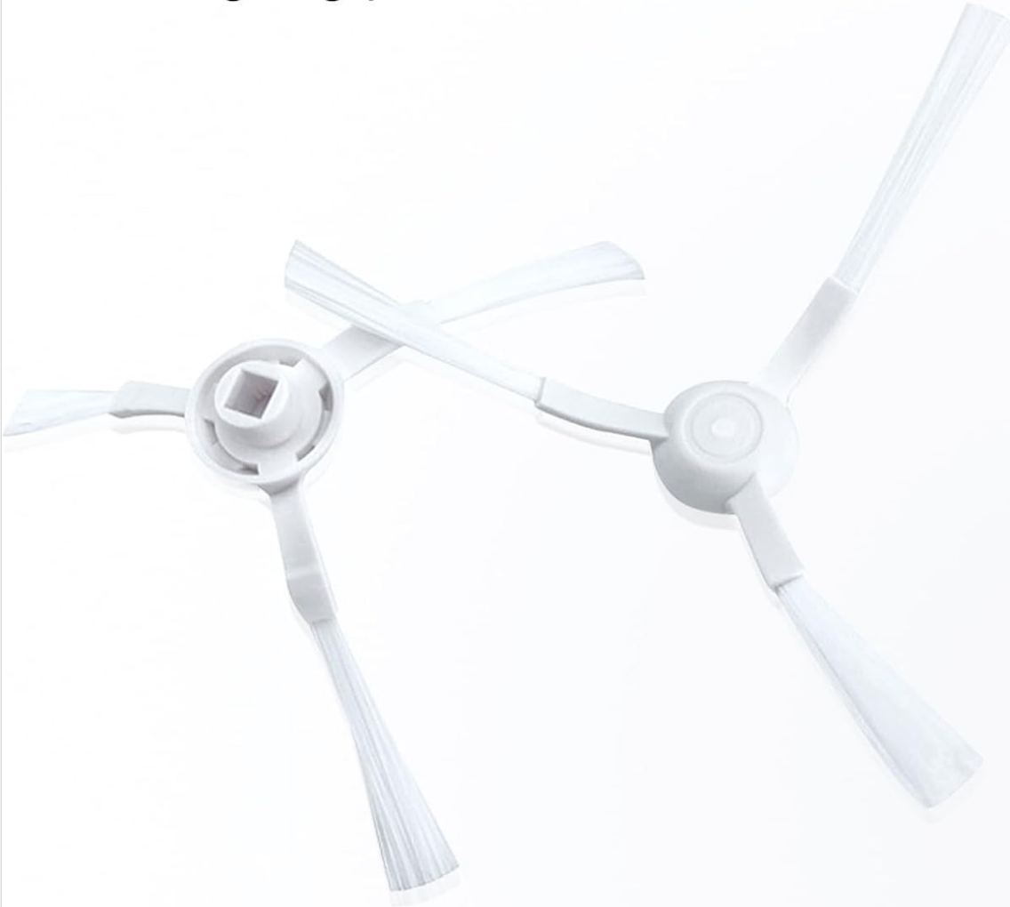
Image: Dimensional overview of the replacement parts.

Anti-winding edge brush structure prevents hair from entering the gap and facilitates hair collection