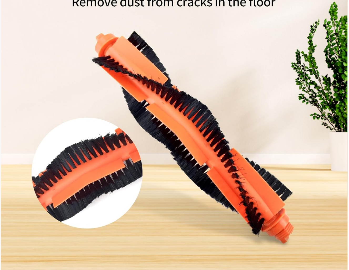
Image: Detail of the main brush, designed with nylon bristles for durability and effective cleaning.