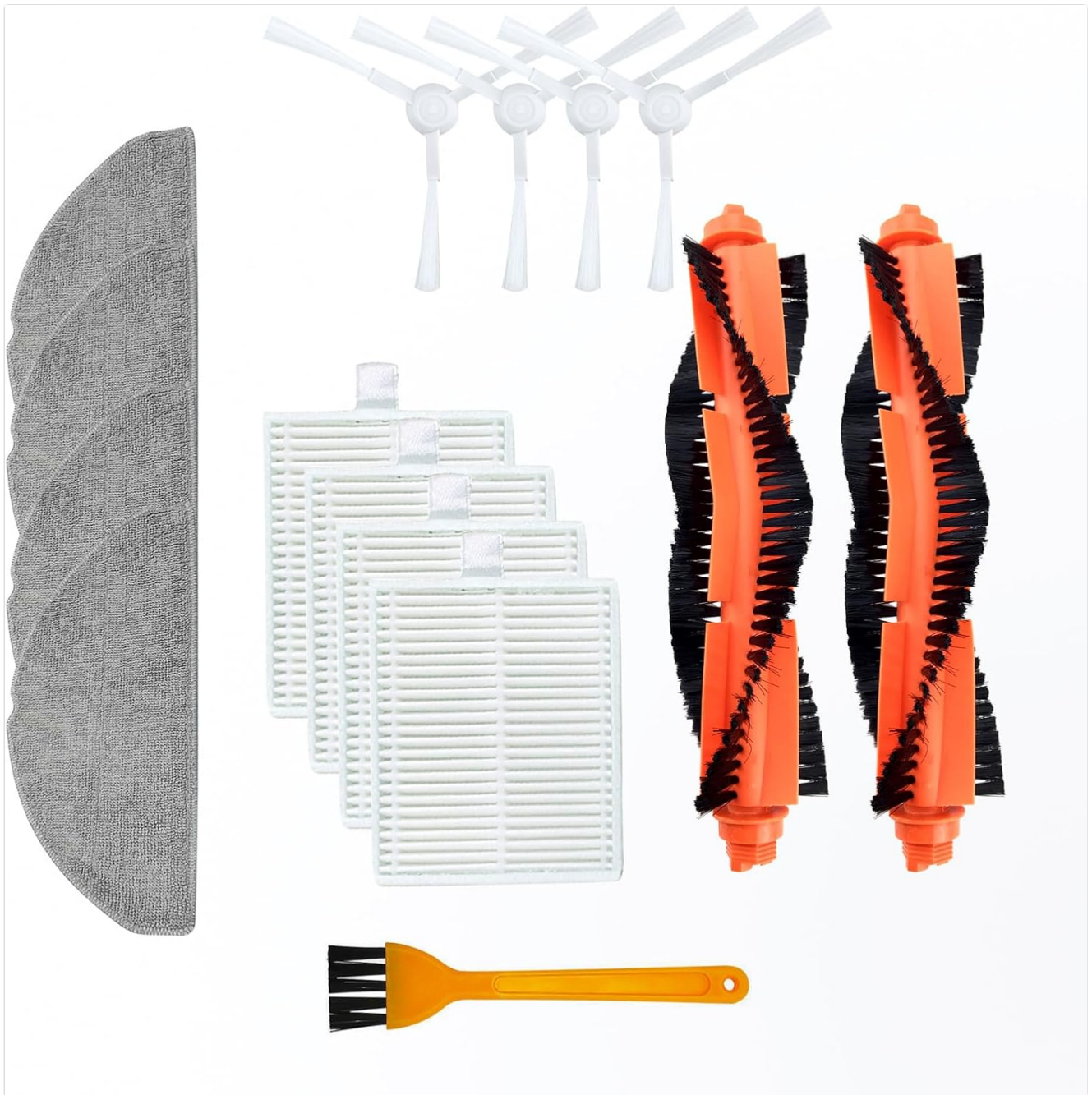
Image: Overview of all included replacement parts.

These parts are specifically designed for compatibility with Xiaomi E10, Xiaomi C103, and Xiaomi B112 robot vacuum cleaner models.