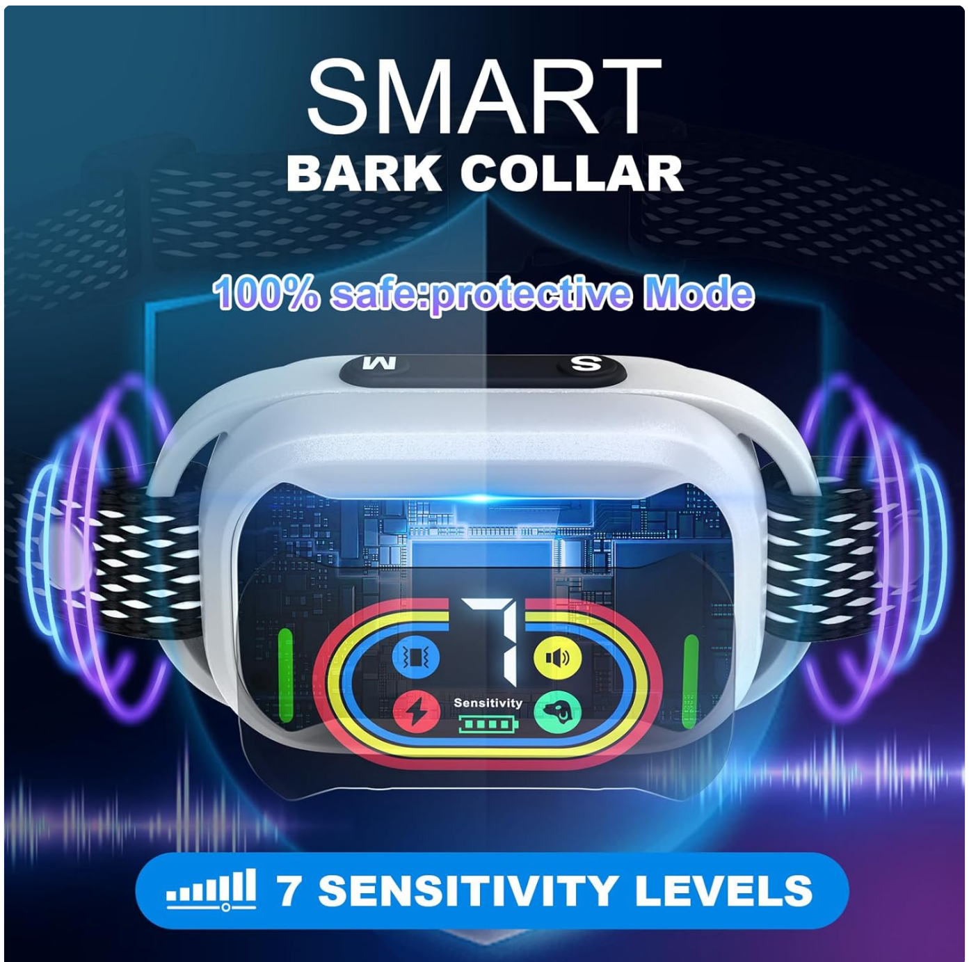
Image: A close-up of the bark collar's display showing the sensitivity level indicator, ranging from 1 to 7.

The collar features 7 adjustable sensitivity levels, allowing you to fine-tune how easily the collar detects your dog's bark. A higher sensitivity level means the collar will react to softer barks, while a lower level requires louder barks to trigger a response.