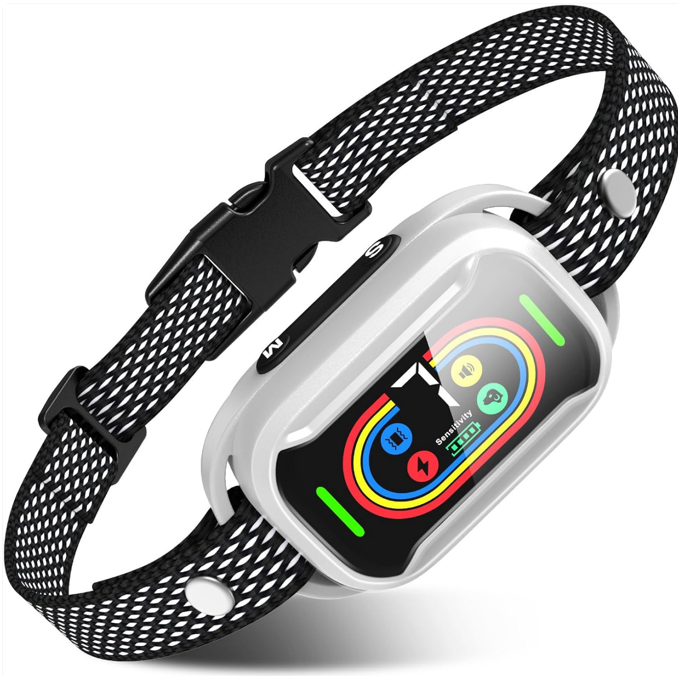
Image: The Pewkim Smart Bark Collar, featuring a white main unit with a colorful display attached to a black and white patterned adjustable strap.