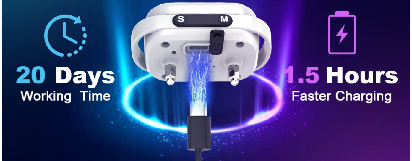
Image: The bark collar connected to a USB charging cable, illustrating the charging process and highlighting its long battery life.