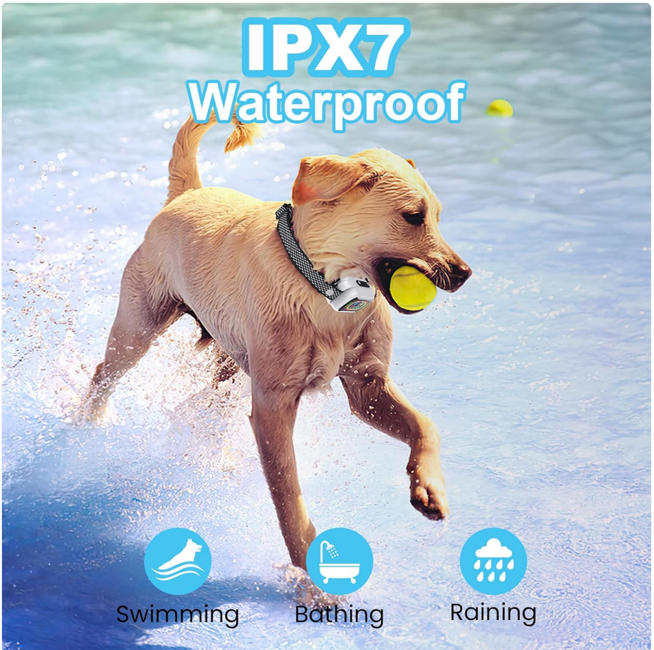
Image: A dog playing in water while wearing the bark collar, demonstrating its IPX7 waterproof rating for activities like swimming, bathing, and rain.