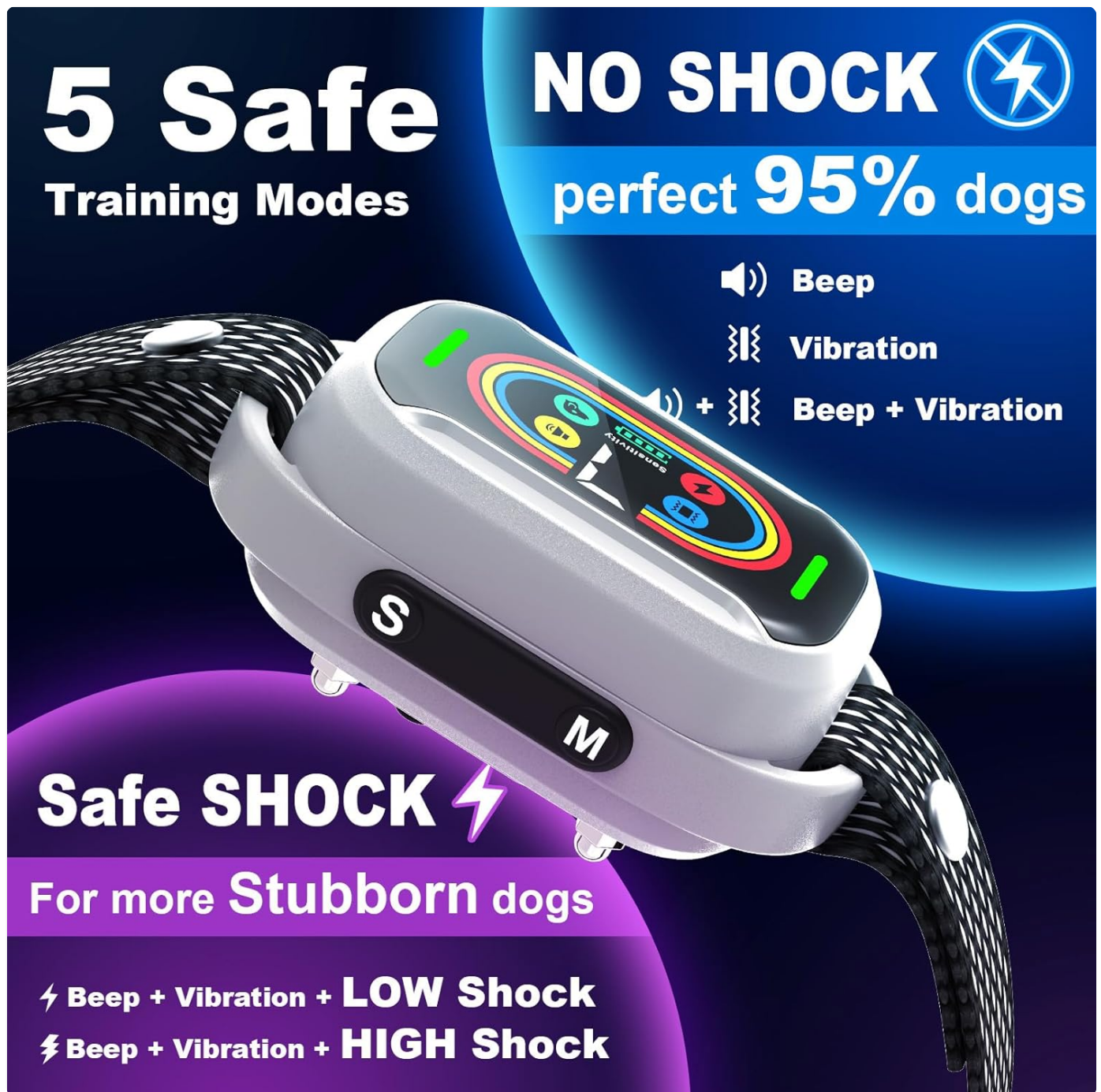
Image: The bark collar displaying icons for its five training modes: Beep, Vibration, Beep + Vibration, Beep + Vibration + LOW Shock, and Beep + Vibration + HIGH Shock.

The Pewkim Smart Bark Collar offers 5 safe training modes to address different barking behaviors. These modes can be cycled through using the mode button on the device.