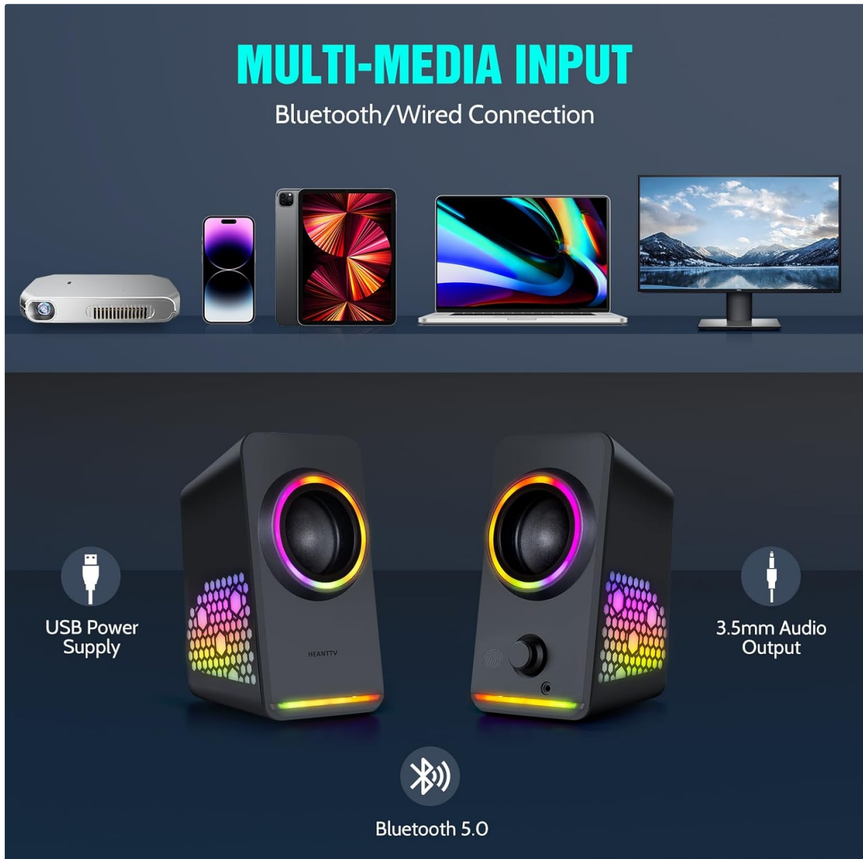
Figure 2: An illustration detailing the various connectivity options for the HEANTTV X6 speakers, including USB power, 3.5mm audio output, and Bluetooth 5.0, compatible with devices like laptops, smartphones, and projectors.