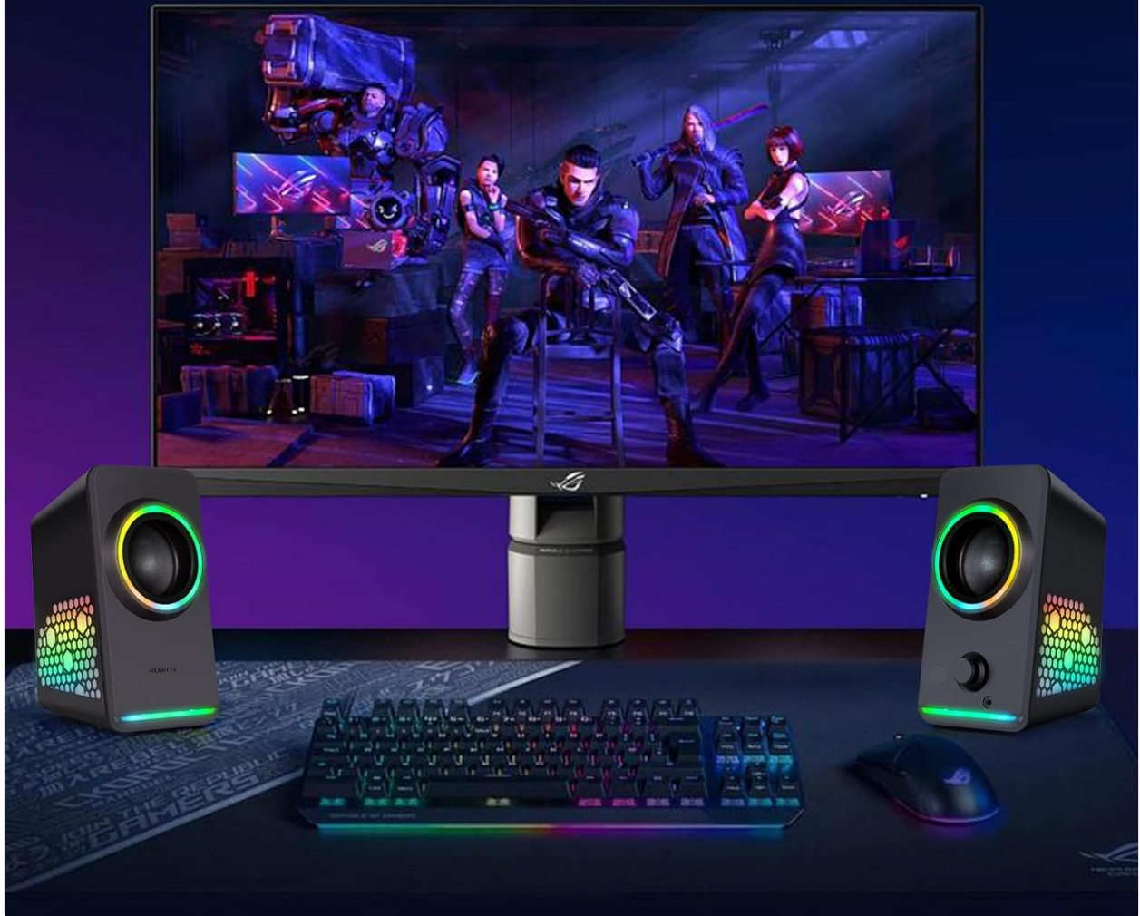
Figure 1: A detailed view of the HEANTTV X6 speaker's side panel, indicating the touch control for RGB lighting and mode switching, the volume knob, and the 3.5mm headphone jack.

Immersive feast of amazing music & vibrant light