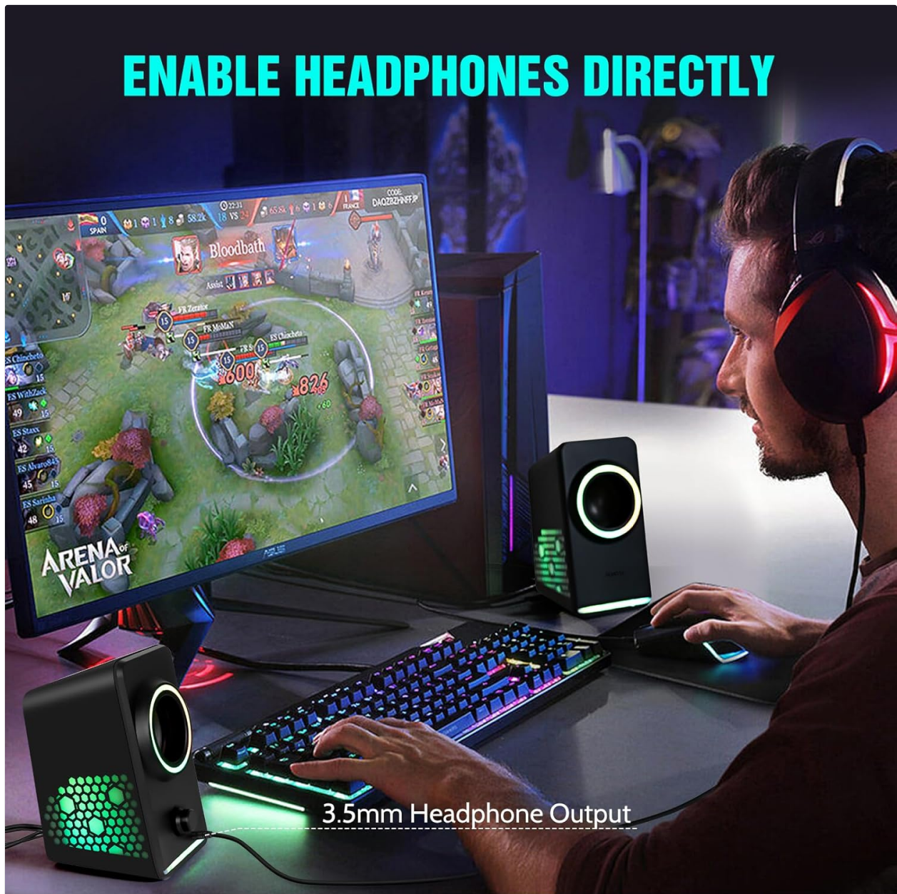
Figure 3: A user engaged in gaming, with headphones connected directly to the HEANTTV X6 speaker via its 3.5mm headphone output jack.

To use headphones, plug your 3.5mm headphones into the headphone jack located on the main speaker unit. This will typically mute the speakers and route audio to your headphones.