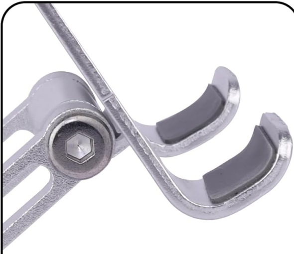
Anti-Skid Resting Pad