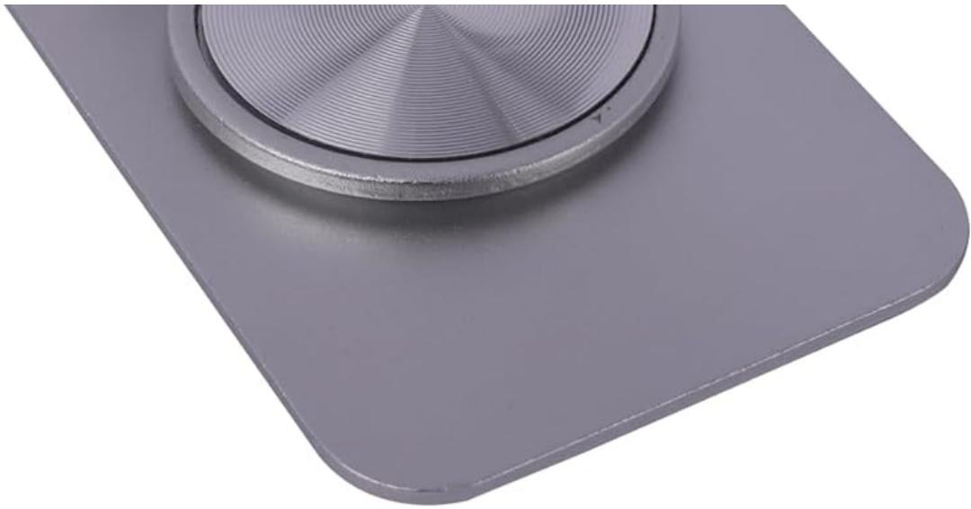
Image 1: The ZEBRONICS MTS150 Mobile Holder unfolded and ready for device placement.