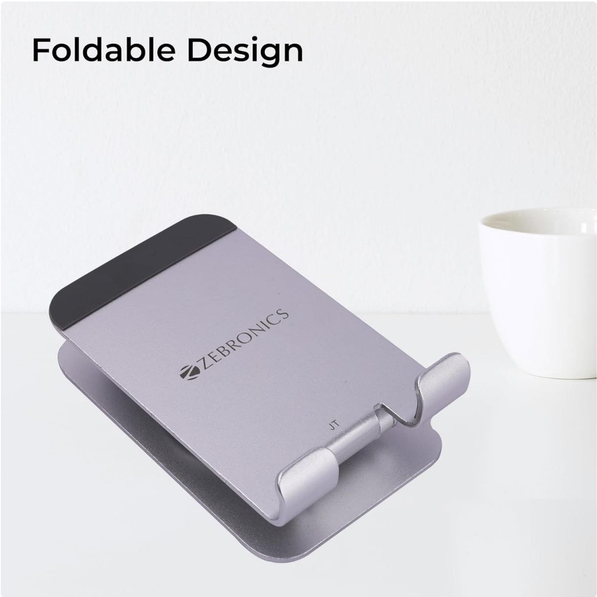
Image 5: The mobile holder showcasing its foldable design for easy storage.