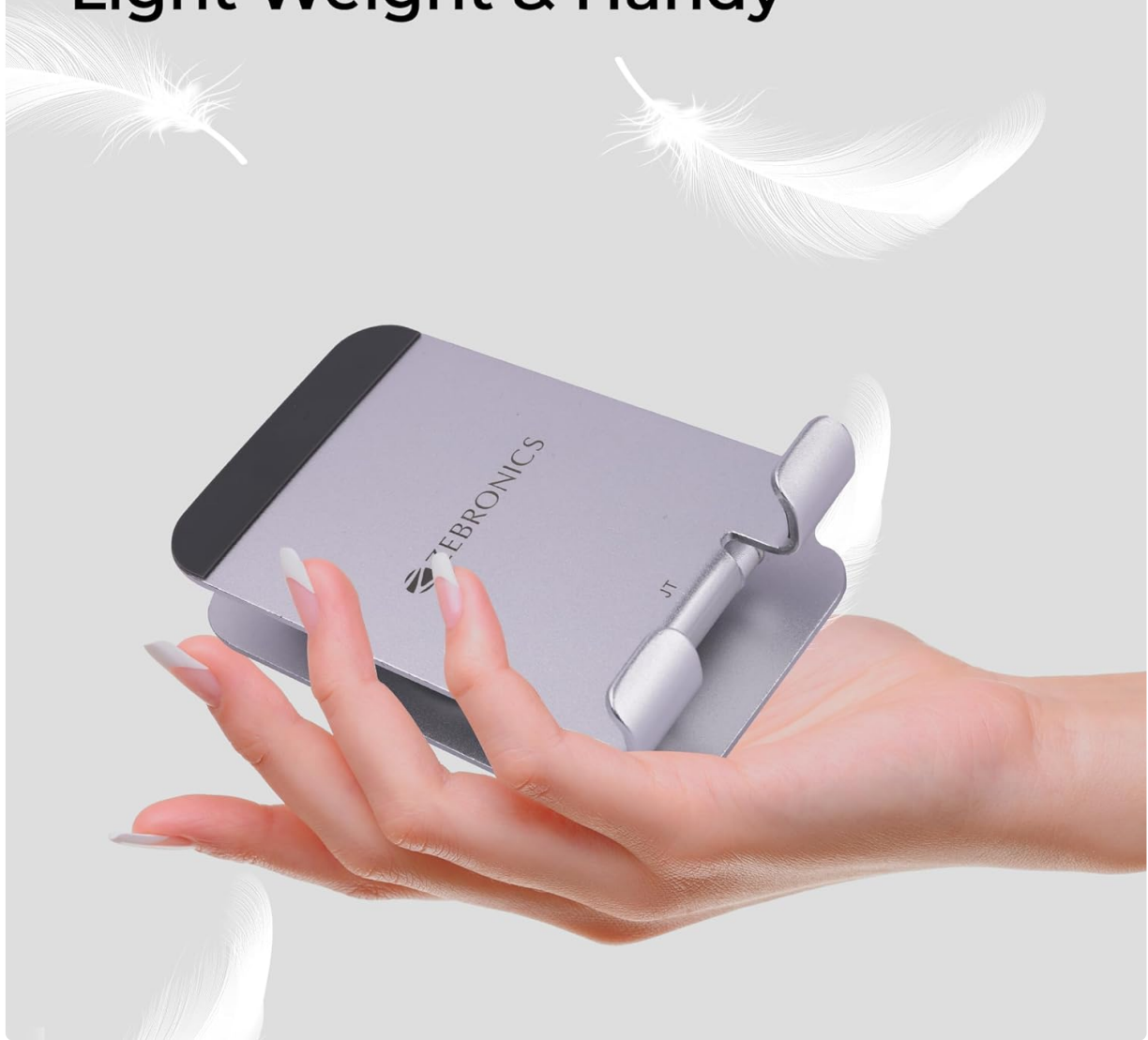
Image 7: The stand being held, highlighting its lightweight and handy design.