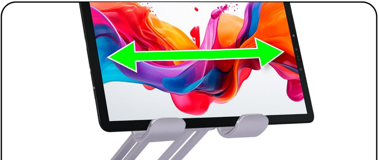
Max 24.63cm Screen Size