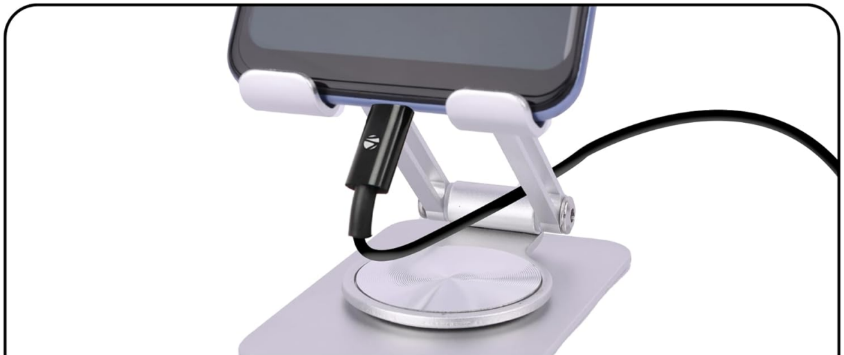
Cable Management For Charging

Image 4: Detailed view of the damping shaft and cable management slot with a phone charging.