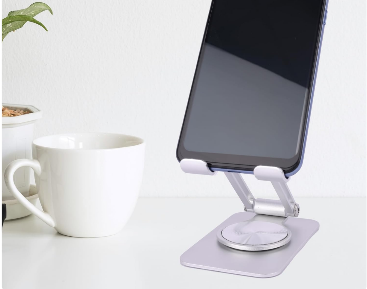
Image 2: The mobile holder supporting a smartphone, illustrating its compatibility.