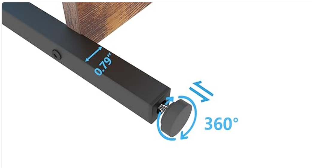
Image: Adjustable foot pad for leveling the desk.