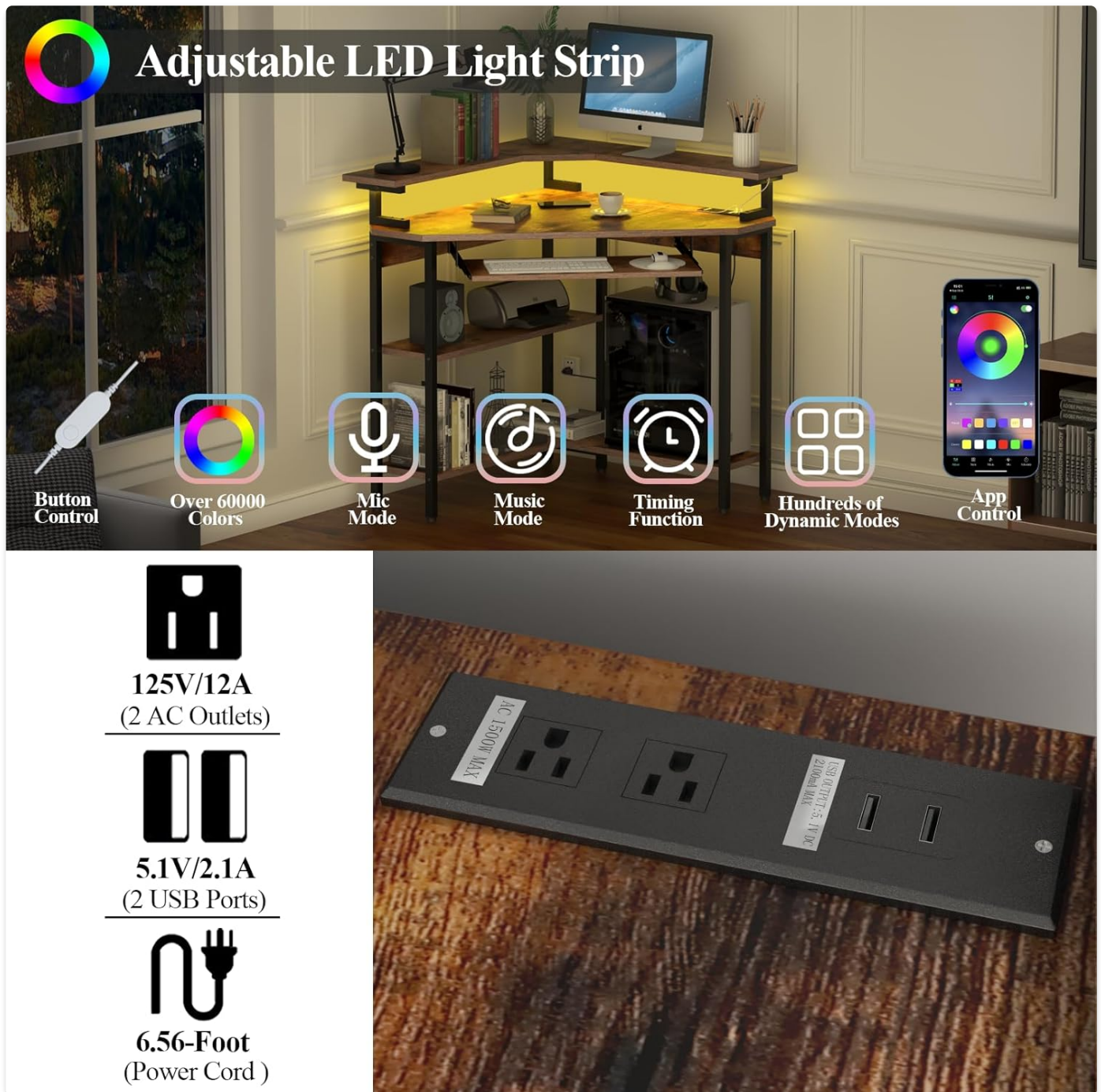
Image: Features of the adjustable LED light strip, including control options and color variety.