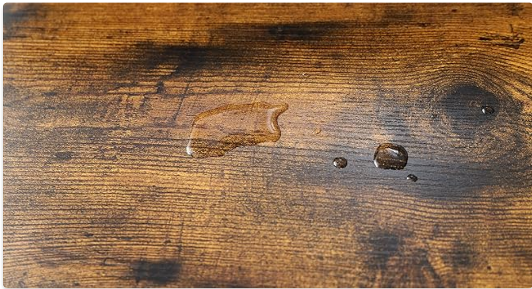
Image: Water droplets on the desk surface, illustrating its water-resistant finish.