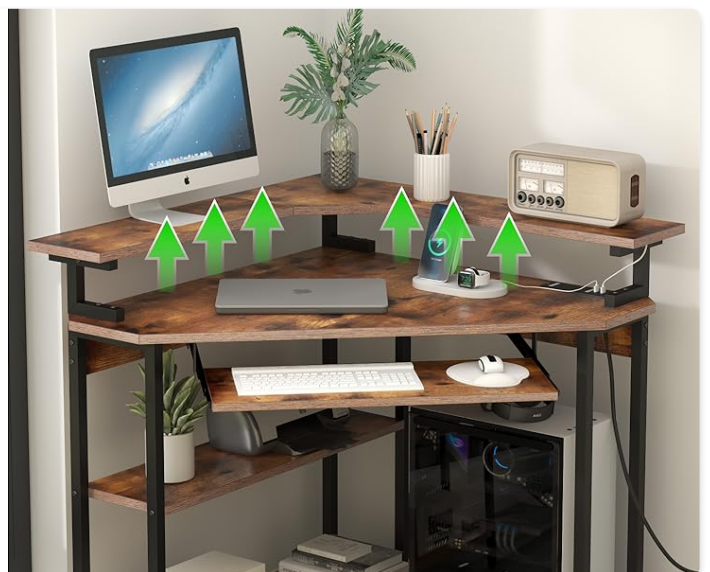
Image: The integrated charging station with AC and USB ports.

Bring Your Monitor to New Heights for keep your sitting posture correct