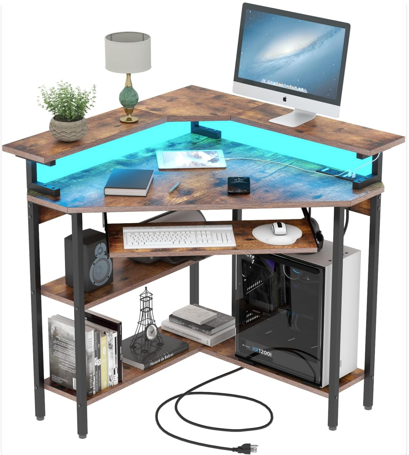
Image: The Auromie Corner Desk, showcasing its design and features in a home office setting.