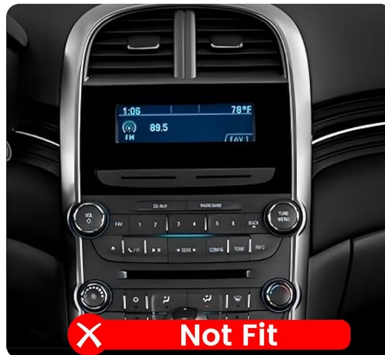
Image: Visual guide indicating compatible and incompatible dashboard configurations for the Chevy Aveo 2011-2015 model range. Ensure your vehicle's dashboard matches the 'Fit' examples.

Note: If your car is equipped with an original car amplifier, please contact the seller for specific guidance before purchasing or installing.