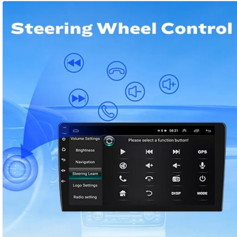
Image: The car stereo displaying the 'Steering Learn' interface, used to configure and map vehicle steering wheel buttons to stereo functions.

manage audio, calls, and other functions without taking your hands off the wheel. The system includes a 'Steering Learn' function to map your vehicle's controls.