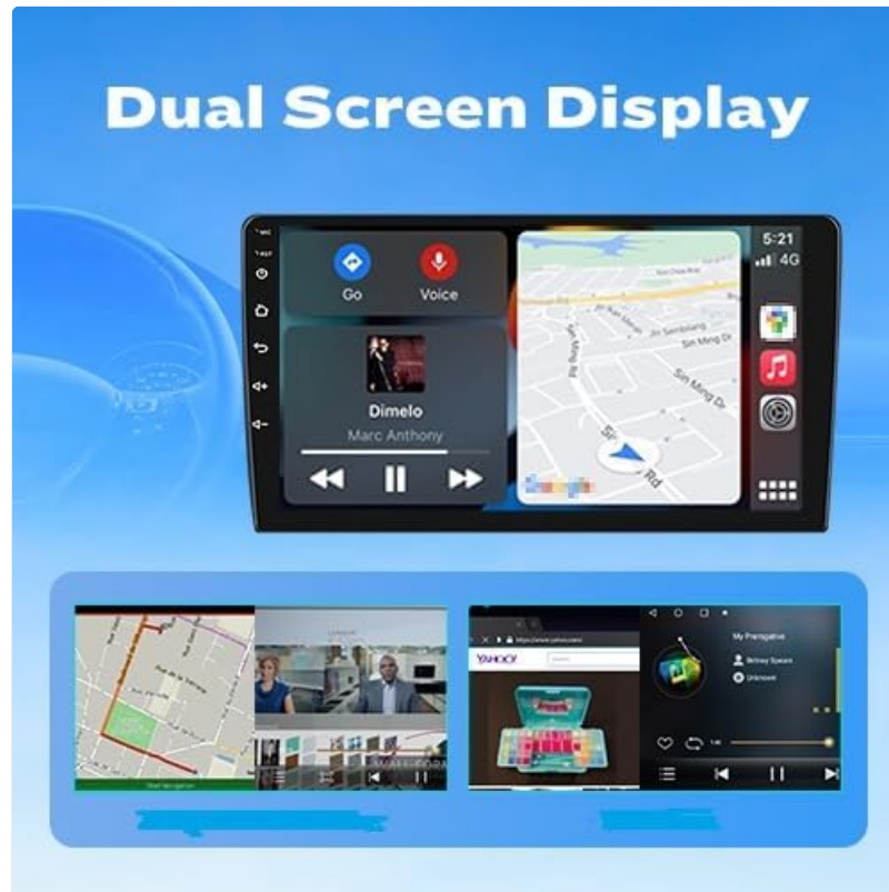
Image: The car stereo displaying two applications side-by-side, demonstrating the dual-screen functionality for multitasking.

Utilize the dual-screen display feature to run two applications simultaneously. For example, you can have navigation active on one side of the screen while controlling music playback or viewing another application on the other side.