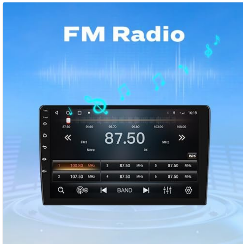
Image: The car stereo displaying the FM radio interface, showing frequency tuning and station presets.

Tune into your favorite FM radio stations. The system allows for station scanning and saving presets for quick access.