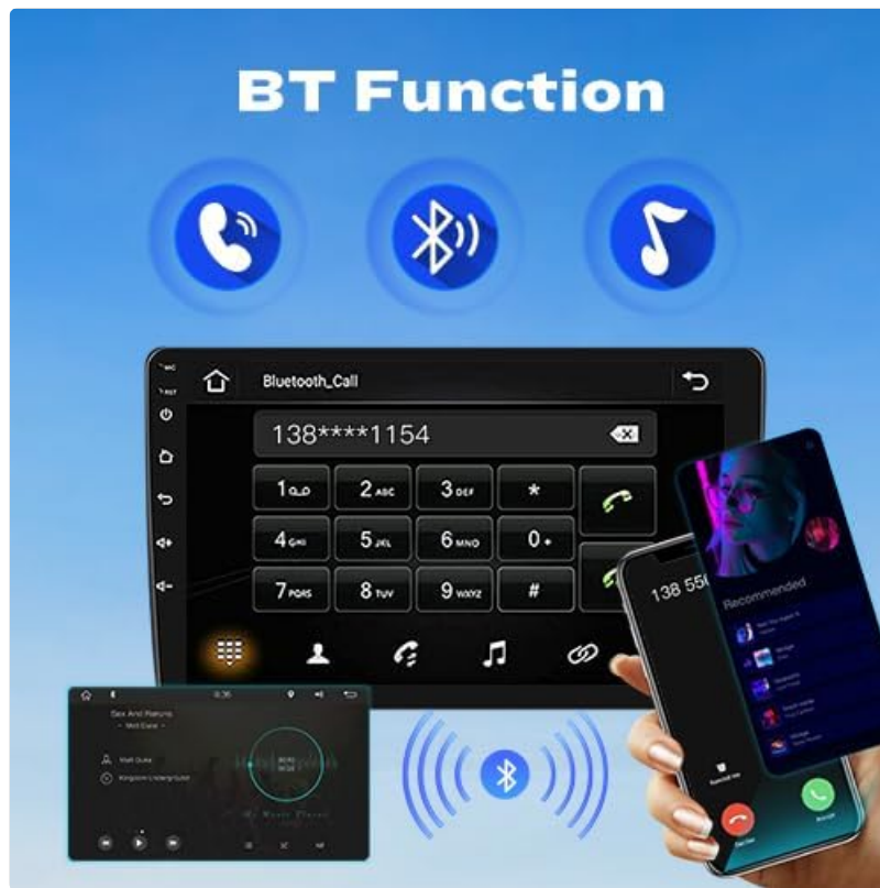
Image: The car stereo displaying the Bluetooth calling interface, showing a dial pad and contact information for hands-free communication.