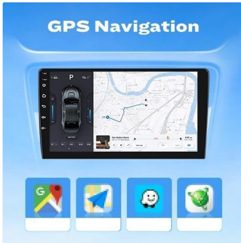
Image: The car stereo displaying a GPS navigation map, showing routes and points of interest.