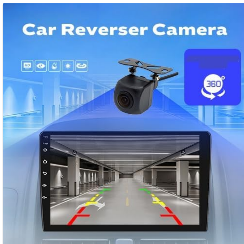
Image: The car stereo displaying the view from a rear-mounted camera, showing parking guidelines for assistance.

The system supports a car reverser camera input. When the vehicle is shifted into reverse, the display automatically switches to the camera feed, providing a clear view of the area behind your vehicle for safer parking and maneuvering. An AHD reverse camera is included in the package.