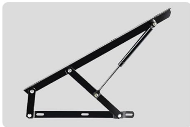
Easily lift up