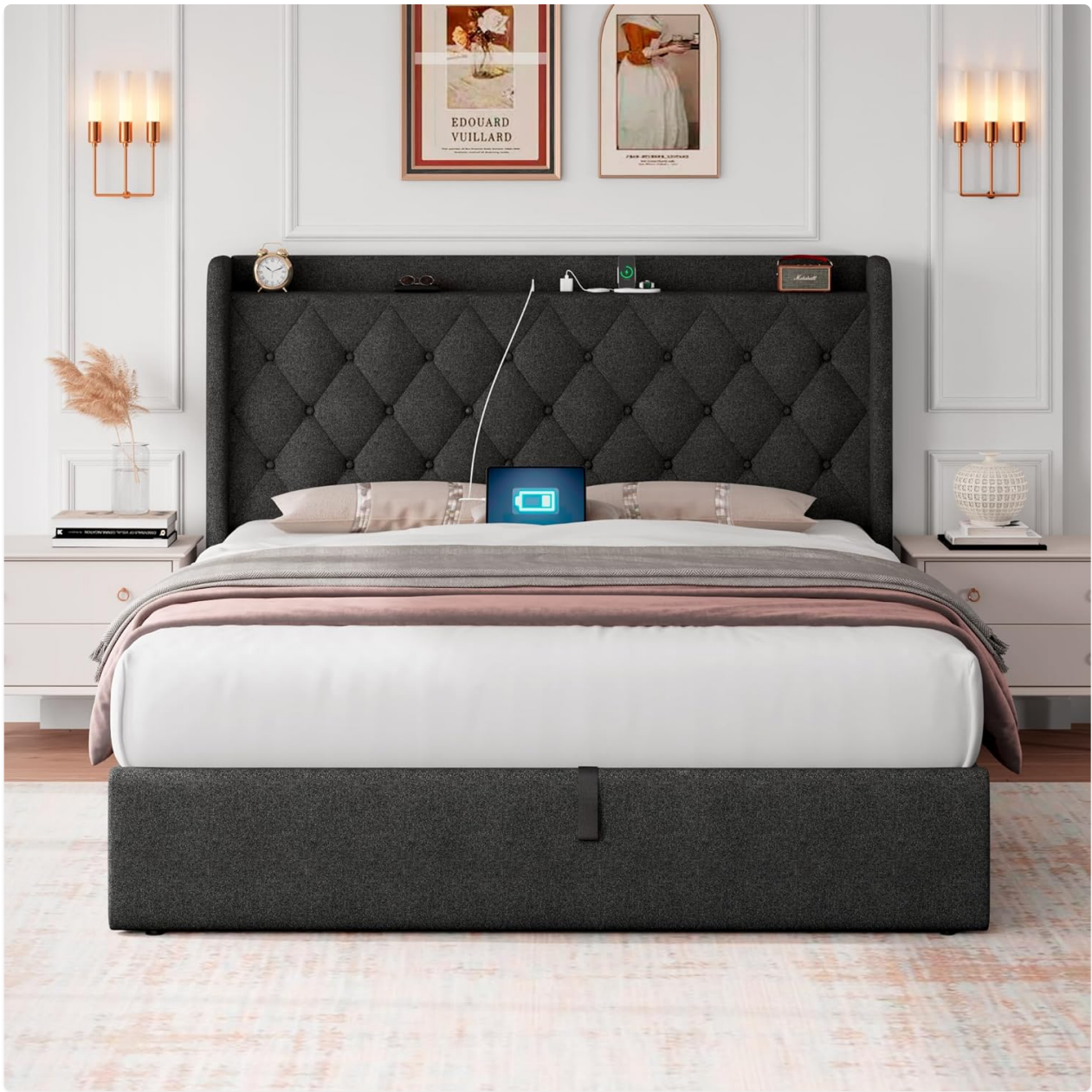
Image 1.1: Full view of the iPormis Queen Size Lift Up Storage Bed Frame.