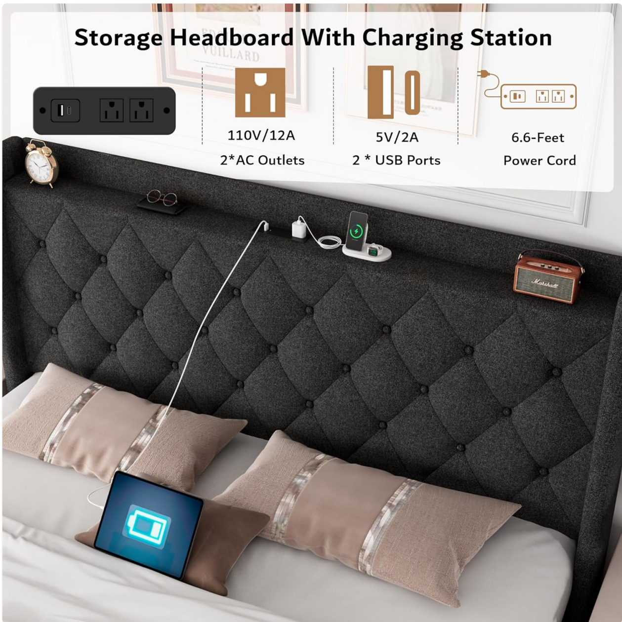
Image 3.1: Close-up of the tufted headboard with integrated charging station.