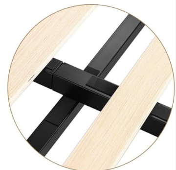
Sturdy Metal Structure