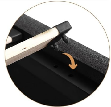
Easy Assembly Slats