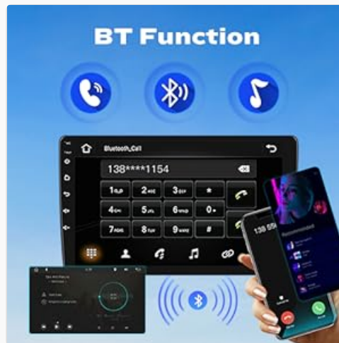
Image: The car stereo display showing the Bluetooth interface for making calls and streaming music. It displays a dial pad for phone calls and icons representing Bluetooth connectivity and audio playback.

Pair your smartphone to the unit via Bluetooth for hands-free calling and audio streaming.