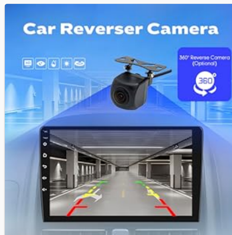
Image: The car stereo display showing the view from a rear-mounted camera, complete with parking guidelines, indicating the reverse camera functionality.

If the reverse camera is installed, it will automatically display the rear view when the vehicle is shifted into reverse gear.