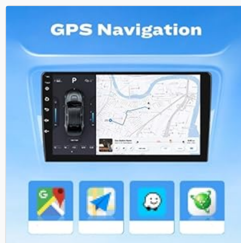
Image: The car stereo display showing a GPS navigation map, with icons for various navigation applications such as Google Maps, iGO, and others, indicating support for multiple mapping services.

The unit supports various navigation applications. Ensure the GPS antenna is properly installed for accurate positioning.