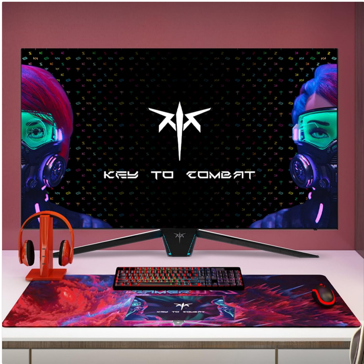
Image: KTC monitor stand with active ambient RGB lighting.