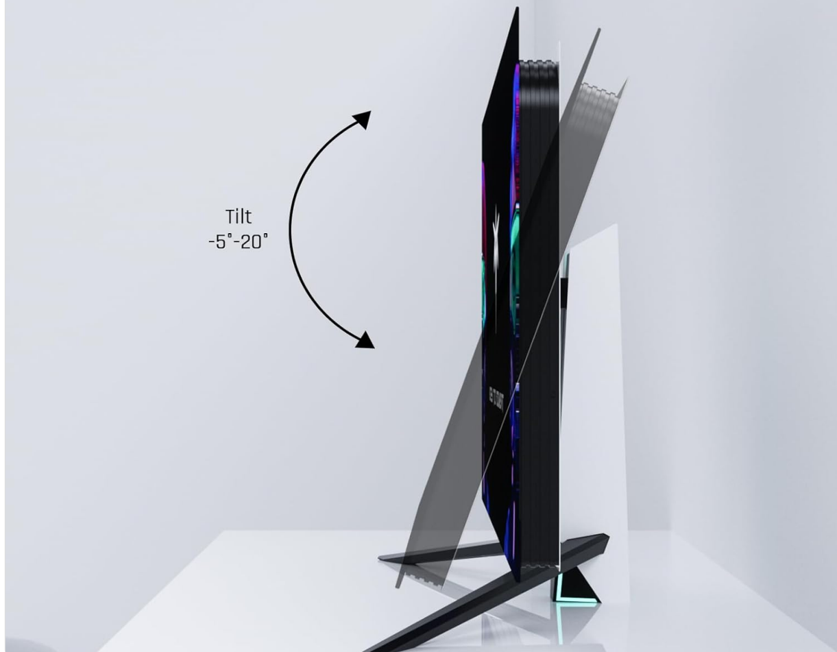
Image: Illustration of the monitor's tilt adjustment capability.