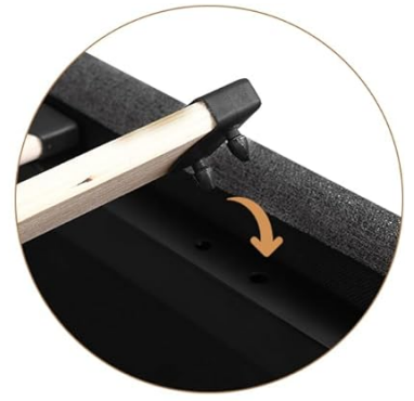
Easy Assembly Slats