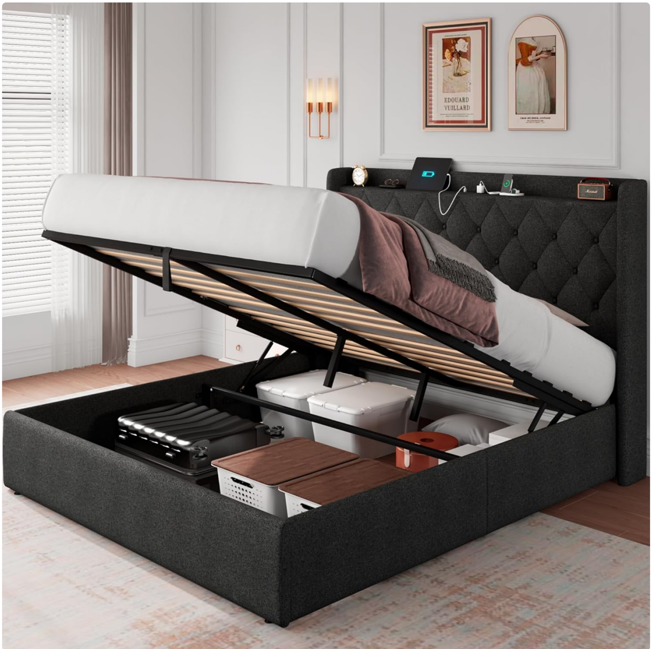
Image: The iPormis Full Size Lift Up Storage Bed Frame in dark grey, with the mattress platform lifted to showcase the spacious under-bed storage area. Various storage bins and luggage are visible inside.