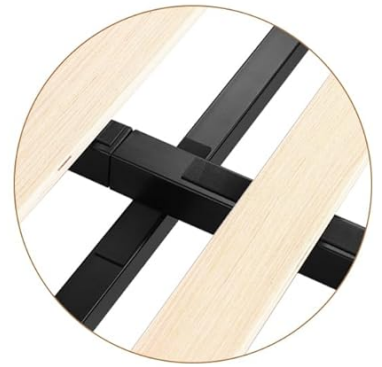
Sturdy Metal Structure

Image: A detailed view highlighting the easy assembly slats, noise-free foam padding on the frame, and the sturdy metal structure of the bed frame, emphasizing its construction quality.