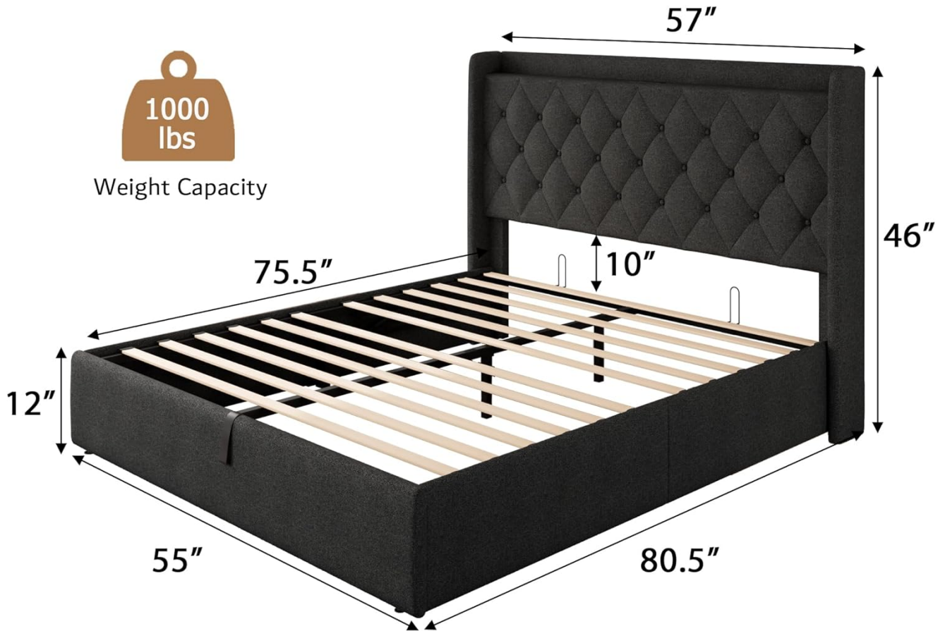
Image: A diagram illustrating the full dimensions of the iPormis Full Size bed frame (80.5"L x 57"W x 46"H) and its weight capacity of 1000 lbs, along with the 10.8-inch highest storage height.