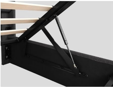
Hydraulic Lift Mechanism