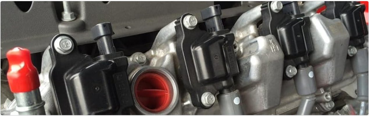
Image: An overhead view of an engine bay, showing multiple spark plugs and their associated ignition coils installed in the engine block. This illustrates the typical location for spark plug installation.