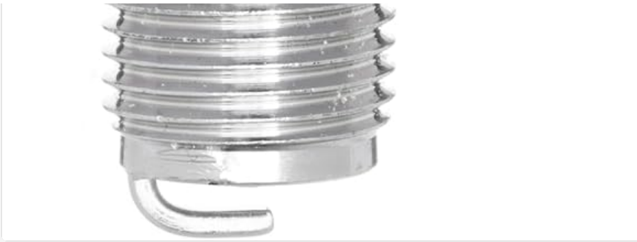
Image: A detailed view of the NGK BR6ES spark plug, highlighting its ceramic insulator, metal shell, and electrode tip. The threaded portion and terminal nut are clearly visible.