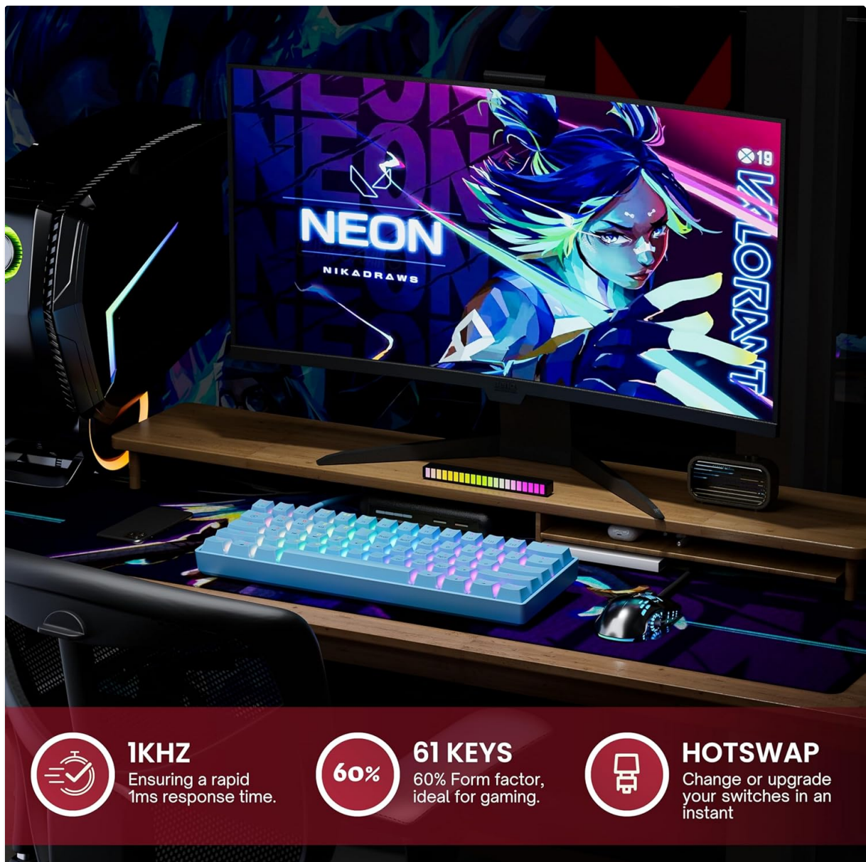
Image: The GK61 keyboard integrated into a gaming setup, illustrating its connection and compact form factor.