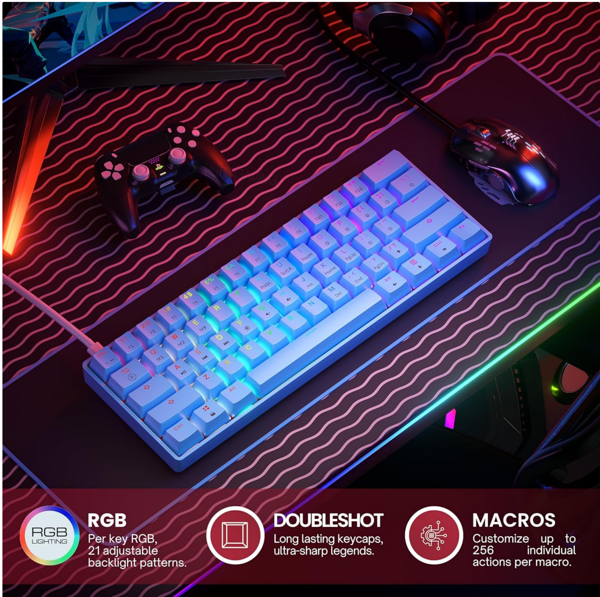
Image: The GK61 keyboard displaying its vibrant RGB lighting, highlighting features like per-key RGB, doubleshot keycaps, and macro customization.

The adaptable software allows users to customize complex macros and rebind keys to suit individual preferences and optimize workflow or gaming performance.