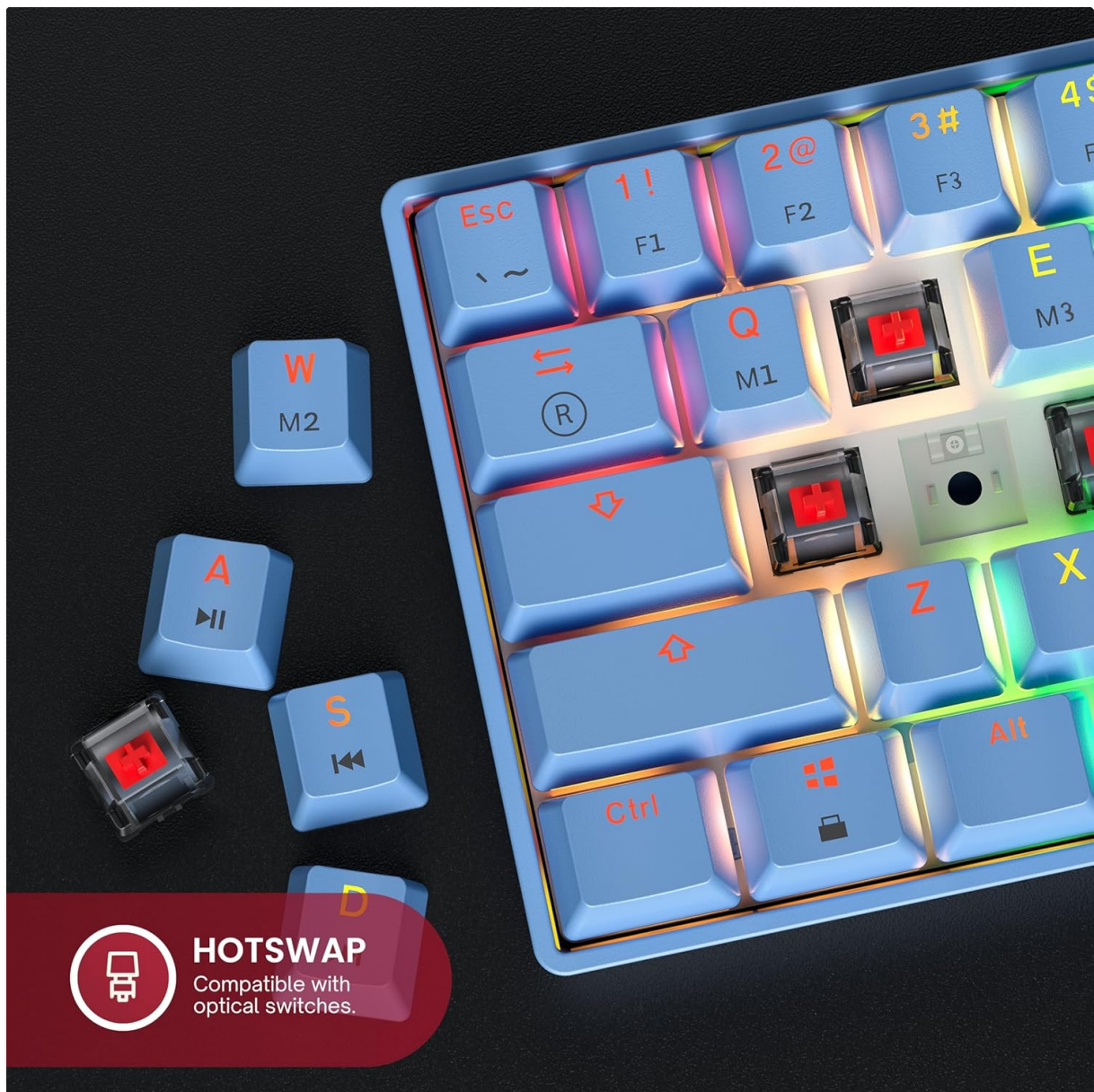
Image: A close-up view of the GK61 keyboard, showing individual keycaps and the underlying hotswap optical switches.