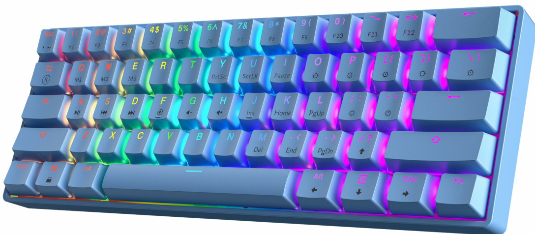
Image: The HK GAMING GK61 60% v3 keyboard, showcasing its compact design and RGB lighting.

The HK GAMING GK61 60% v3 is a compact, hotswap mechanical gaming keyboard designed for performance and customization. This manual provides instructions for setup, operation, maintenance, and troubleshooting to ensure optimal use of your keyboard.