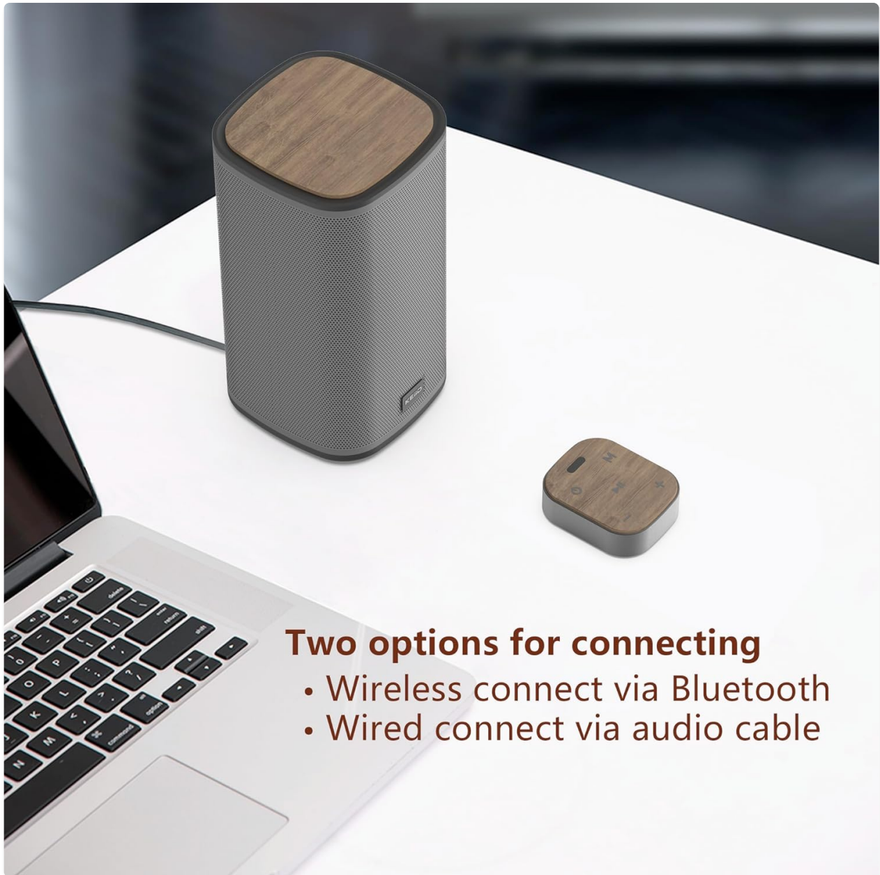
Figure 7.1: Wireless and Wired Connectivity

For devices without Bluetooth or for a stable wired connection, use the included 3.5mm audio cable. Simply connect one end to the AUX input on the speaker and the other end to the audio output of your device (e.g., computer, TV, MP3 player).