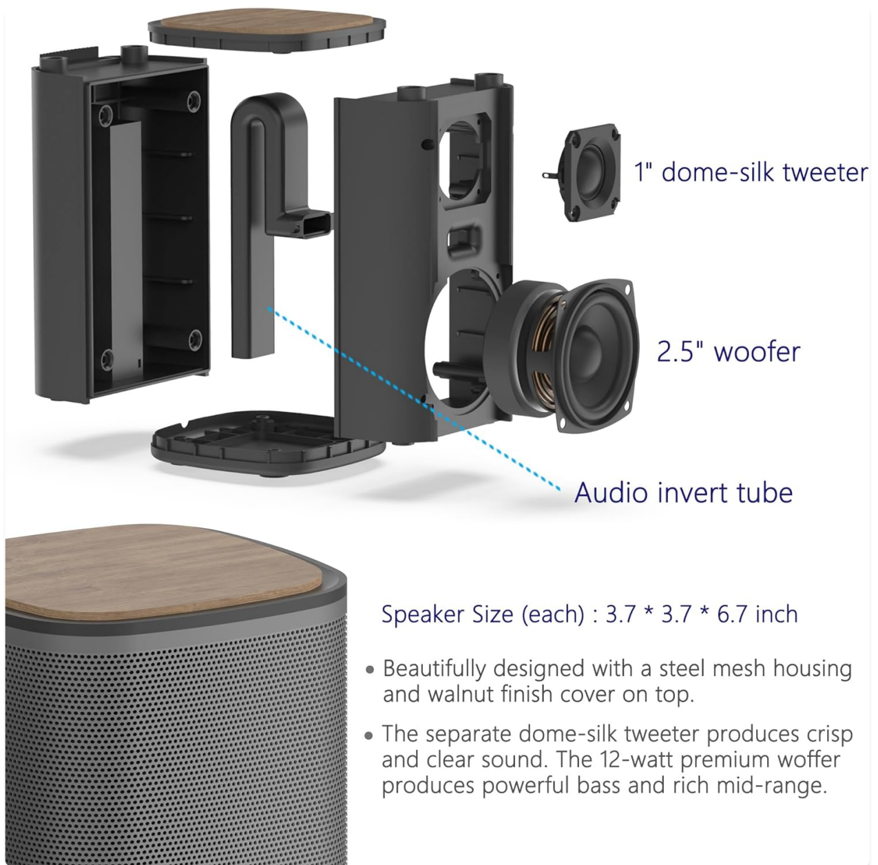
Figure 3.1: Speaker Internal Components