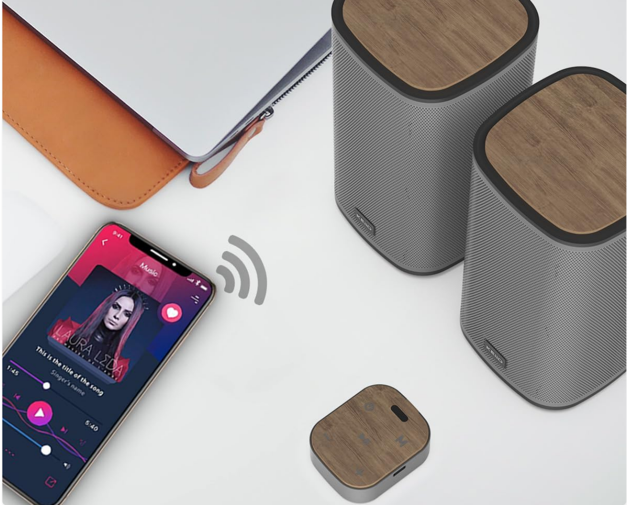
Figure 7.2: Bluetooth Connection with Phone

Via Bluetooth or 3.5mm audio cable, you can also connect it to your phone, iPod, tablet, echo dot, smart TV etc. and turn them to be stereo.