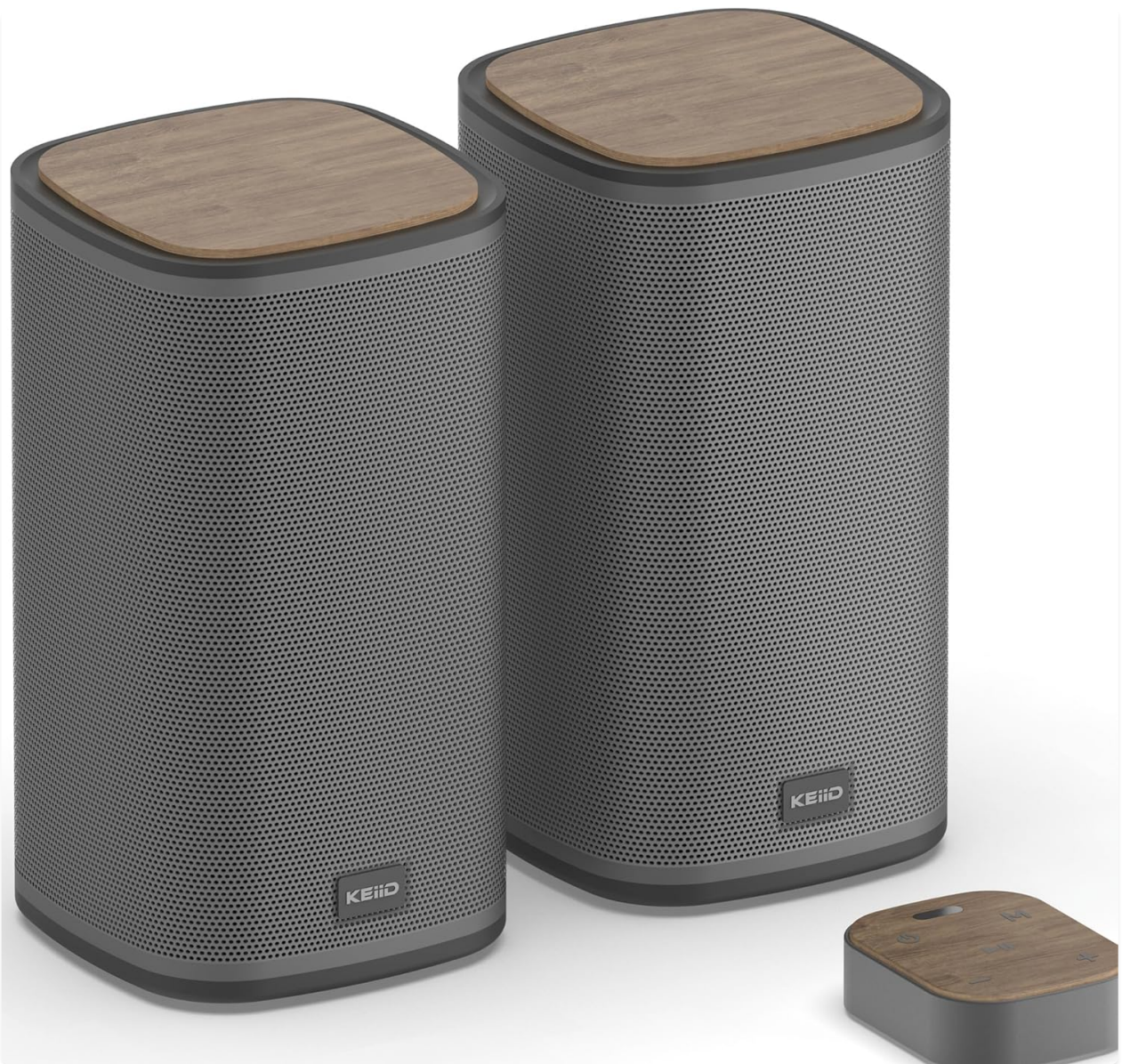
Figure 1.1: KEiiD KD-C02 Bluetooth Computer Speakers and Wireless Control Pod