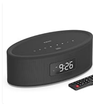
Figure 5.1: Using the Touch Control Pod