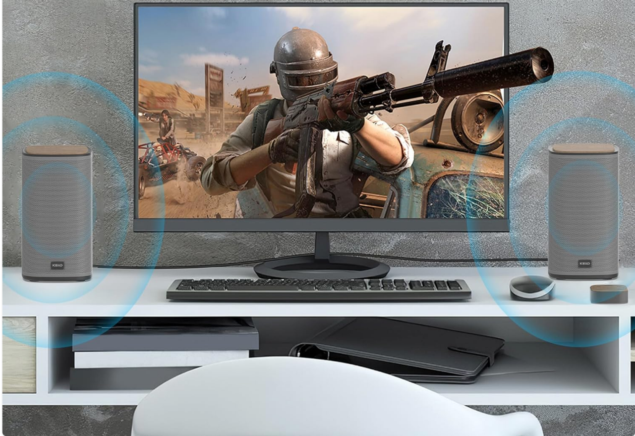
Figure 6.1: Gaming Experience with KD-C02

4 EQ options (for News, Music, Movie, and Game), The Game EQ mode includes 3D surround sound, which is perfect for gaming.