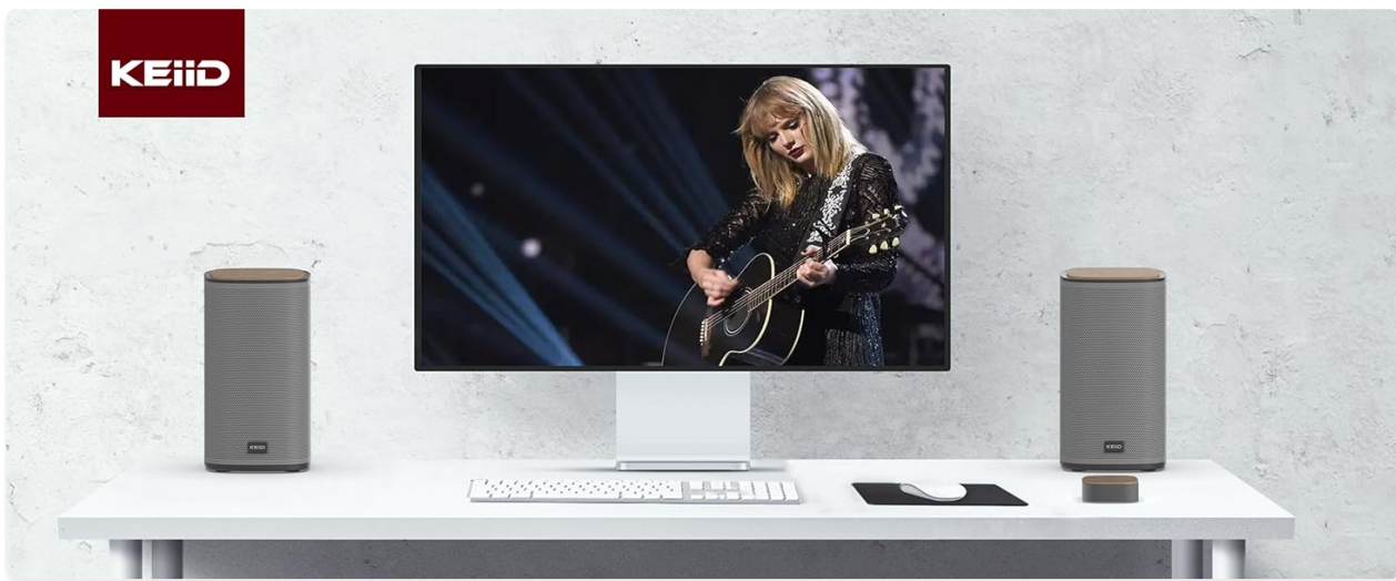
Figure 4.1: Wired Setup Diagram