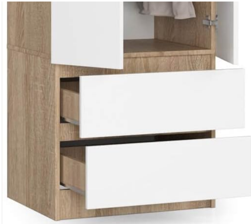
Figure 3: An interior view of the AKORD S60 wardrobe with its doors and drawers open. This image clearly shows the internal configuration, including the upper shelves, the central hanging rail, and the two lower drawers, demonstrating its versatile storage capabilities.