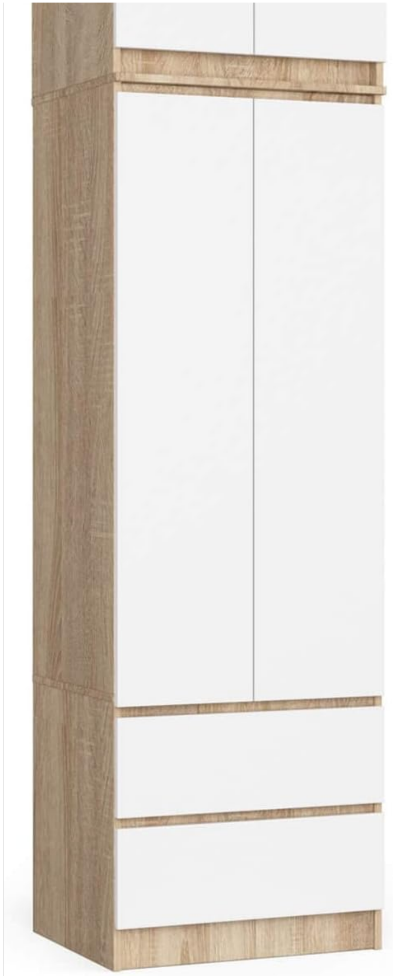
Figure 2: A full front view of the AKORD S60 wardrobe, showcasing its Sonoma Oak and White finish. This image displays the two doors and two drawers, highlighting the overall aesthetic and design of the assembled unit.