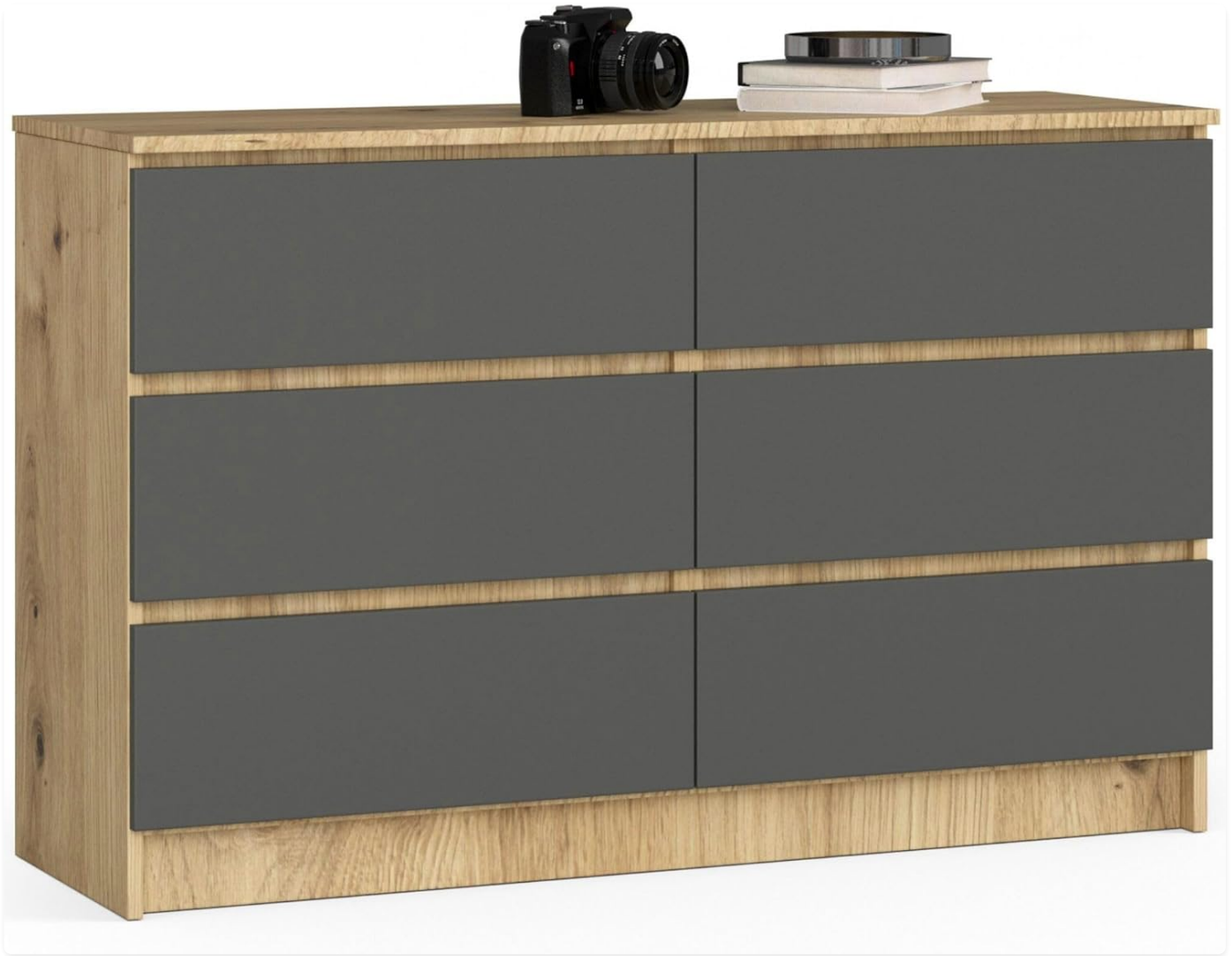
Figure 1: Front view of the AKORD K120 Artisan Oak Chest of Drawers. This image displays the dresser's overall appearance, highlighting its six graphite grey drawers and the artisan oak finish of the frame. A camera and books are placed on top, demonstrating its use as a display surface.