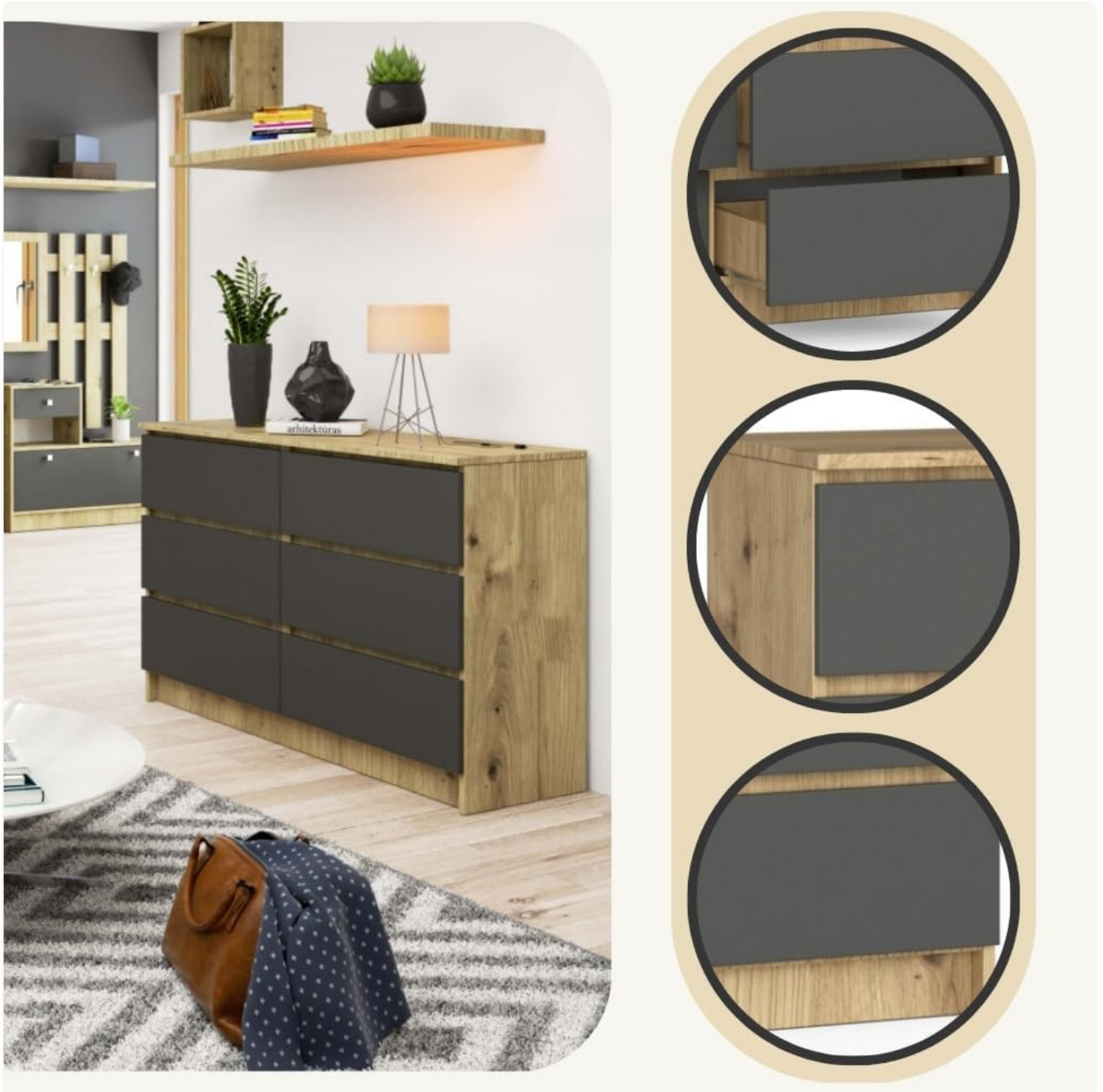
Figure 5: Detail of the dresser's finished edges. This image highlights the quality of the ABS-coated edges, which contribute to the durability and aesthetic appeal of the furniture, protecting it from wear and tear.