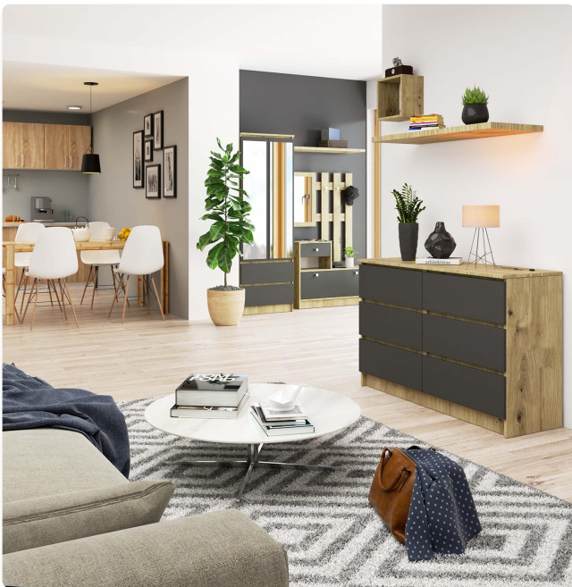
Figure 3: The K120 dresser integrated into a modern living room. This image illustrates how the dresser can complement contemporary decor and function within a living space, showcasing its aesthetic appeal and versatility.