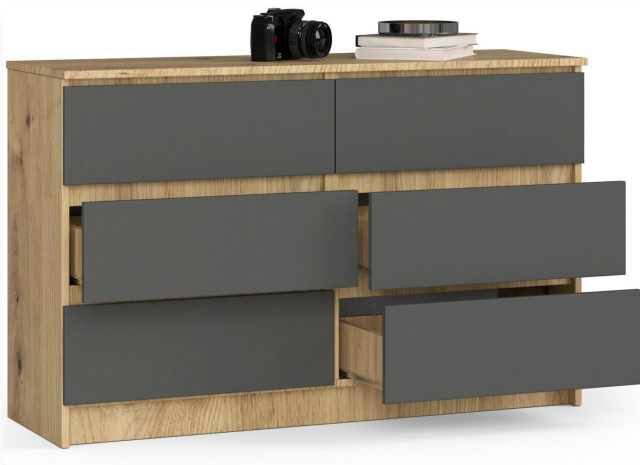
Figure 4: The K120 dresser with drawers open. This view demonstrates the functionality of the drawers, showing their capacity and the smooth operation of the metal guides, which are designed for easy access to stored items.