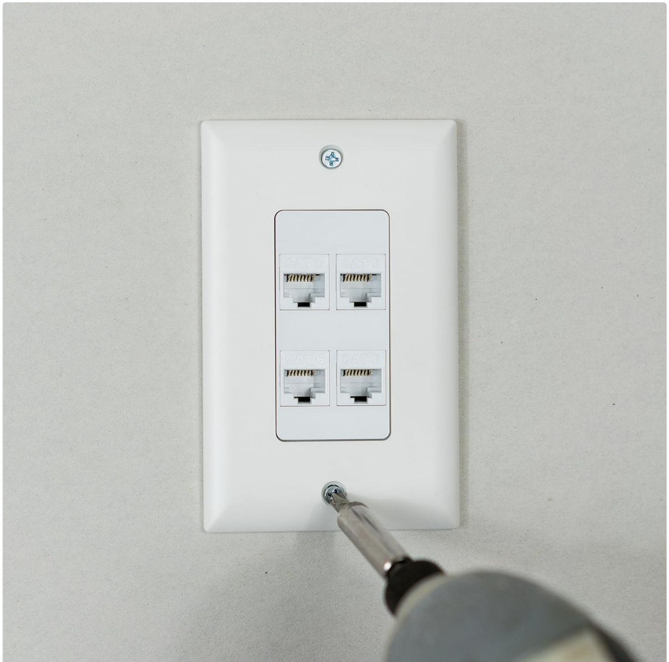
Figure 4.2: An On-Q WP3414WH 4-Port Decorator Outlet Strap installed in a wall plate, with a screwdriver tightening a screw, illustrating the final installation step before attaching the outer wall plate.