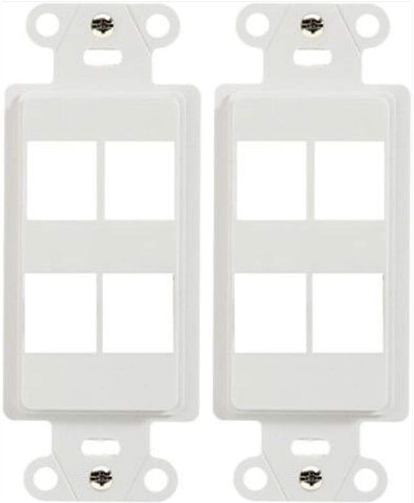
Figure 3.1: Front view of two On-Q WP3414WH 4-Port Decorator Outlet Straps, showing the four rectangular openings for keystone jacks on each strap.