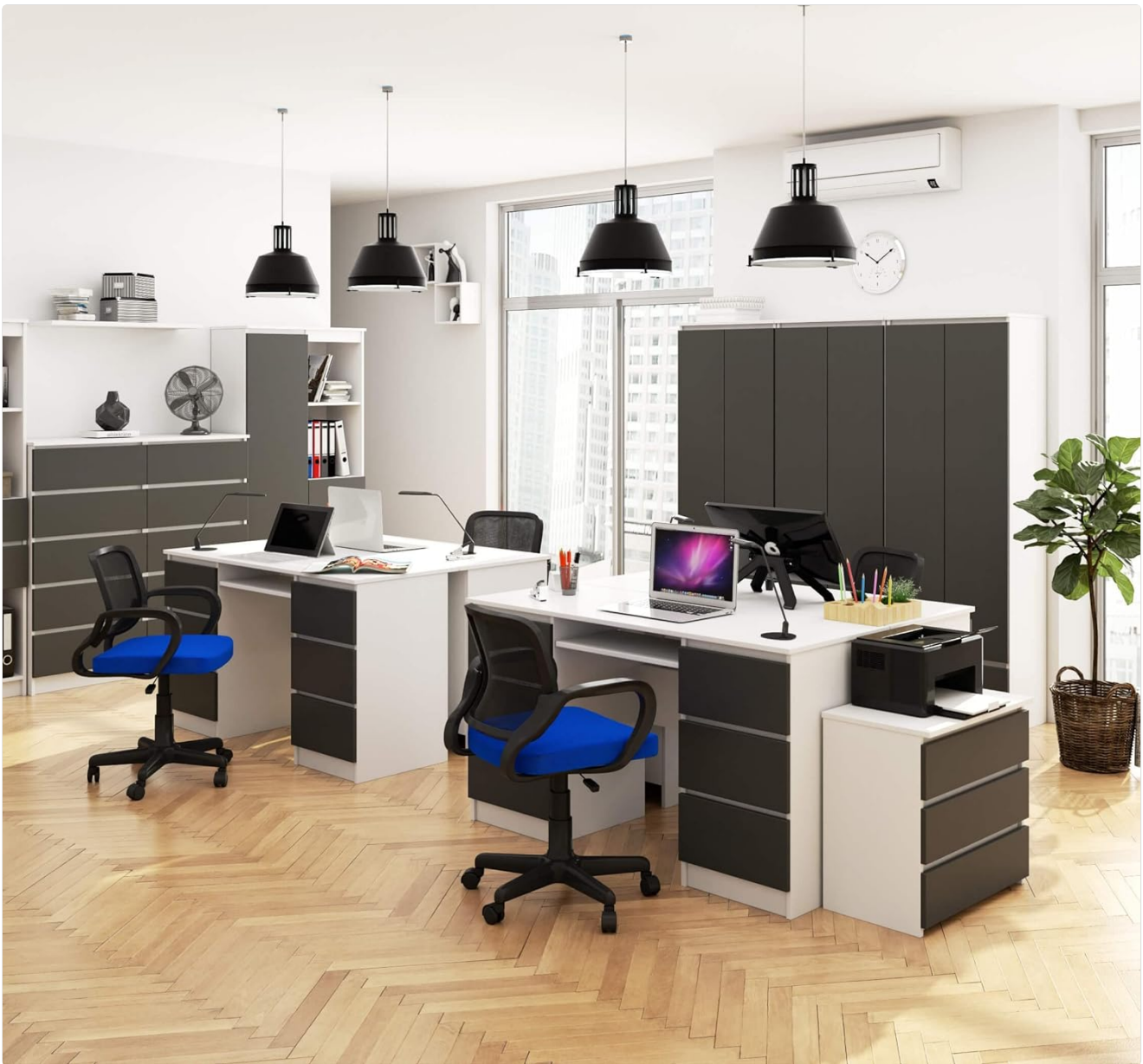
Image 1.1: AKORD A11 Computer Desk in a typical office environment. This image illustrates the desk's appearance and potential use.