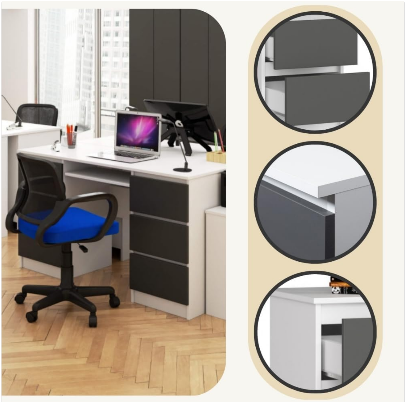
Image 4.1: The AKORD A11 desk with drawers partially open, showcasing the storage capacity and the pull-out keyboard tray.