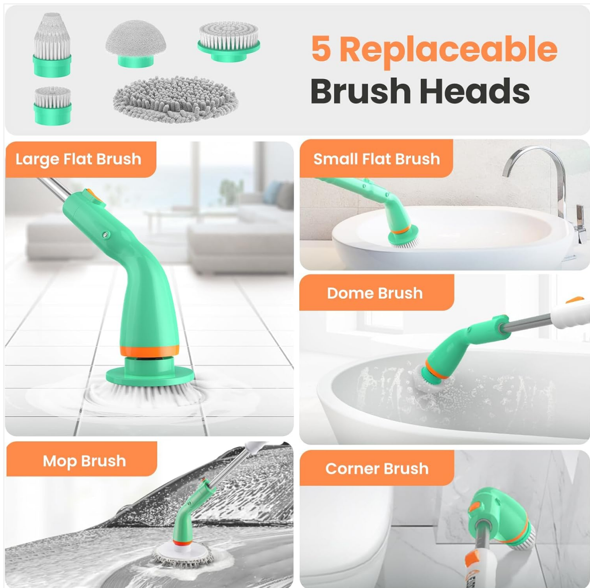
Figure 4.1: Application of different brush heads for various cleaning needs.