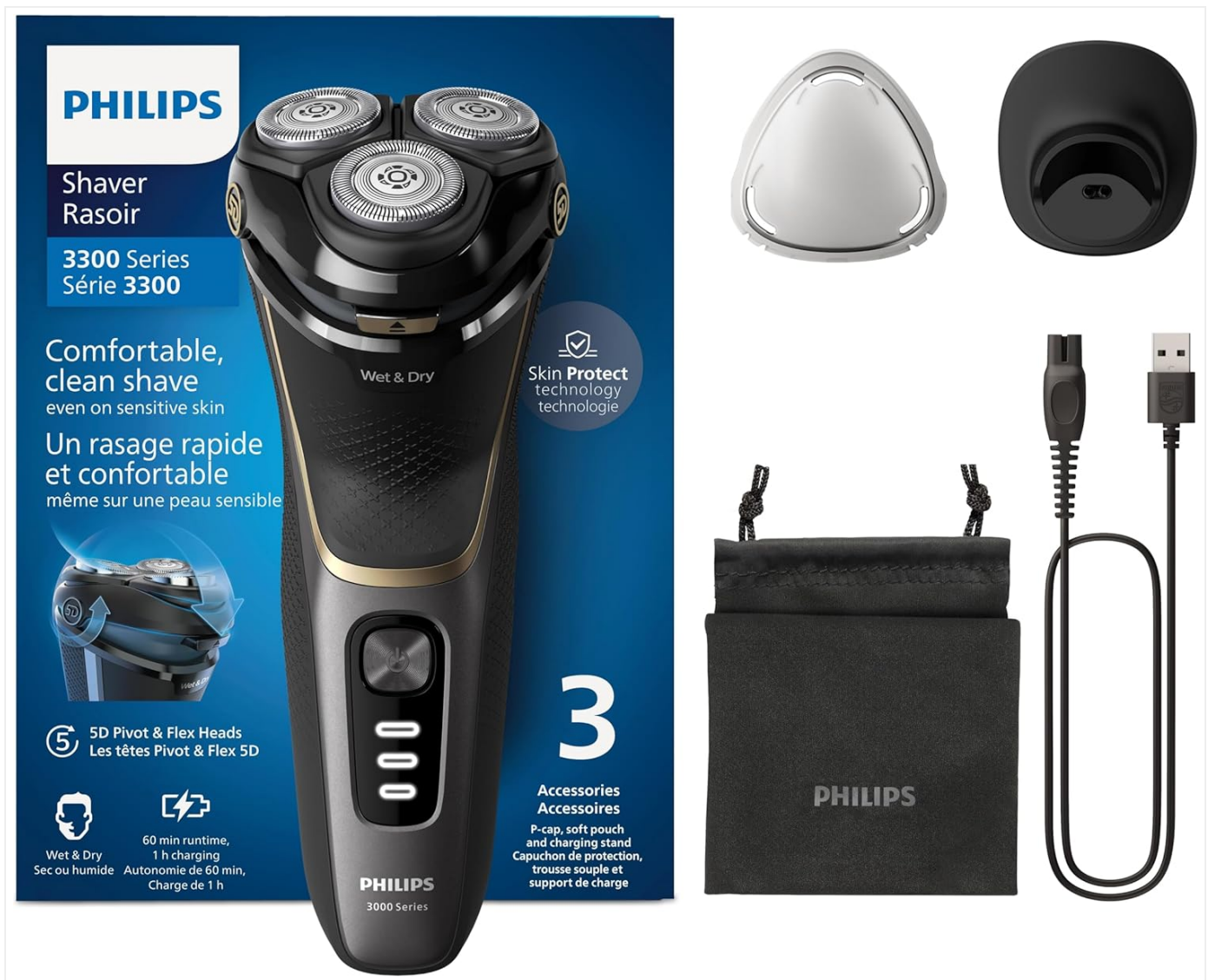
Image: Philips Electric Shaver Series 3000 (S3342/13) with included accessories.