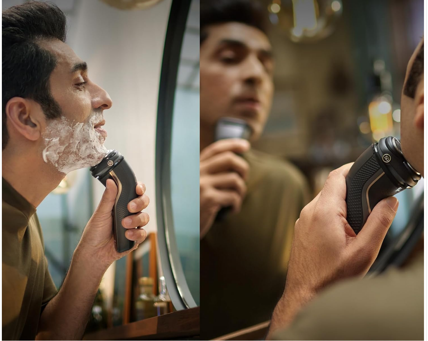
Image: Demonstrating wet and dry shaving with the Philips Shaver Series 3000.

Shave wet or dry, with foam, gel or even in the shower