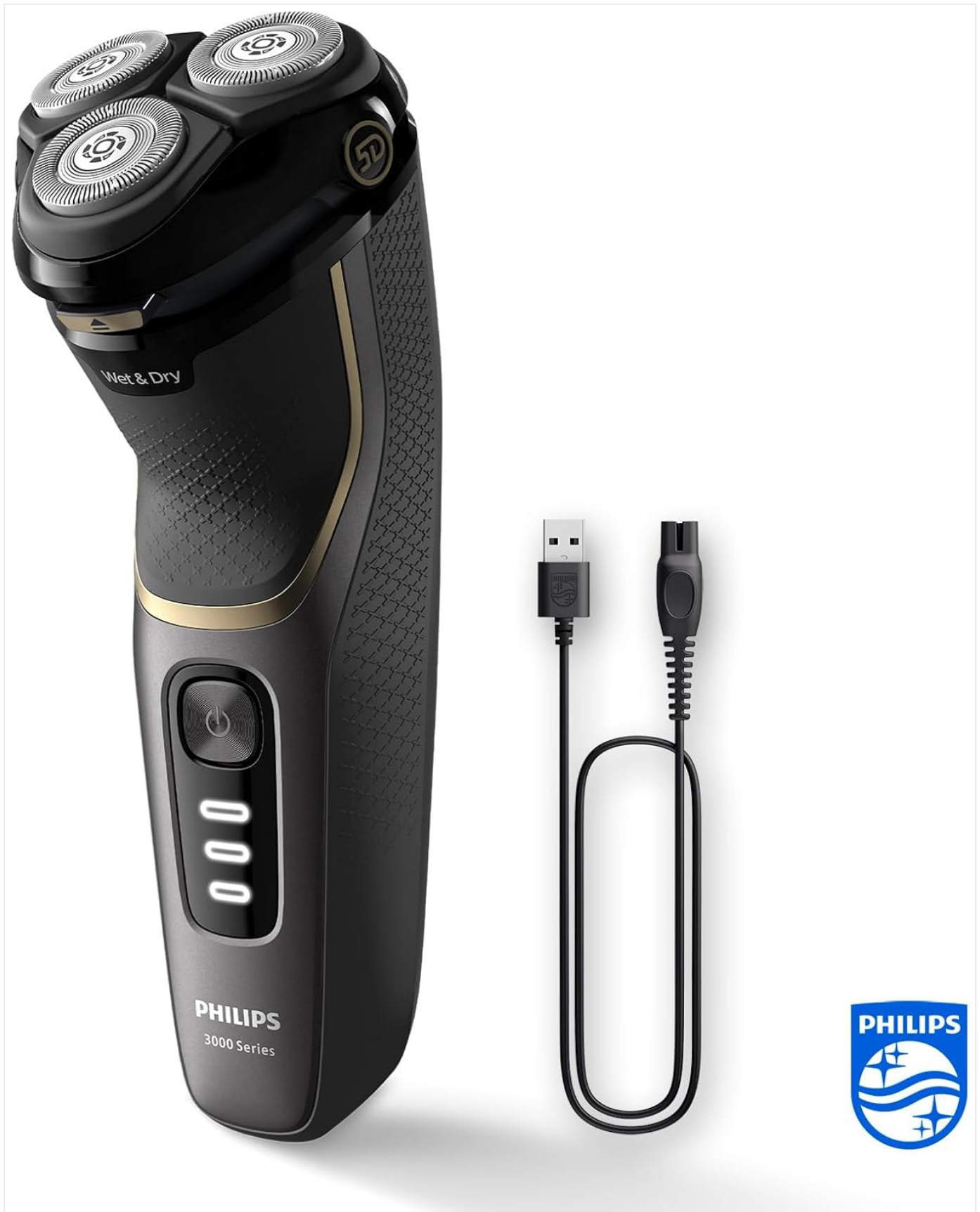
Image: Shaver with USB charging cable.