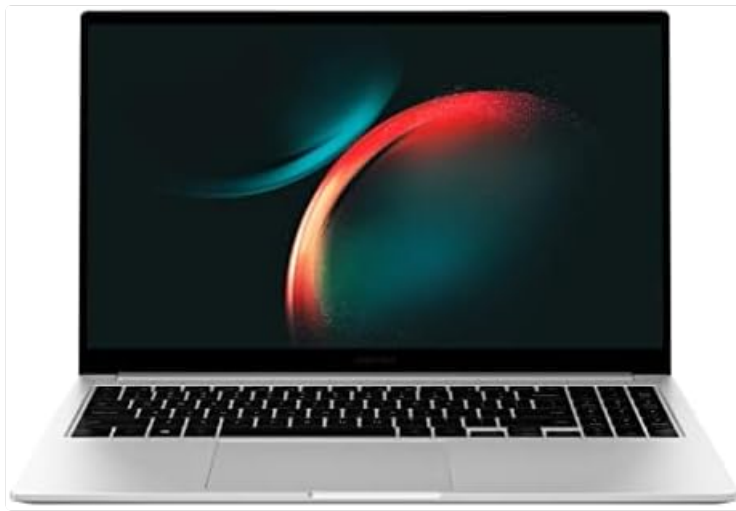
Figure 1: Front view of the SAMSUNG Galaxy Book3 Business Laptop. The laptop is silver with a black screen and keyboard.