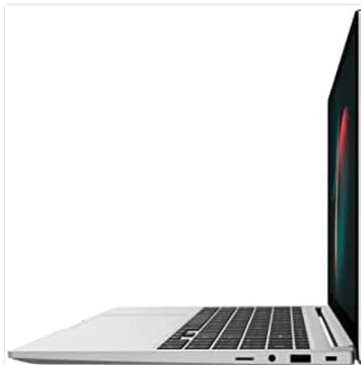
Figure 4: A closer look at the laptop's ports, including USB-C, HDMI, USB-A, microSD, and headphone jack, designed for easy connections without extra adapters.