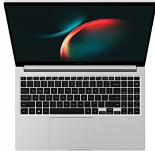
Figure 6: An illustration of the Intel Core processor, representing the powerful computing capabilities of the Galaxy Book3 Business.

Equipped with a 13th Gen Intel Core i5-1335U Processor and 16GB LPDDR4X RAM, the laptop delivers premium performance for multitasking, business applications, and general computing needs. The 256GB SSD provides fast boot times and quick application loading.