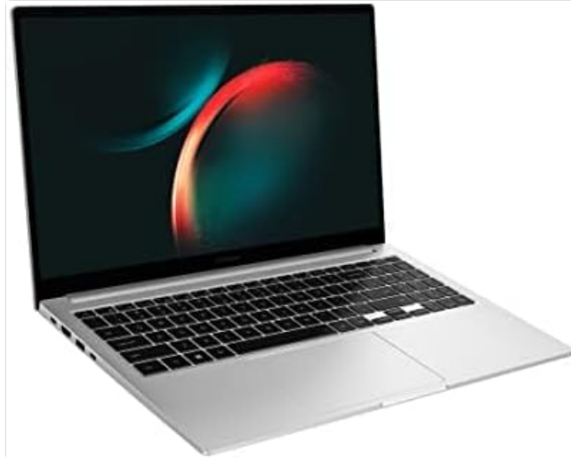
Figure 5: The laptop screen showcasing its vibrant display quality, ideal for detailed work and immersive viewing.

Your Galaxy Book3 Business features a 15.6-inch Full-HD (1920 x 1080 pixels) display, offering crisp, bright, and beautiful visuals. The integrated Intel Iris Xe Graphics ensures smooth performance for everyday tasks and multimedia consumption.