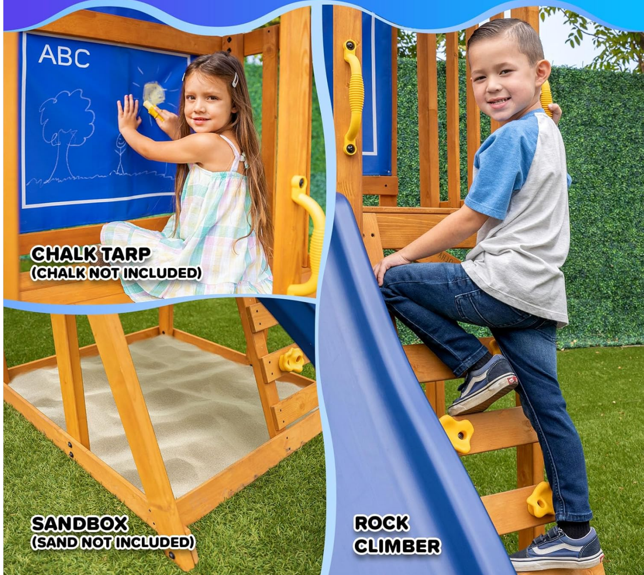
Figure 5: Play Fort Features. The play fort includes a chalk tarp (chalk not included), a rock climber, and a sandbox (sand not included) for varied play activities.