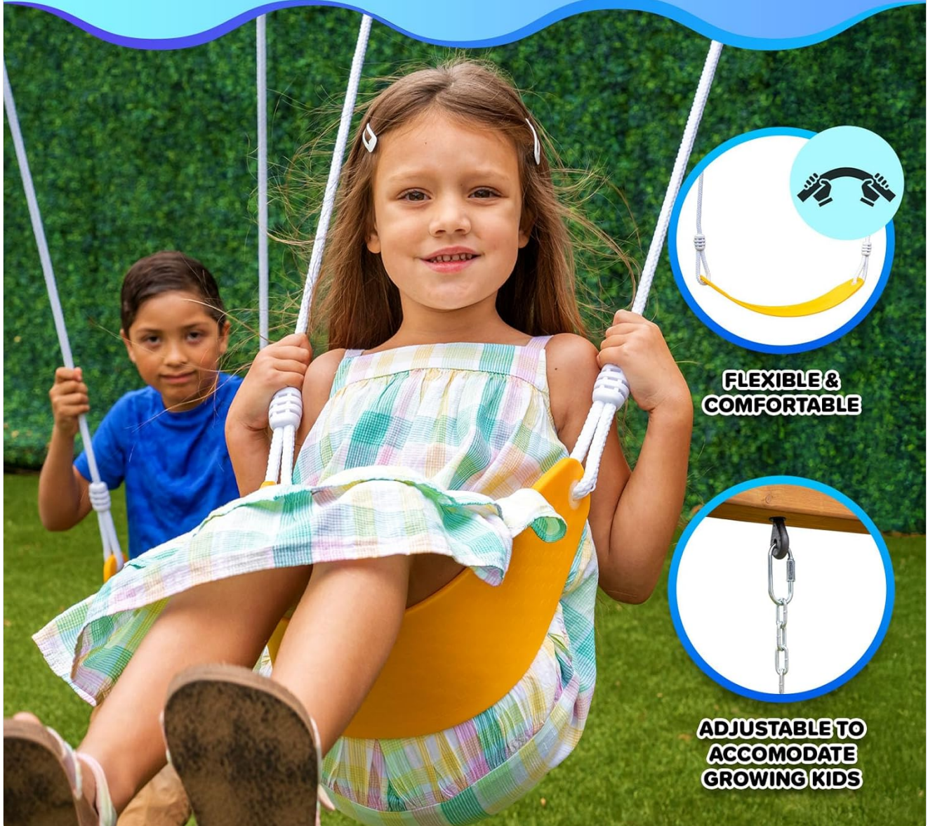
Figure 4: Adjustable Sling Swings. The swing set includes two flexible and comfortable sling swings with adjustable height chains to accommodate growing children.