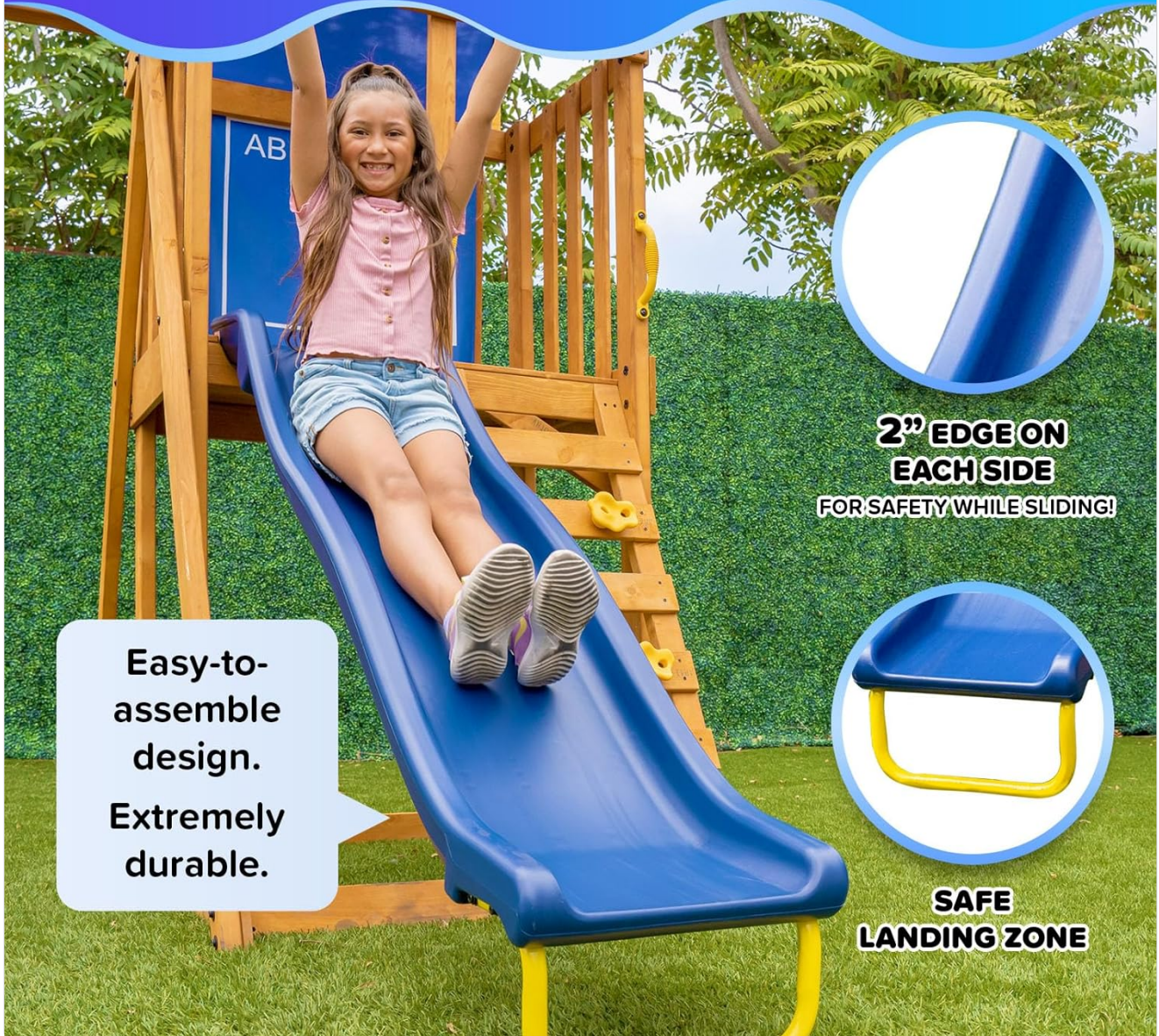
Figure 3: Using the Double-Wall Slide. The slide features a safe landing zone and a 2-inch edge on each side for enhanced safety during use.