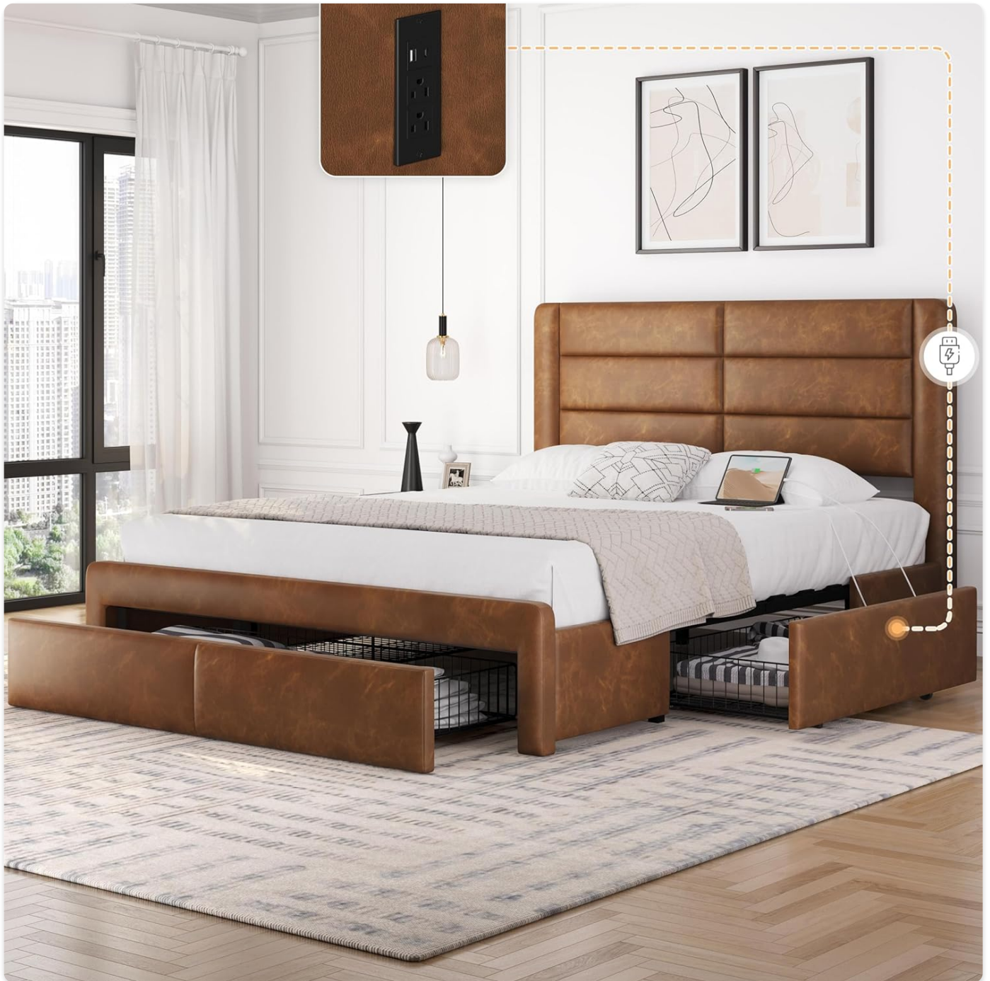
Figure 1: Yaheetech Queen Bed Frame - Amber Brown