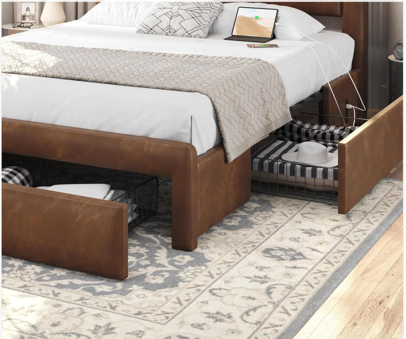
Figure 6: Three-Drawer Storage Design for ample space.

Provide ample space for your bedding, clothing, and more.