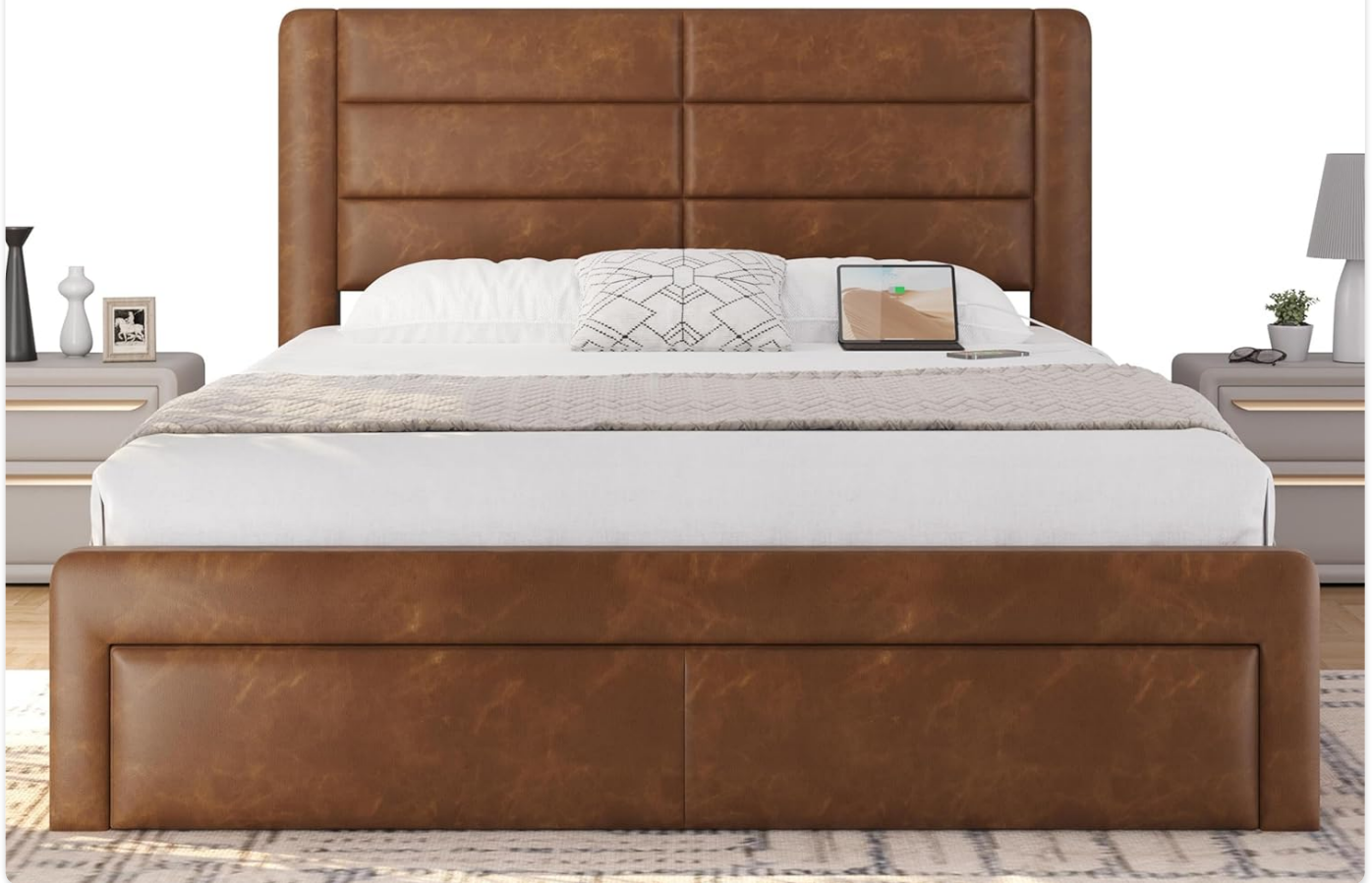
Figure 9: The PU leather fabric is easy to clean and maintain.