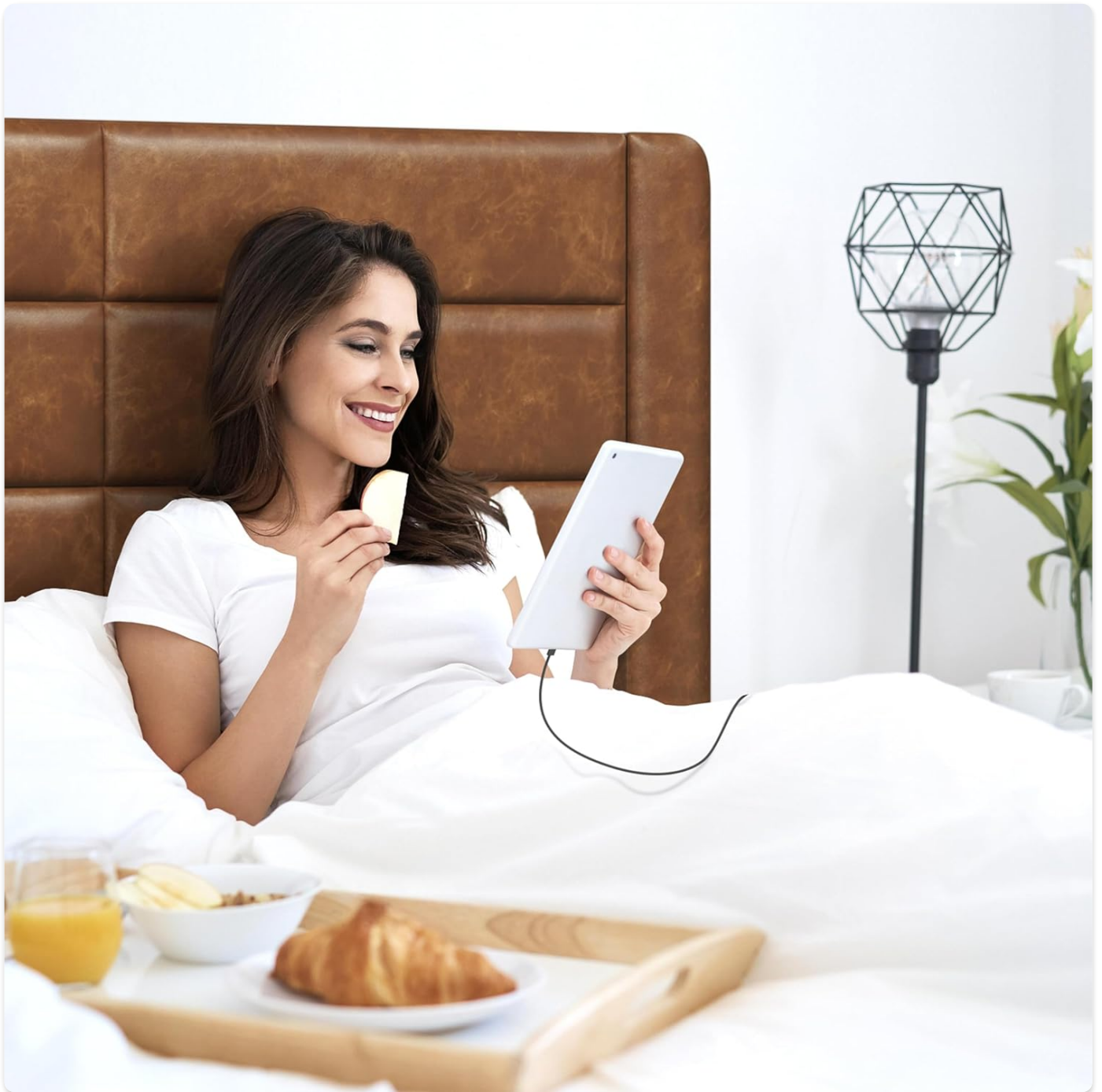
Figure 5: Enjoying charged devices from the comfort of your bed.