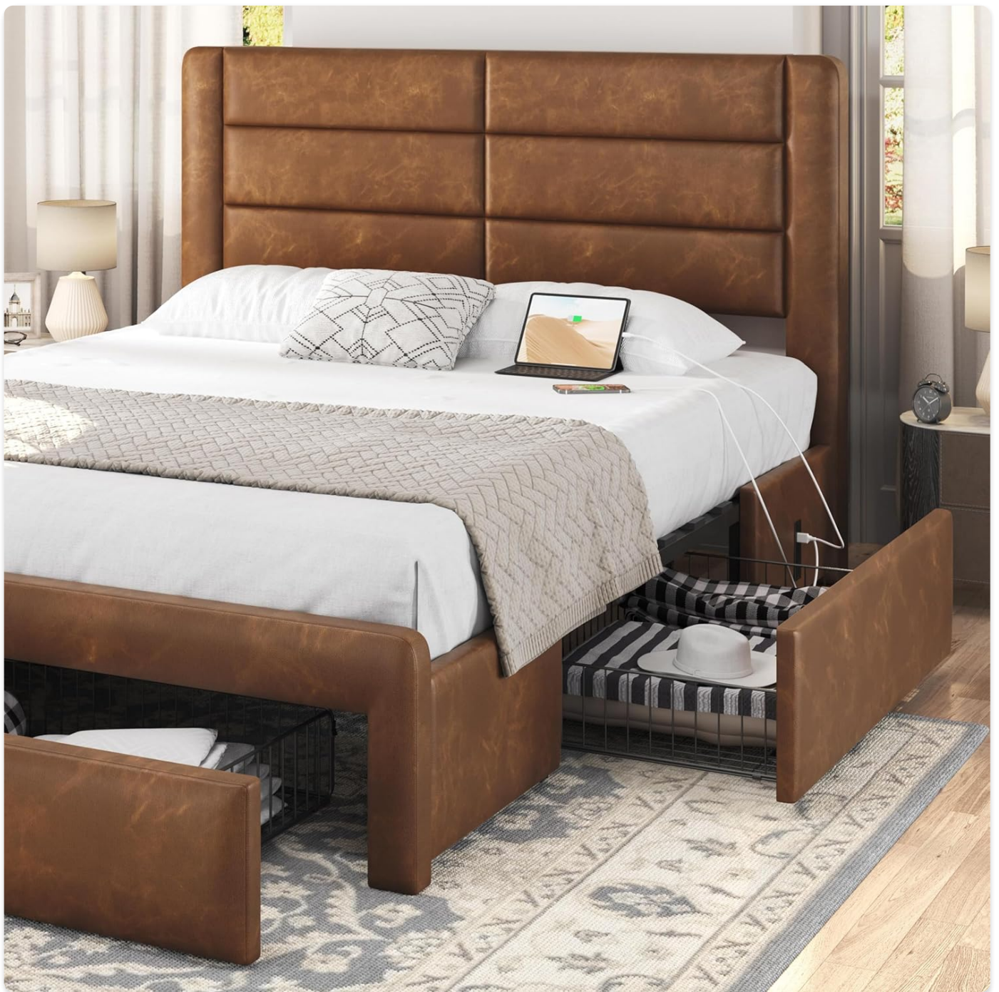
Figure 7: Drawers are easily accessible and provide convenient storage.