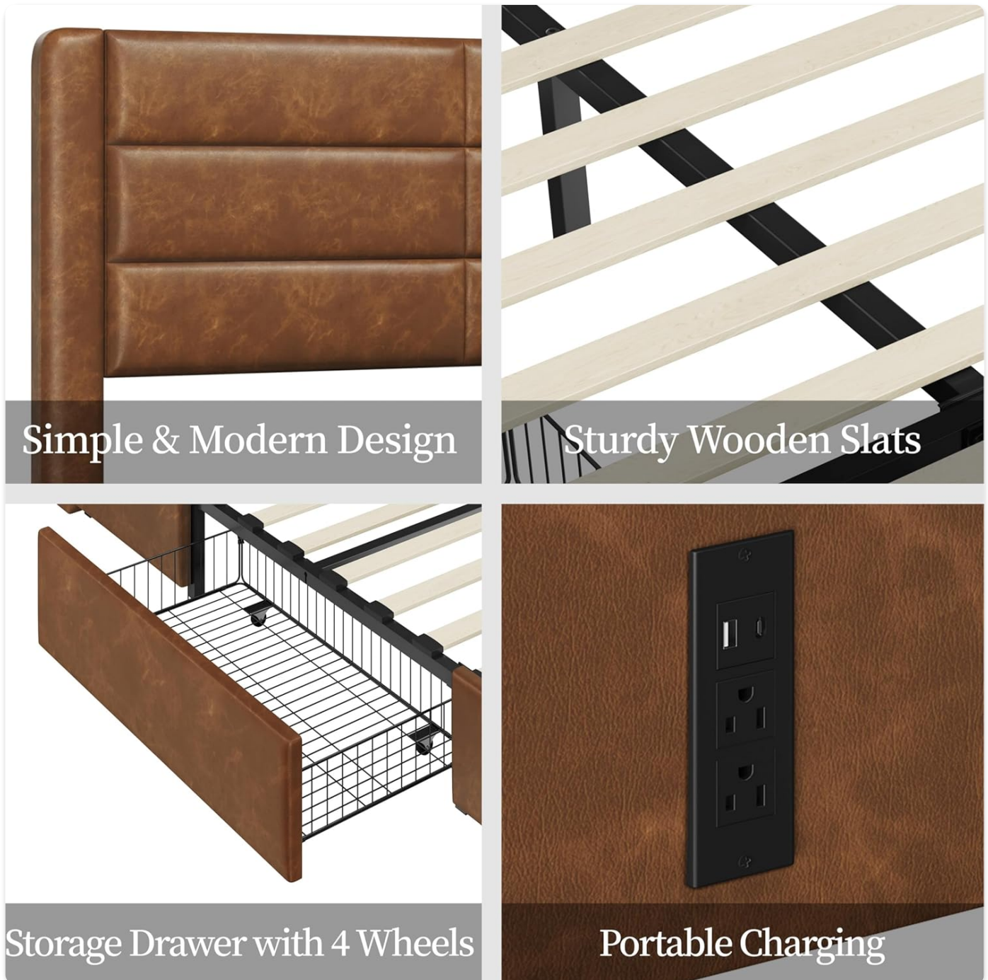
Figure 2: Key components of the bed frame.