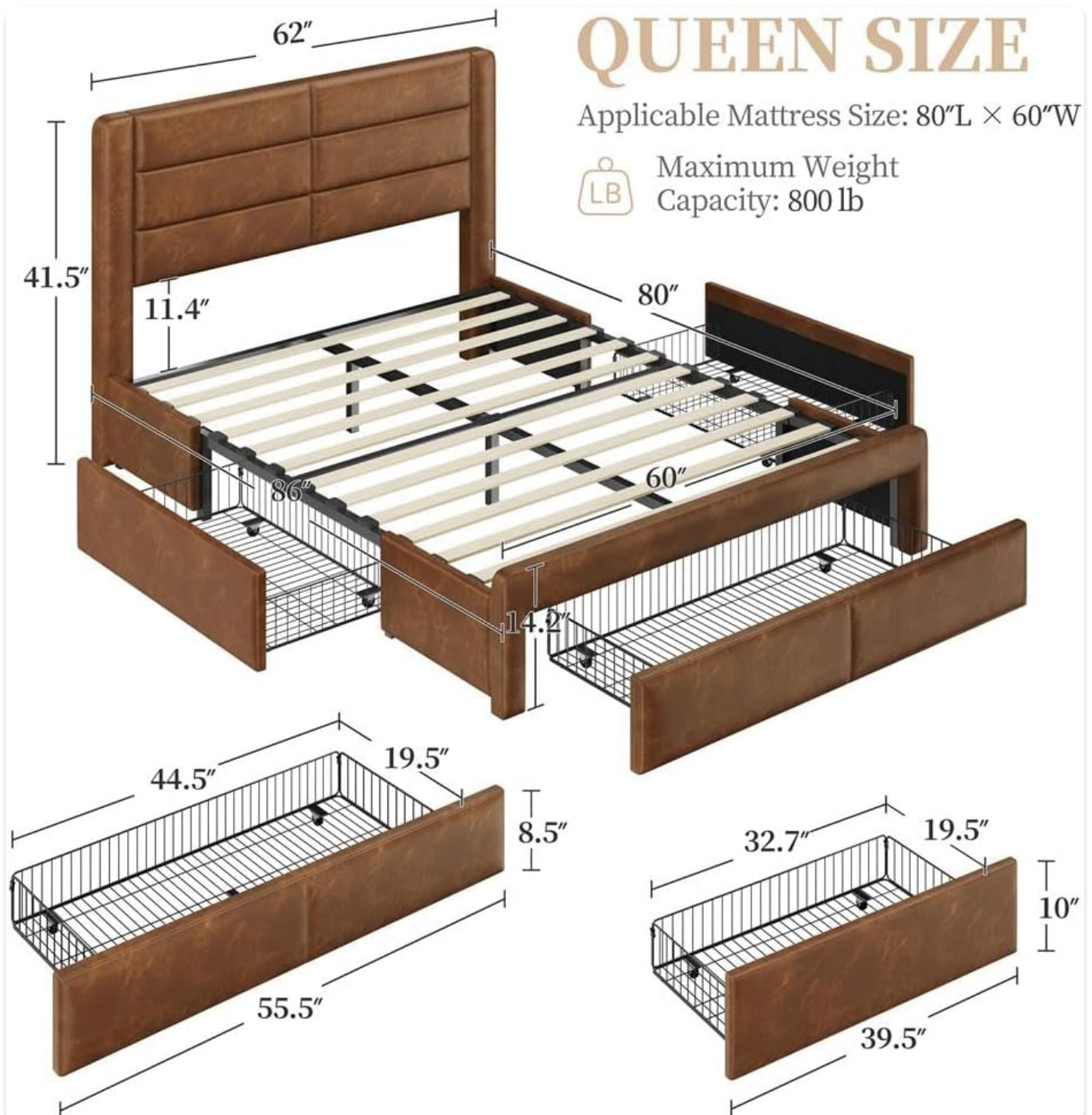
Figure 3: Queen Size Dimensions and Maximum Weight Capacity (800 lb).