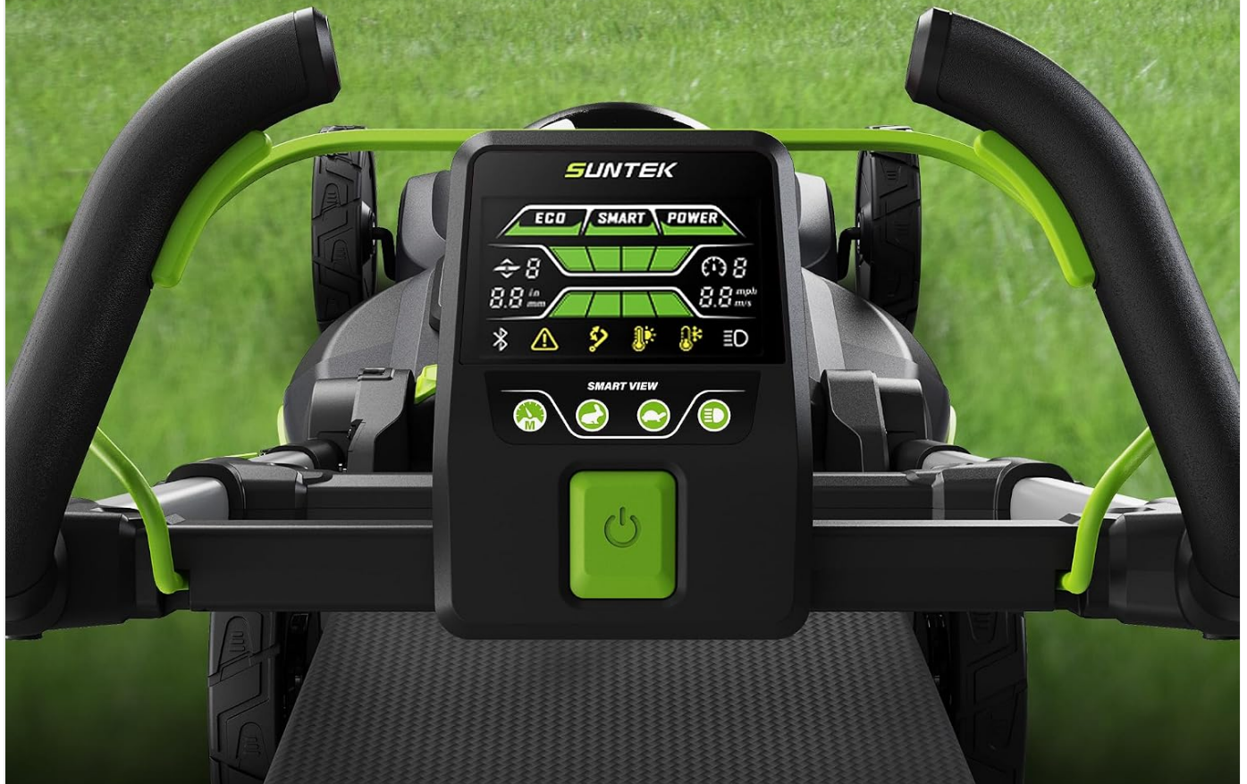
Figure 4: The SmartView display provides real-time operational information.