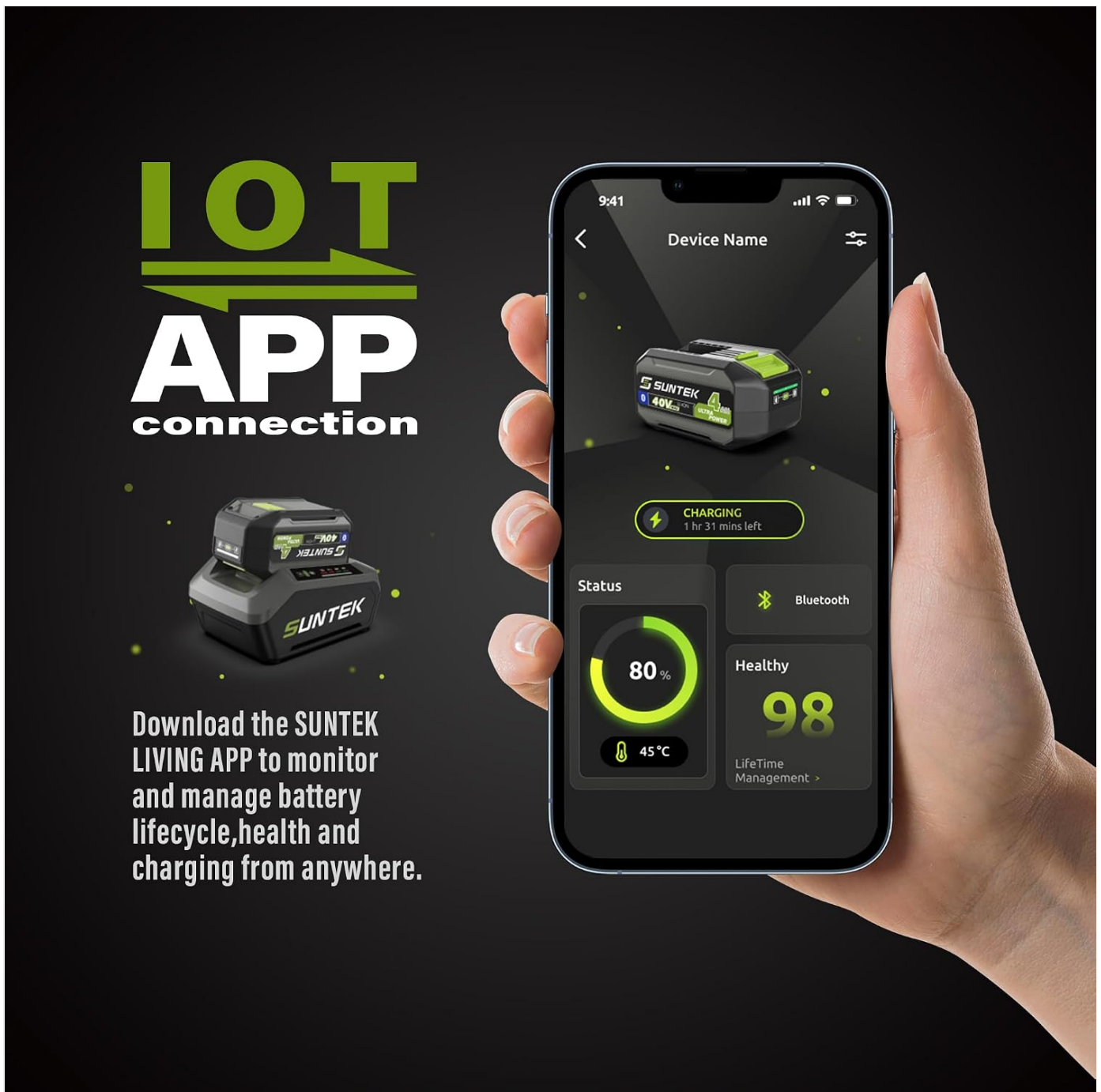
Figure 5: Monitor and manage your battery with the SUNTEK LIVING app.