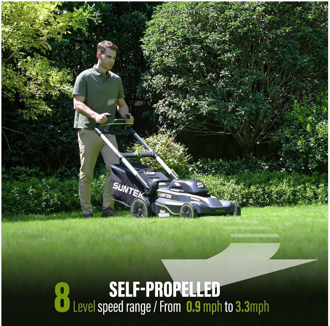
Figure 1: SUNTEK 40V 21-Inch Cordless Electric Self-Propelled Lawn Mower.