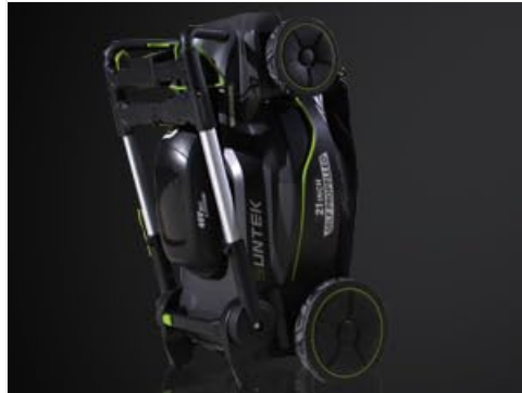
Figure 6: The mower features a compact and safe storage design.

For compact storage, fold the handle down. The grass bag can be used to cover the exposed blade for safety. Store the mower in a dry, secure location away from children and pets. Remove batteries before long-term storage.