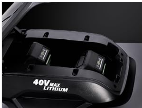
Figure 2: Dual battery ports with auto-switch technology for extended runtime.

Open the battery compartment cover. Insert two fully charged 40V 4.0Ah lithium-ion batteries into the dual battery ports. The mower features automatic switchover functionality between batteries.