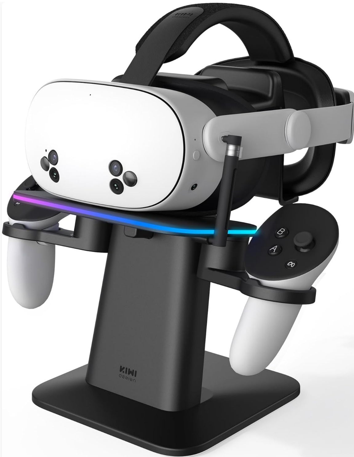
Figure 1: KIWI design Charging Dock with a Meta Quest headset and controllers.