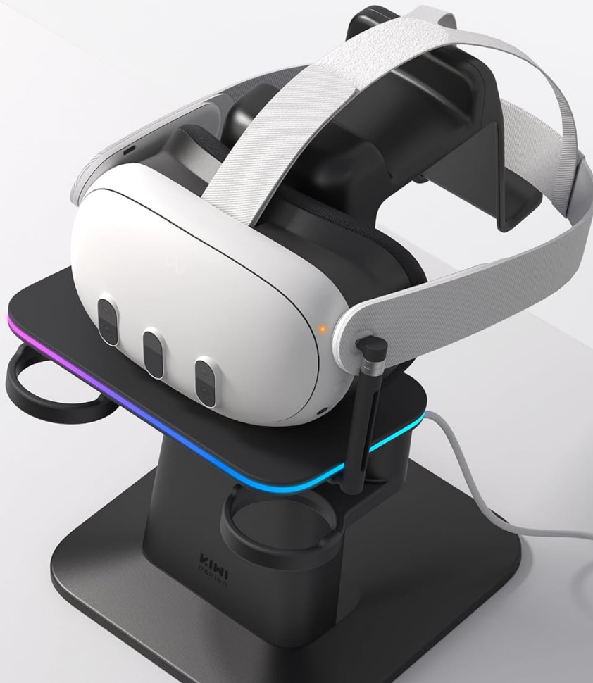
Figure 2: Effortless magnetic charging of the Meta Quest headset.