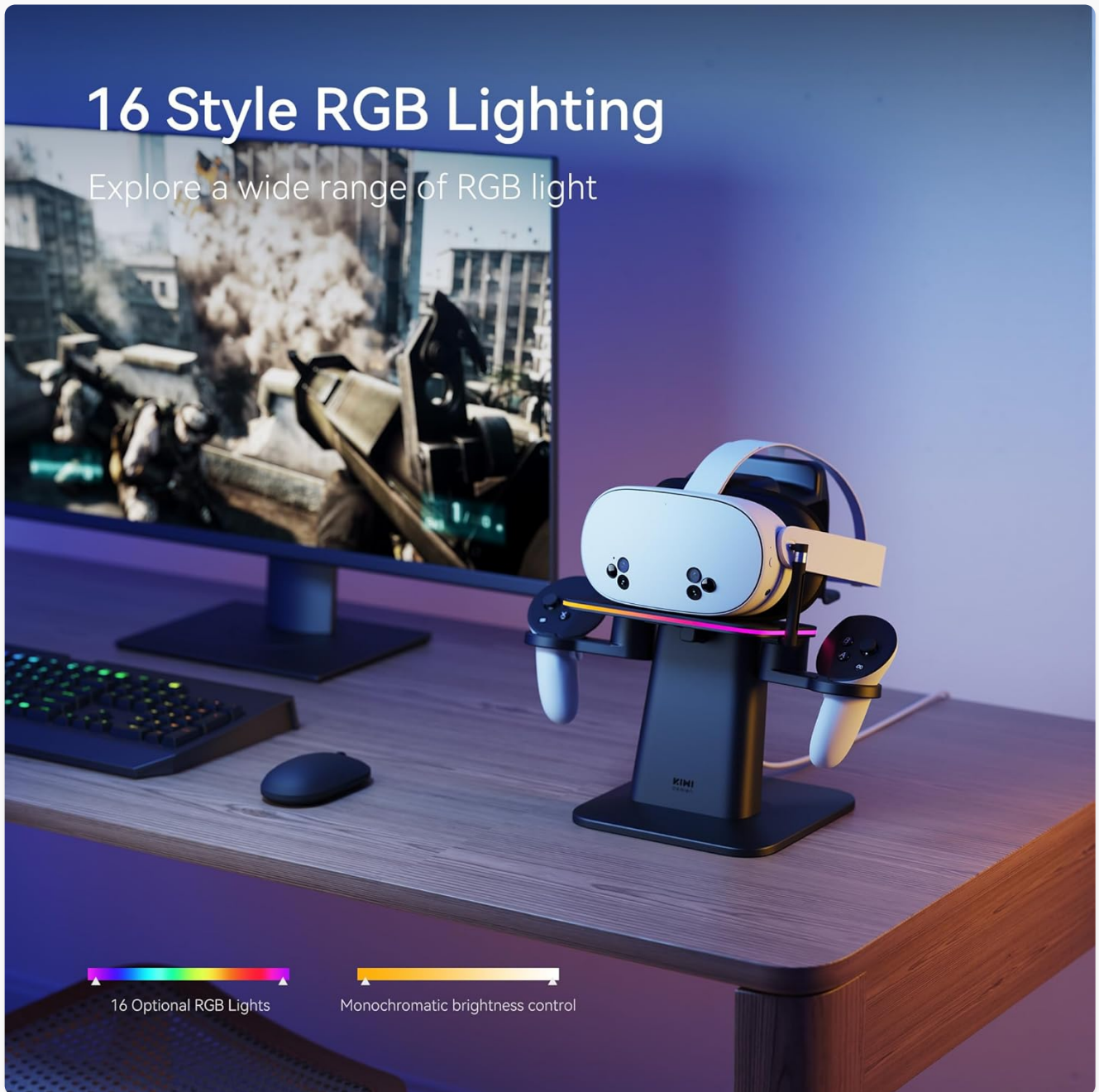
Figure 3: Customize your setup with 16 RGB lighting options.