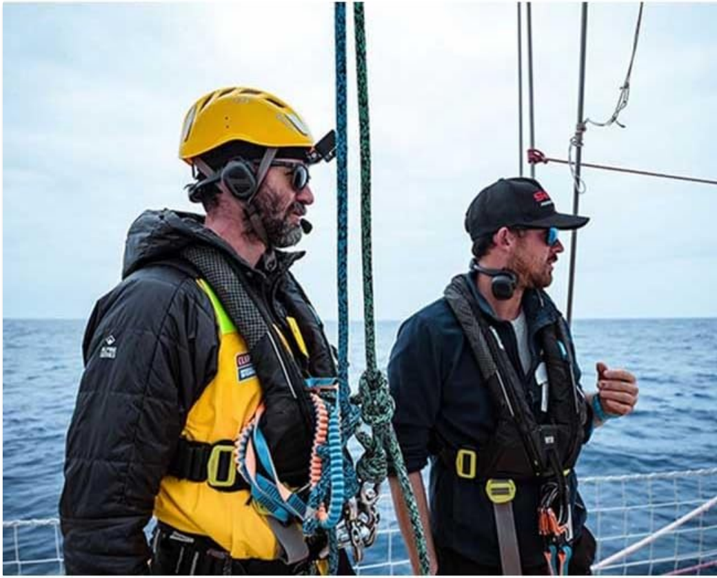
Figure 2: Sena Nautitalk Bosun components including the headset, pouch, and accessories.