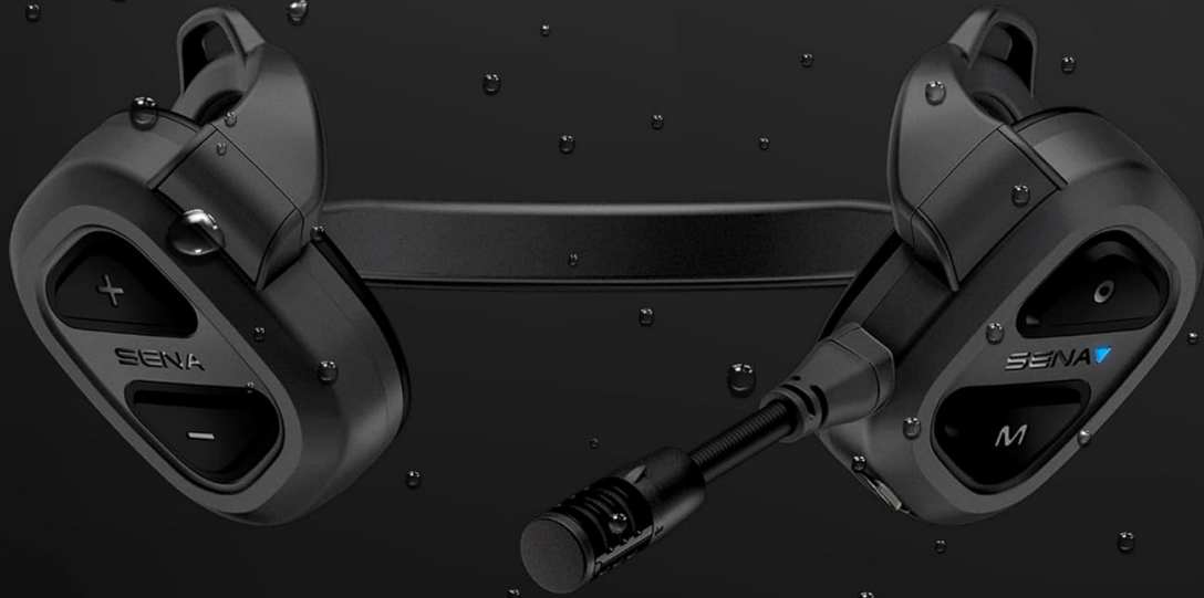
Figure 4: The headset is designed to be waterproof, protecting it from splashes and submersion.