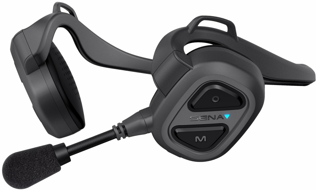
Figure 1: Sena Nautitalk Bosun Headset