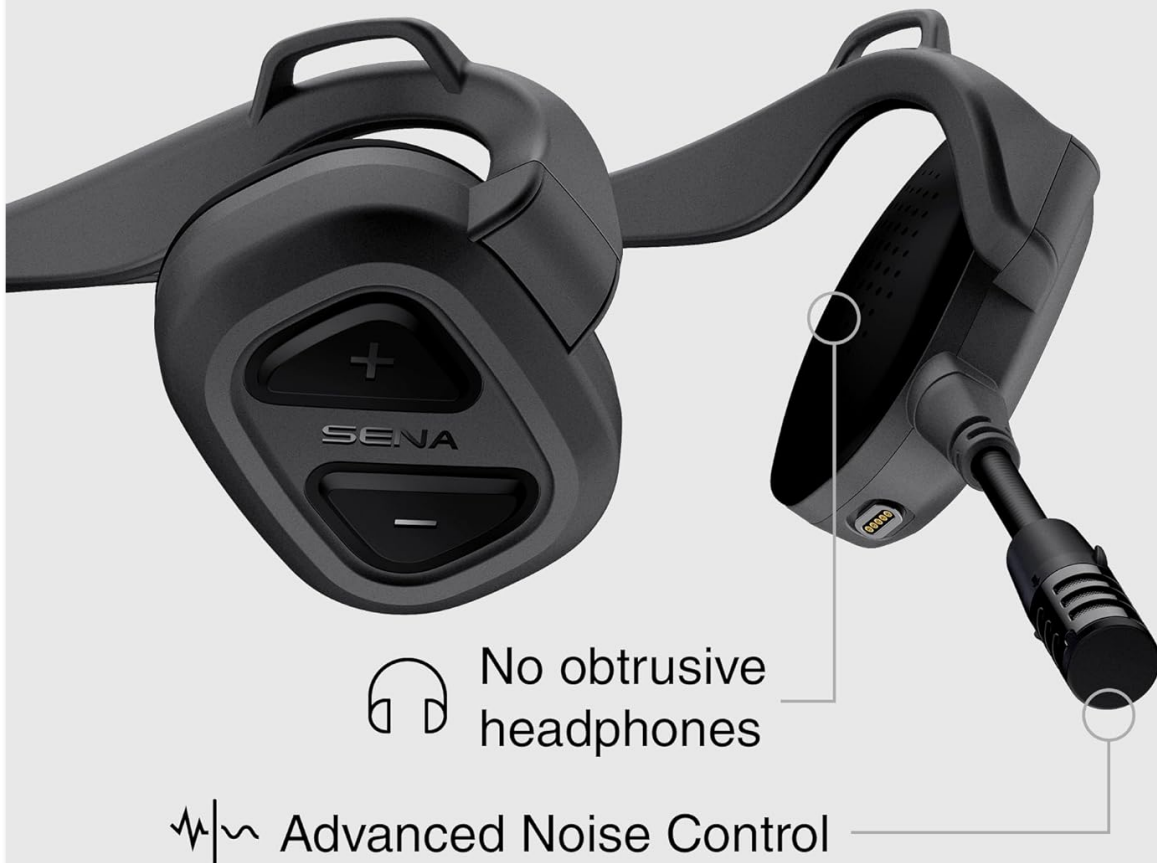
Figure 6: Built-in speakers and microphone with advanced noise control for clear audio.