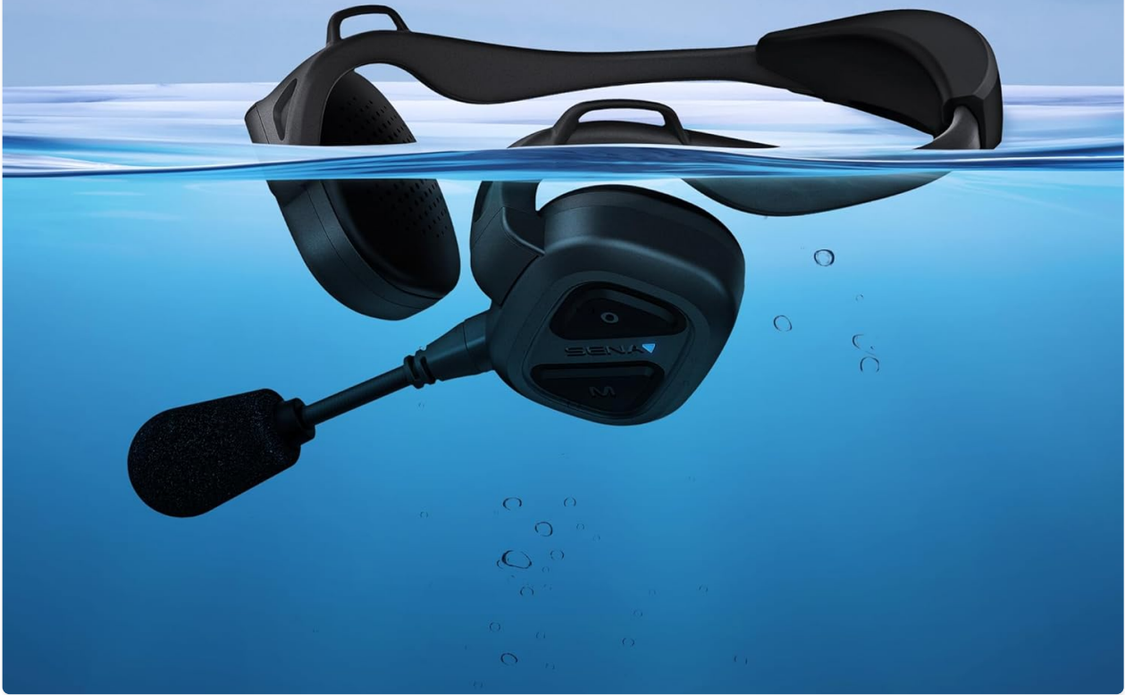
Figure 5: The headset's floating capability ensures it stays on the surface if dropped in water.