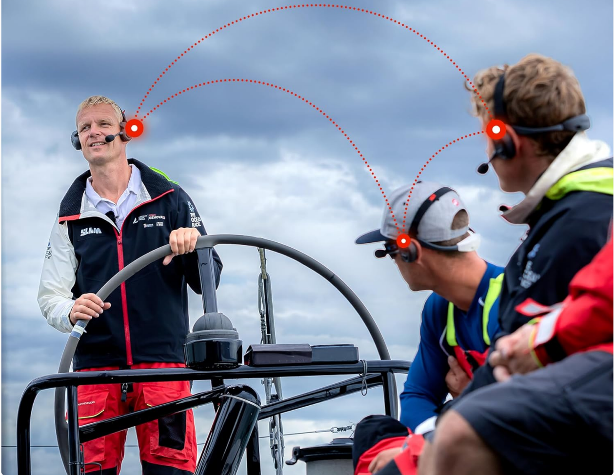
Figure 3: Crew members communicating effortlessly using Sena Nautitalk Bosun headsets via Mesh Intercom.