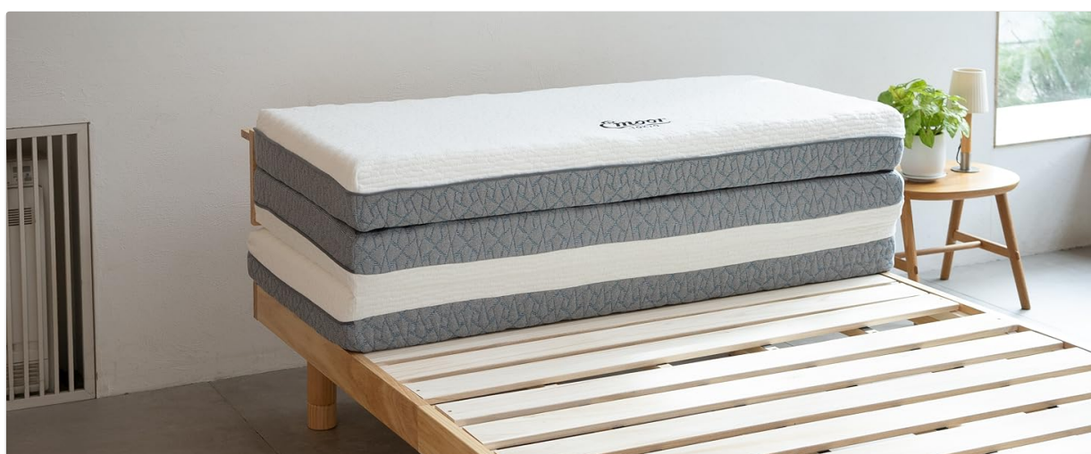
Image: The EMOOR Futon Mattress folded and stored vertically, illustrating its compact storage capability.

Image: A person demonstrating the removal of the outer cover of the EMOOR Futon Mattress using its L-shaped zipper, highlighting the ease of maintenance.