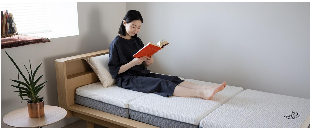
Image: A person reading while sitting on the EMOOR Futon Mattress, which is partially folded to provide back support, showcasing its versatility for lounging.