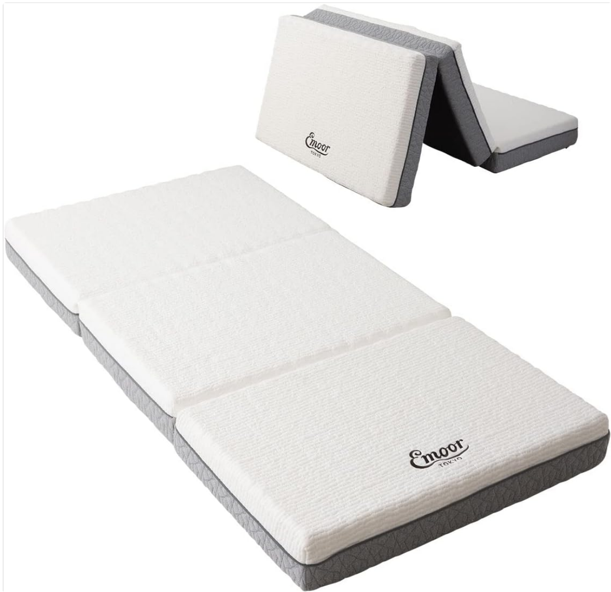
Image: The EMOOR Japanese Futon Mattress shown in both its fully unfolded state and folded for storage. This illustrates the product's primary configuration and its compact storage capability.