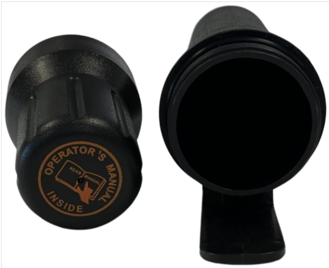
Figure 6: The canister with its cap removed, illustrating the opening for content storage.