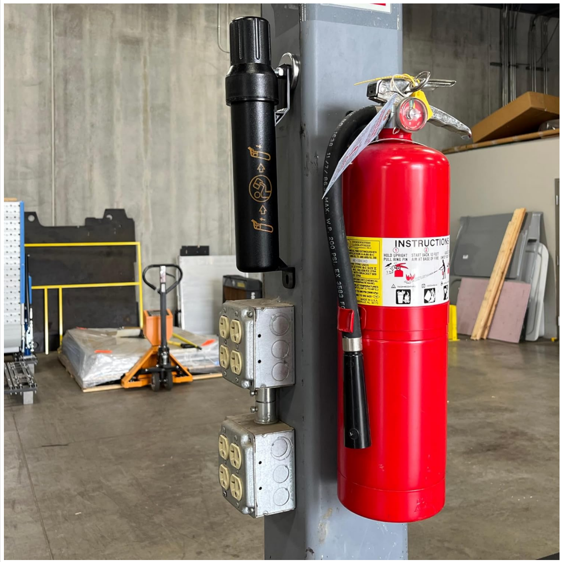
Figure 4: The canister mounted on a stationary pillar, illustrating its versatility for various applications beyond vehicles.