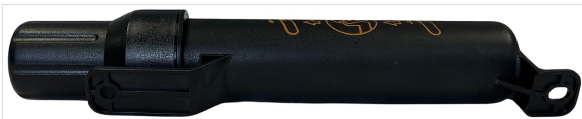
Figure 2: Side view of the canister, highlighting the integrated mounting brackets for secure attachment.