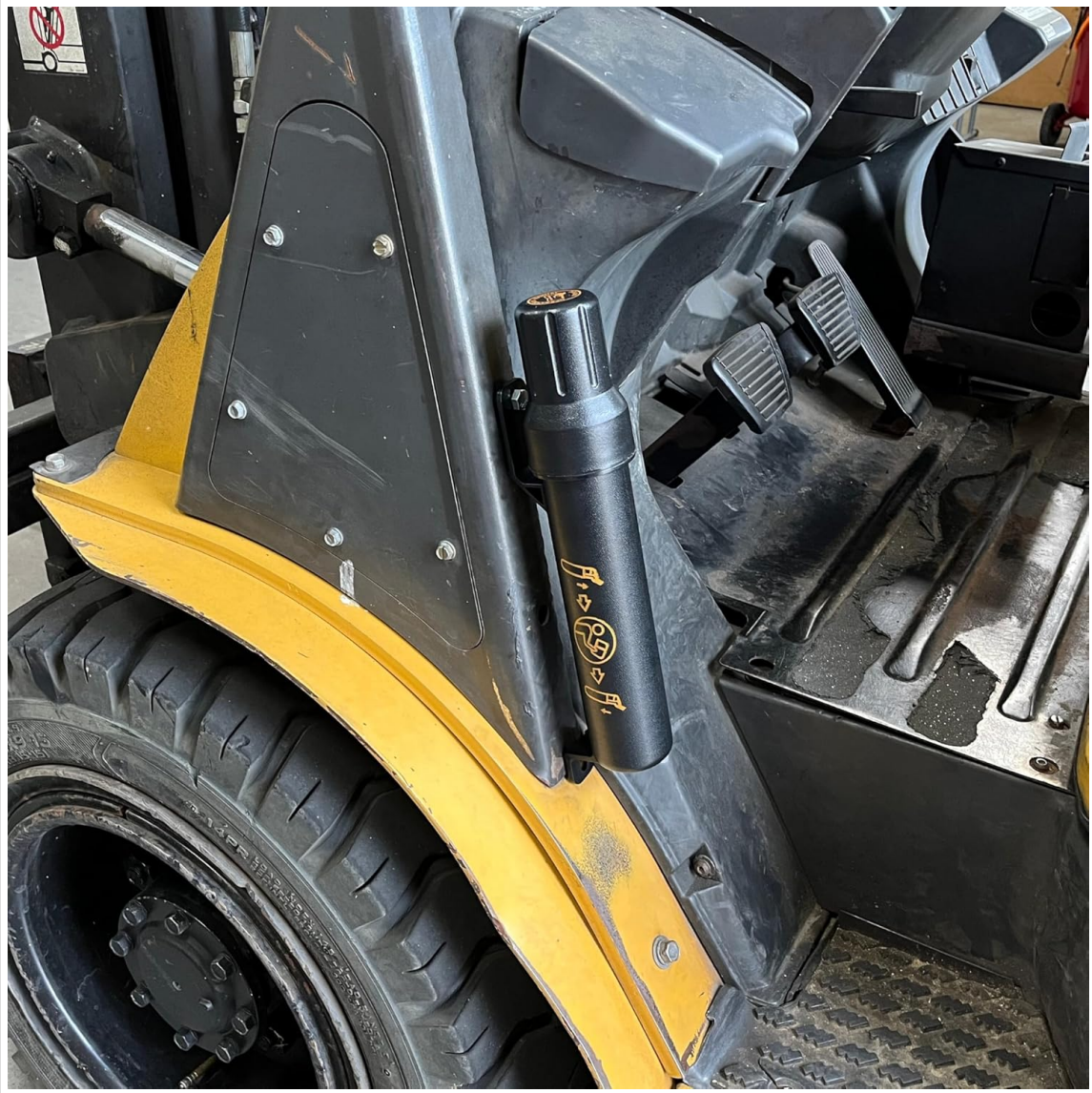
Figure 3: Example of the canister securely mounted on a forklift, demonstrating a typical installation scenario.