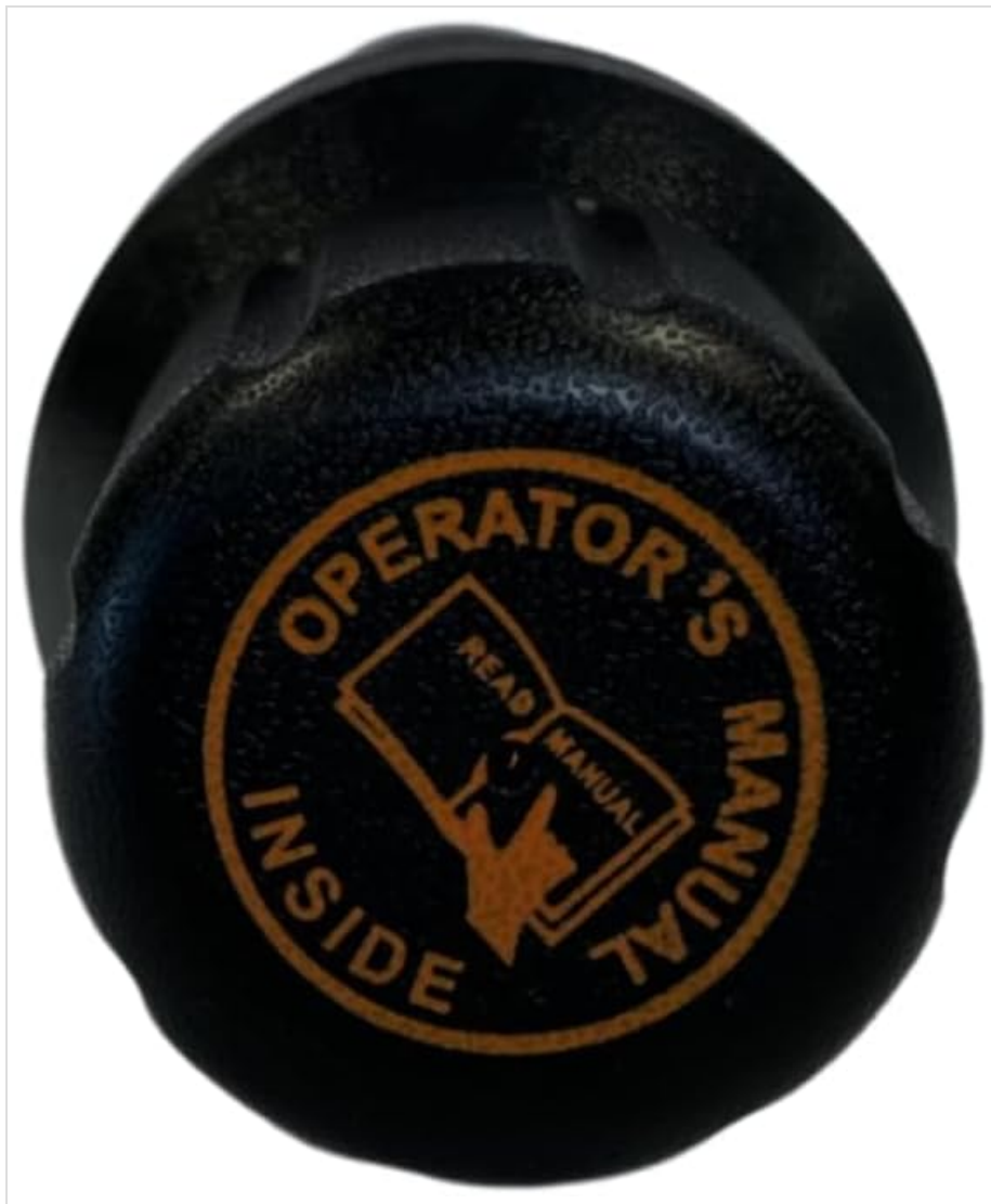
Figure 7: A close-up view of the cap, featuring the "OPERATOR'S MANUAL INSIDE" text and a visual cue for opening.