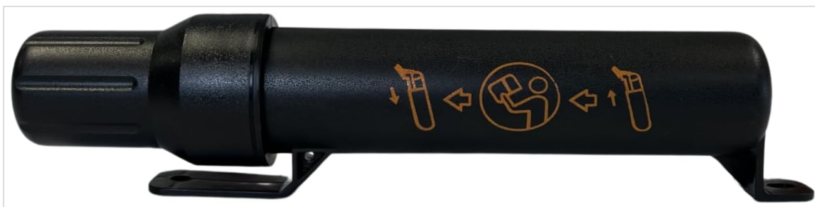
Figure 1: The Generic 1002IMPR Operators Manual Canister, shown in black with orange instructional symbols.

The Generic 1002IMPR is an injection-molded polyethylene canister engineered for durability and versatility. It offers reliable protection against UV rays, rust, corrosion, chemicals, salt, and road spray, making it suitable for outdoor use on motorcycles, ATVs, tractors, and trailers. Its compact design (12.5" x 2.2" x 3") makes it ideal for storing operator manuals, insurance and registration documents, small tools, or even a fuel bottle.