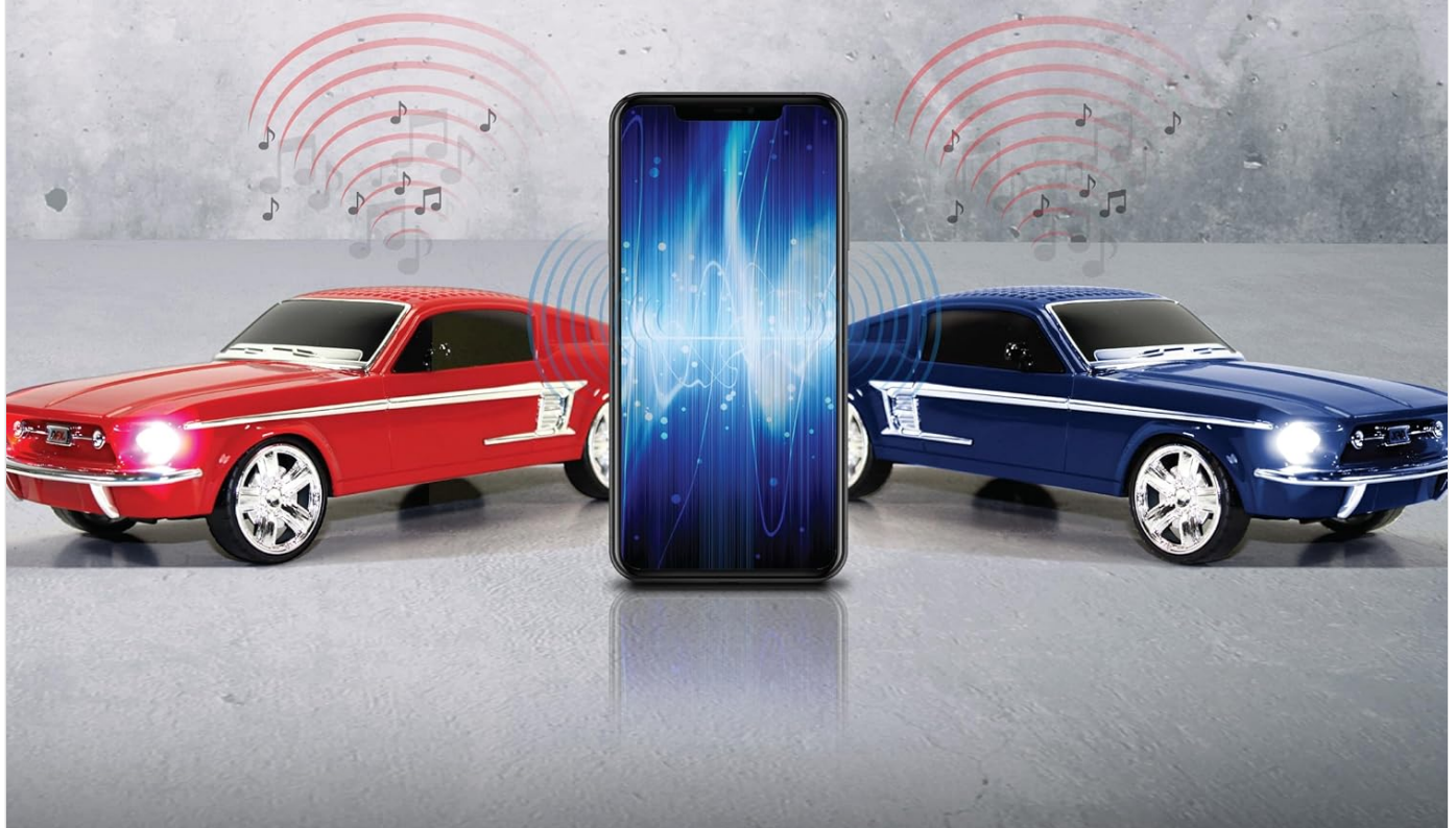
Figure 5: True Wireless Stereo (TWS) pairing for enhanced sound.