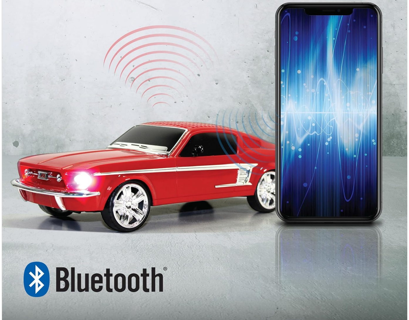
Figure 4: Hands-free calling feature.