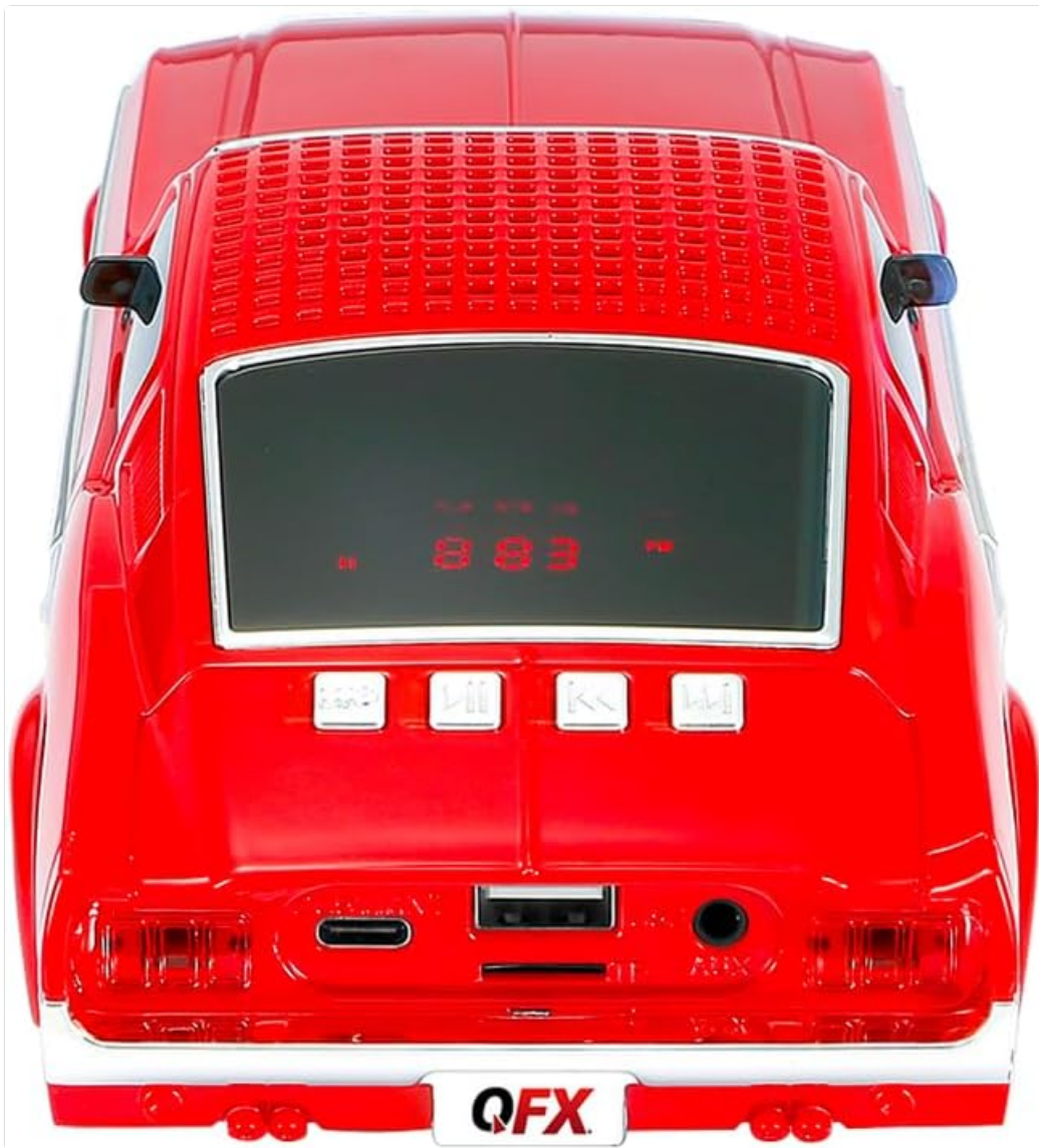
Figure 3: Rear panel controls and ports.