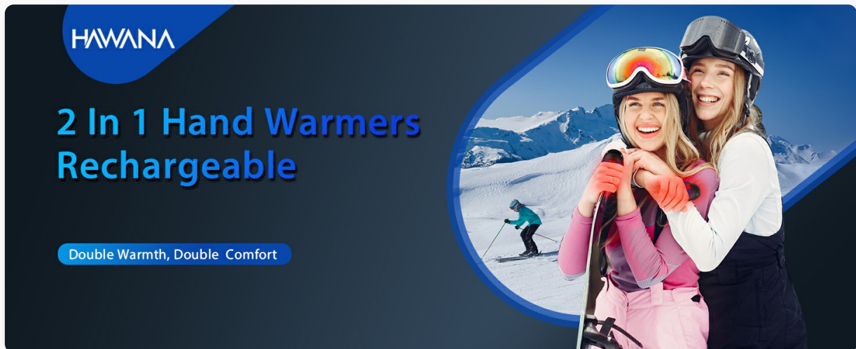
Image: HAWANA 2-in-1 Rechargeable Hand Warmers highlighting key features like rapid heating and portable design.

Thank you for choosing the HAWANA Rechargeable Hand Warmers. This 2-pack of portable electric hand warmers is designed to provide warmth and comfort in cold conditions, making them ideal for various outdoor activities or simply for keeping your hands warm indoors. Featuring a unique 2-in-1 separable design, multiple heating levels, and advanced safety features, these hand warmers are built for convenience and reliability.