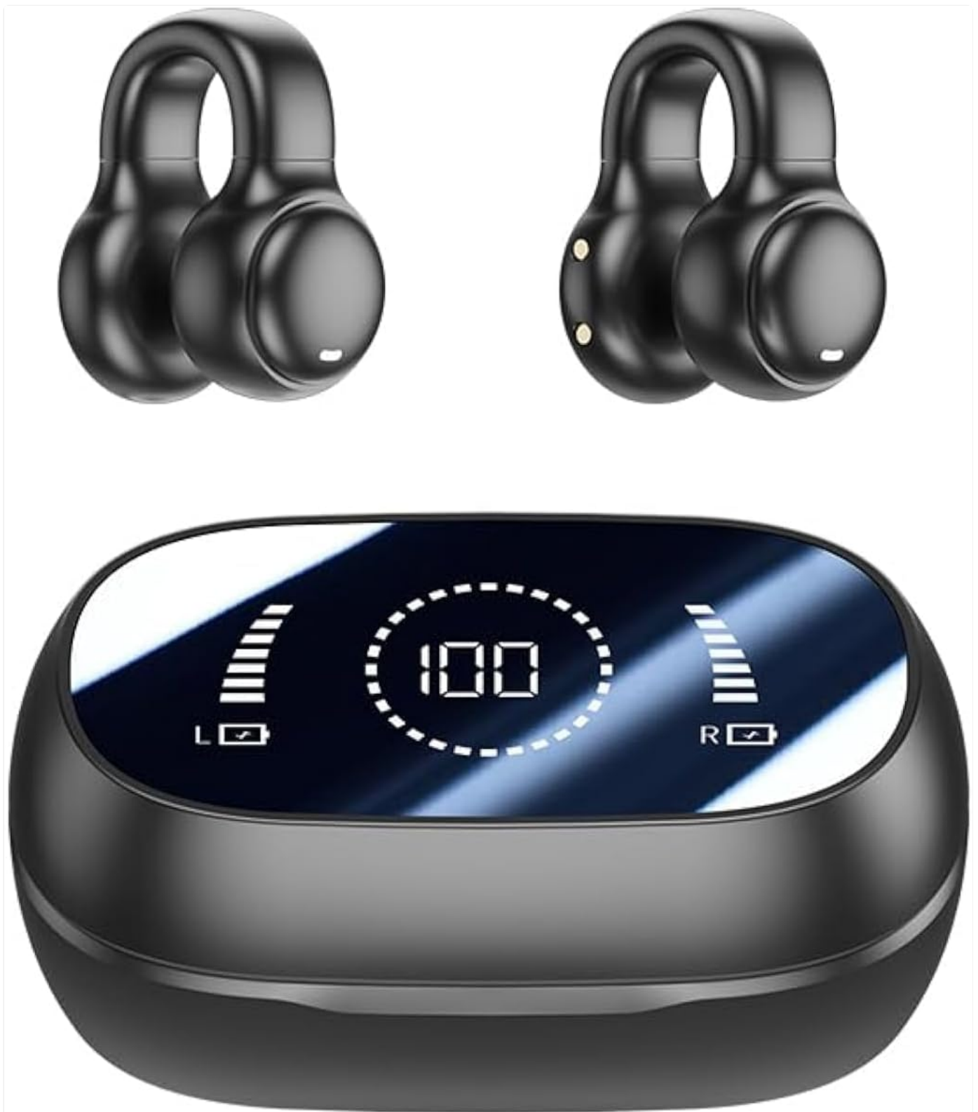
Image: The NUMGMT Wireless Bluetooth Open-Ear Earbuds, showing both earbuds and their charging case with an LED power display.