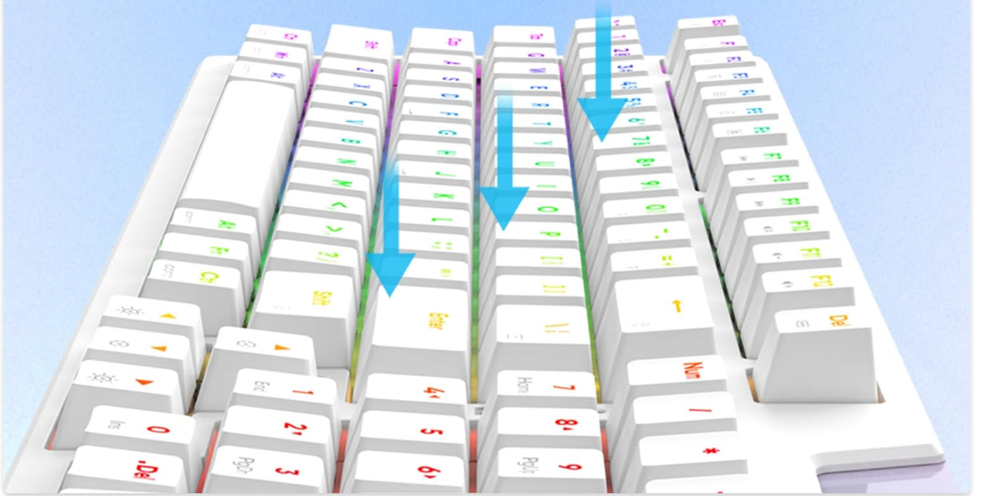
Image: An illustration highlighting the Havit Gamenote KB885L's durable mechanical switches, rated for a 50 million key press lifespan.