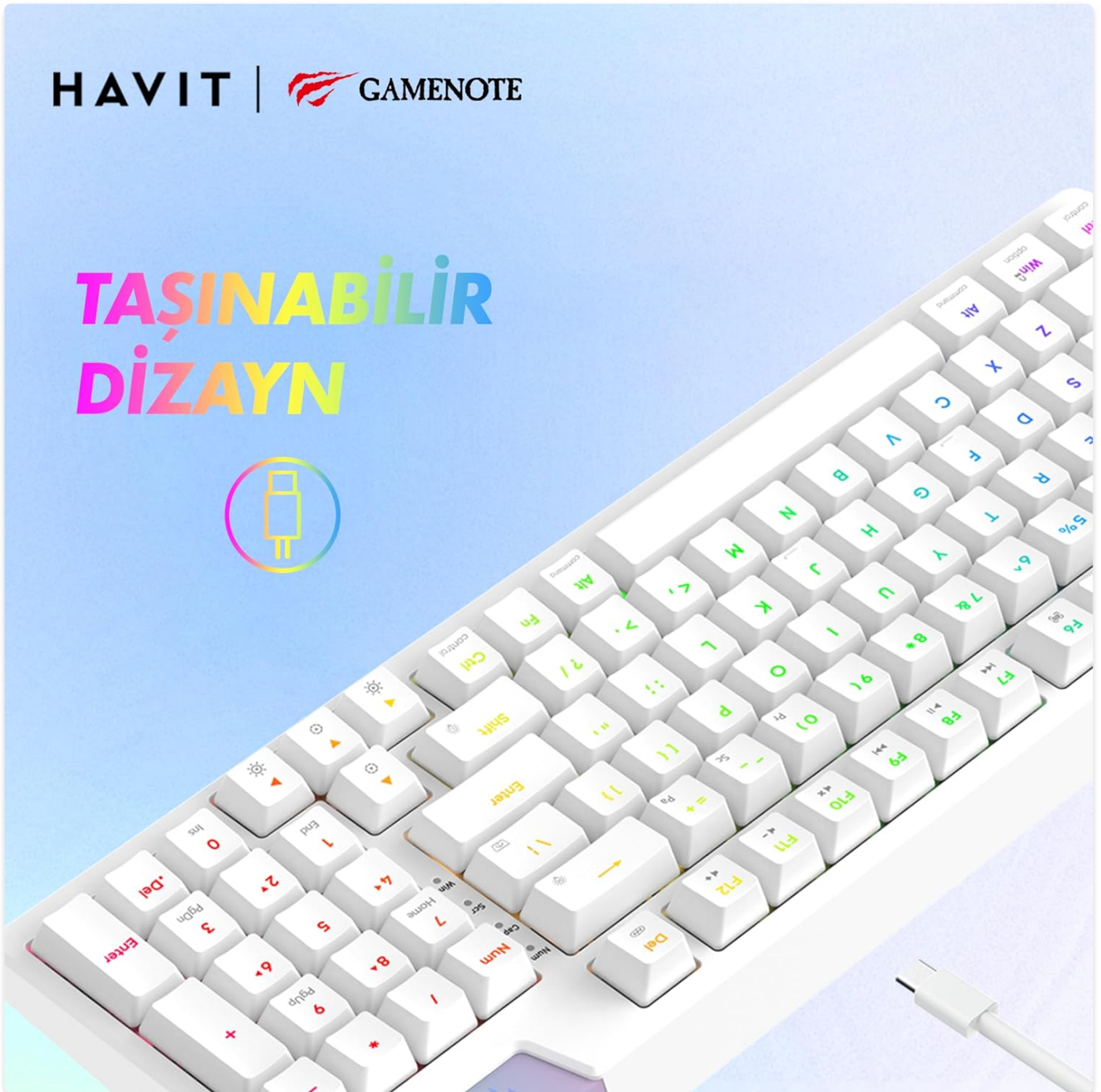
Image: A close-up of the Havit Gamenote KB885L keyboard highlighting its portable design and detachable cable for easy setup and transport.