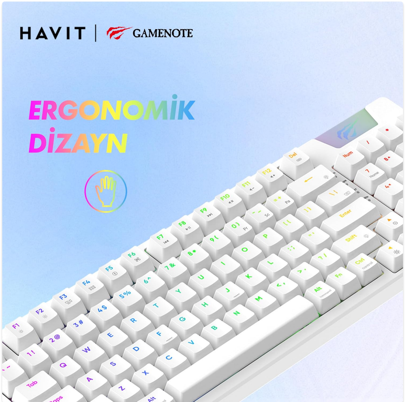
Image: A view of the Havit Gamenote KB885L keyboard highlighting its ergonomic design for comfortable use.

The keyboard is designed with ergonomics in mind to provide comfort during extended use. Its layout and keycap profile aim to reduce strain on your wrists and fingers.