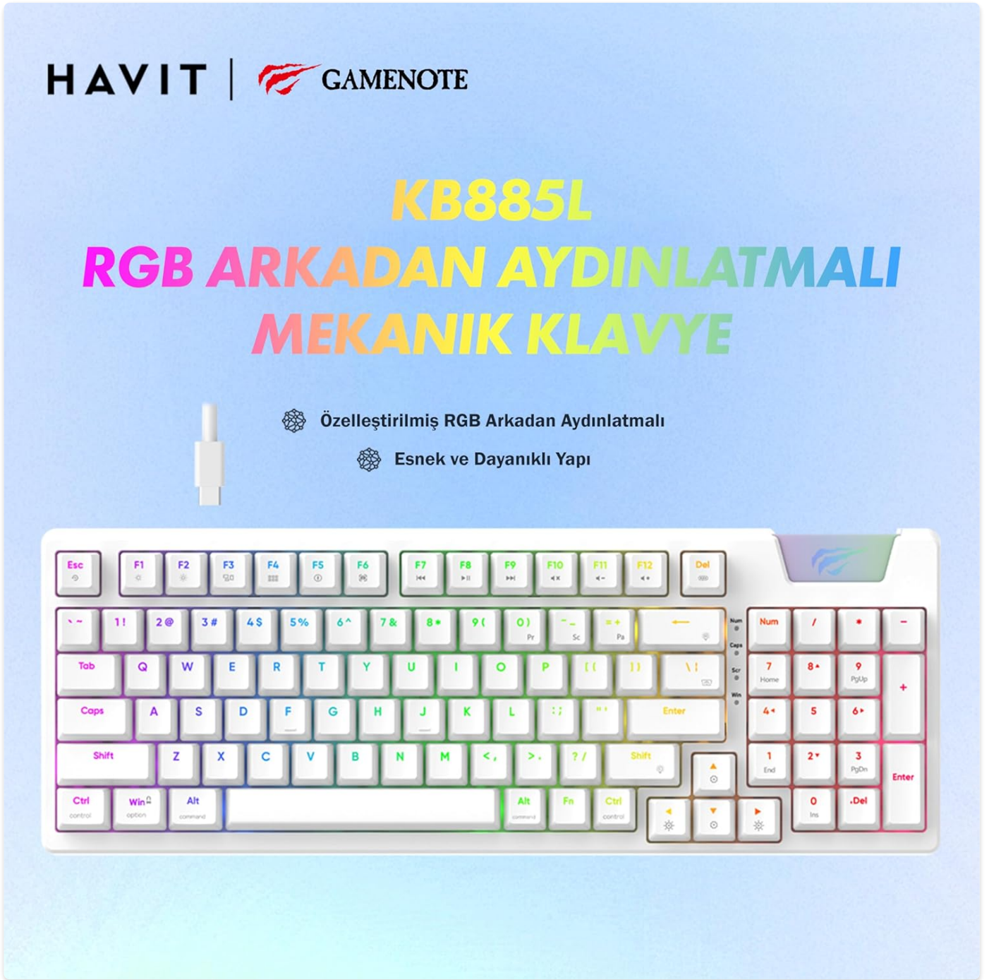
Image: The Havit Gamenote KB885L keyboard displaying its vibrant RGB backlighting, illustrating customizable lighting effects.