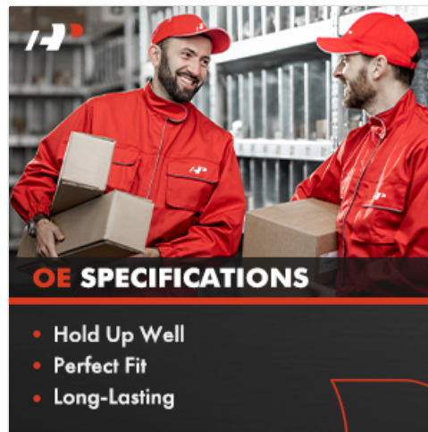
Image: A-Premium engine mounts are designed to meet OE specifications, ensuring durability and a precise fit.