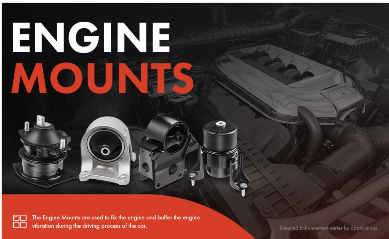
Image: A selection of A-Premium engine mounts, highlighting their function in stabilizing the engine and absorbing vibrations

This manual provides essential information for the A-Premium Front Engine Motor Mount Kit, Model A5390. This kit is designed to replace worn or damaged engine mounts in compatible vehicles, ensuring proper engine stability and reducing vibration. Adherence to these instructions will help ensure correct installation and optimal performance.