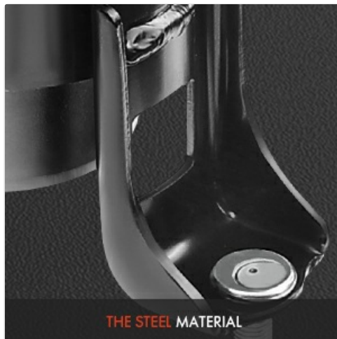
Image: The steel components used in the construction of the engine mount.