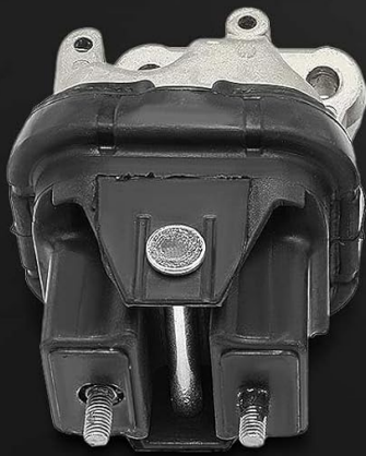
Engine Motor Mount-Front Ref No. A5390