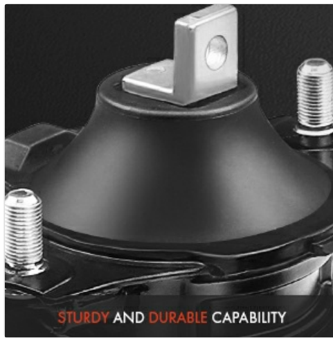
Image: Detail of the sturdy and durable construction of an A-Premium engine mount.