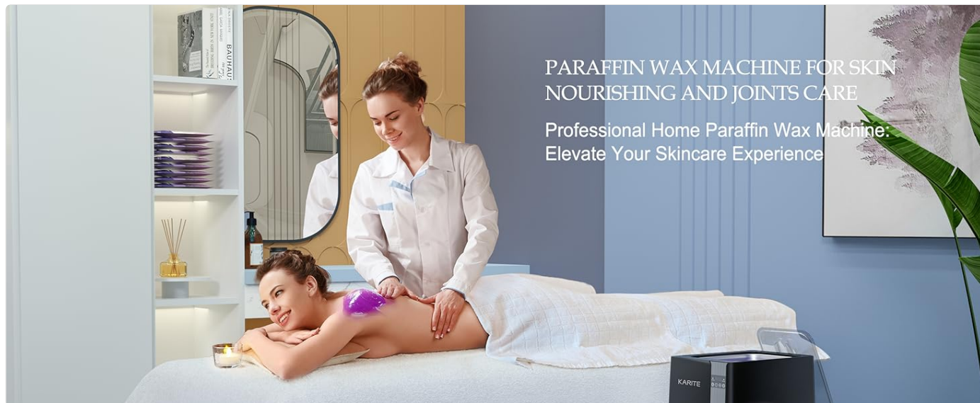
Image: Overview of the KARITE Paraffin Wax Machine and its included accessories, such as wax blocks, thermal mitts, and plastic gloves.